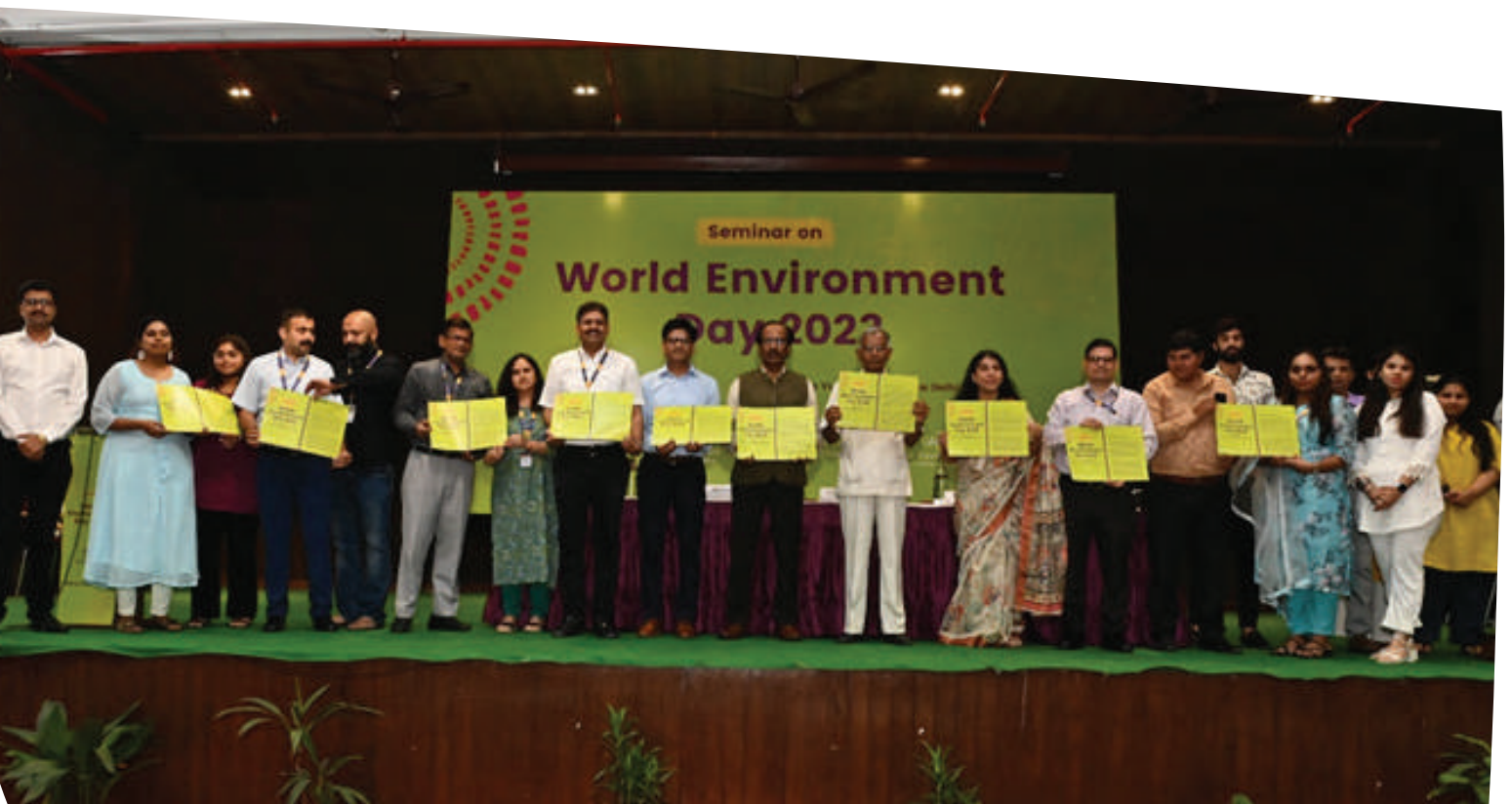
Event launch of a nationwide campaign on 'World Environment Day 2023'

The event was also the launching pad of a nationwide campaign on 'World Environment Day 2023' from June 5 to July 5, 2023, where VYK, in order to observe World Environment Day and also to join hands in the global effort to take climate action, was organising various developmental activities at the grassroot level in collaboration with 29 NGO partners in 14 states. The nationwide campaign would include seminars, workshops, conferences, rallies, and massive tree plantation drives with the active involvement of corporations, non-government organisations (NGOs), community-based organisations (CBOs), educational institutions, PRIs, etc.