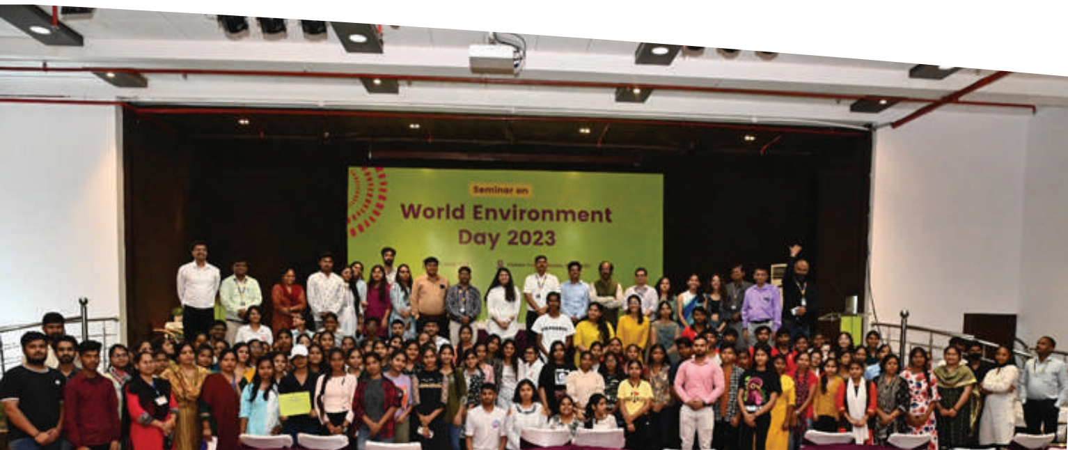
Event group picture after valedictory session