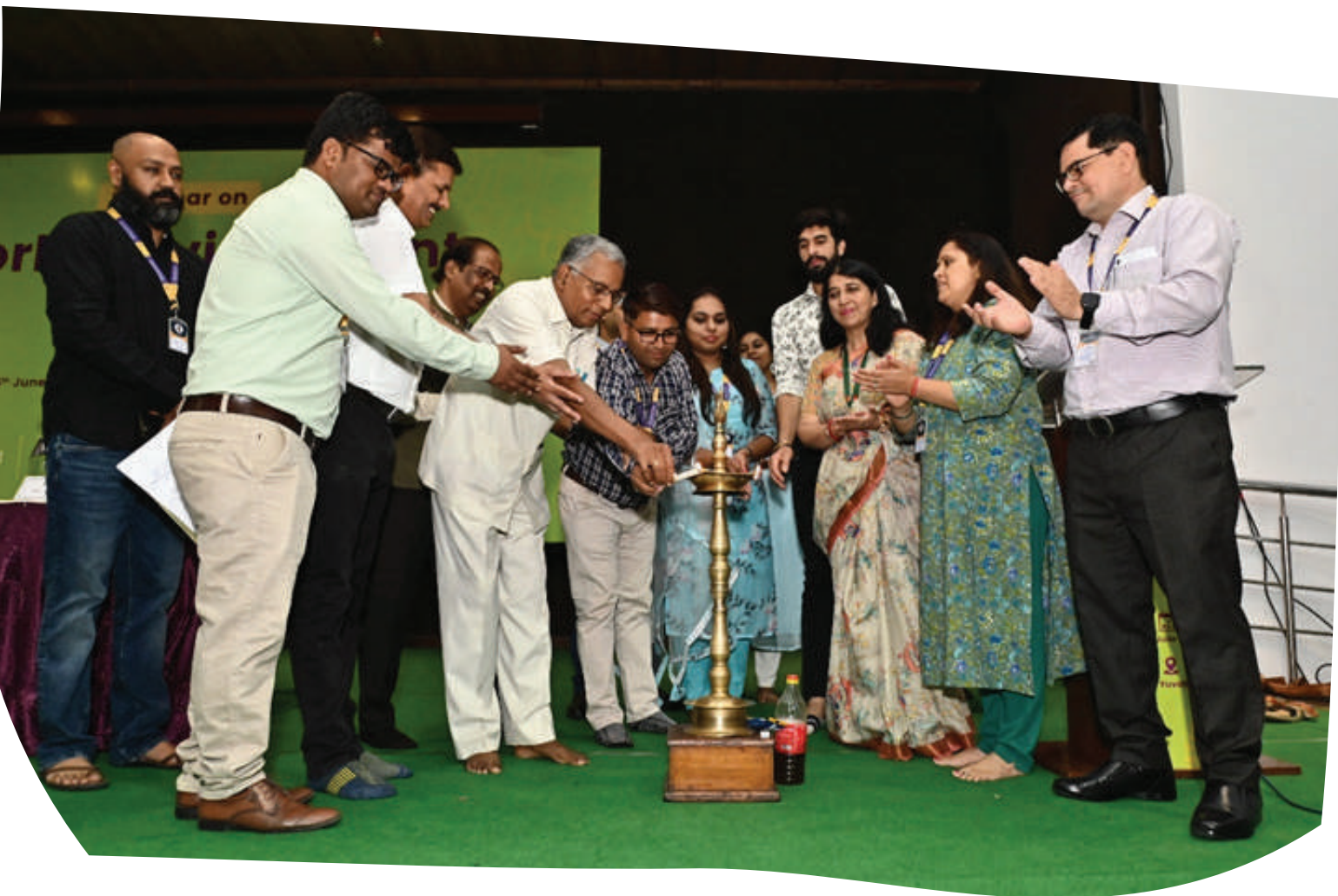
Lighting of the lamp in the inaugural session of the event