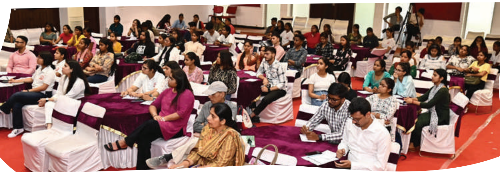
Participants attending the event

World Environment Day serves as a powerful reminder of our shared responsibility to protect and preserve our planet. The efforts of organizations like VYK, through events like the seminar on plastic pollution, play a vital role in raising awareness, fostering cooperation, and inspiring action among individuals and communities. As we collectively strive towards a sustainable future, the significance of engaging diverse stakeholders and implementing effective solutions becomes increasingly evident. The seminar was successful in raising the need and significance of engaging various stakeholders in collective efforts to tackle environmental issues.