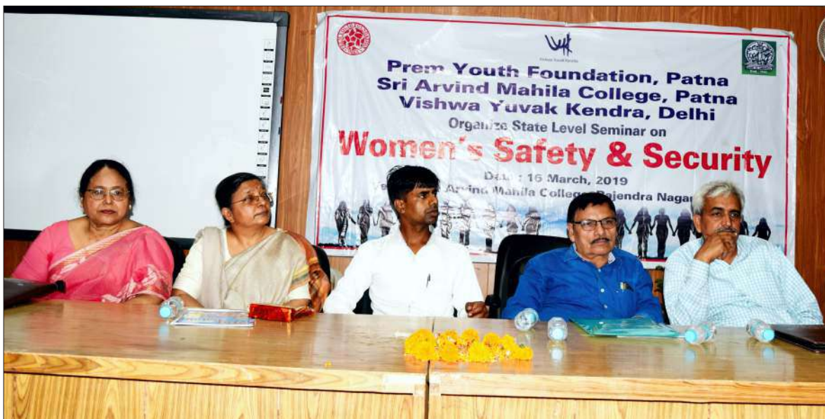
A glimpse of the dignitaries during inauguration