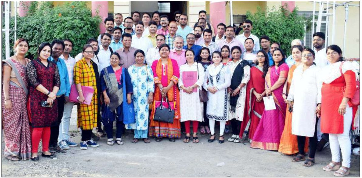
A group photograph of the participants