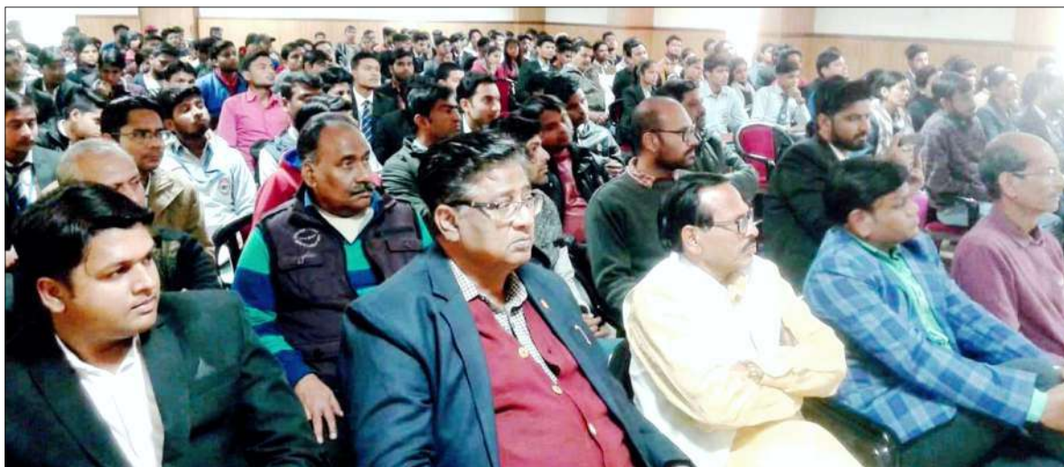
A glimpse of the participants

the participants in his inaugural speech. Key thematic issues were deliberated by the representatives of partnering organization. Besides, other speakers also took interactive thematic panel discussion. 105 representatives from NGOs, CBOs and youth leaders from Madhya Pradesh joined the conference.