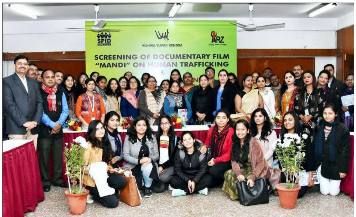
A group photograph of the participants

A pool of eminent resource persons comprised of Members of National Commission for Women, Delhi Commission for Women, Delhi Commission for Protection of Child Rights highlighted the key thematic aspects and urged for carrying out many activities especially in educating and training people at the National, State and Community levels. Former M P, Legal Professionals, Development Professionals,