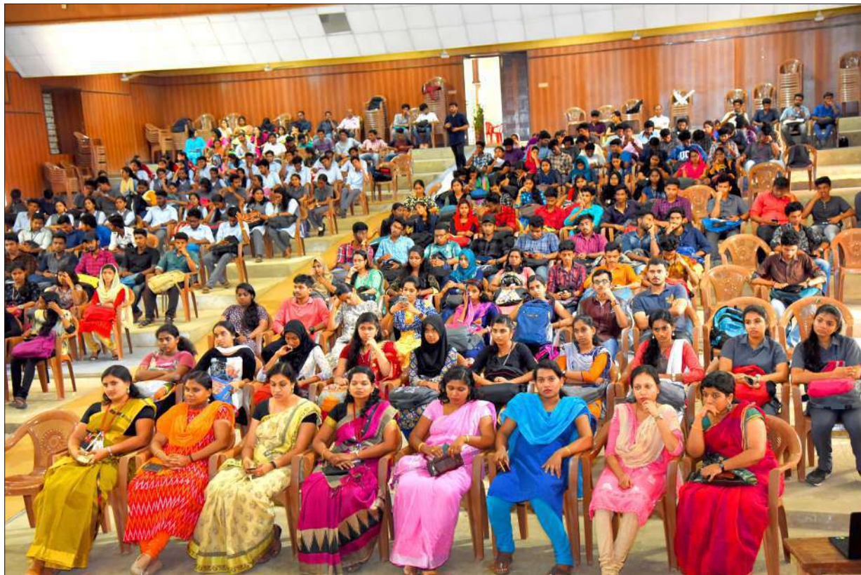
A glimpse of the participants during seminar on "Role of Youth in Disaster Management", Thiruvananthapuram, Kerala (06 February, 2019)