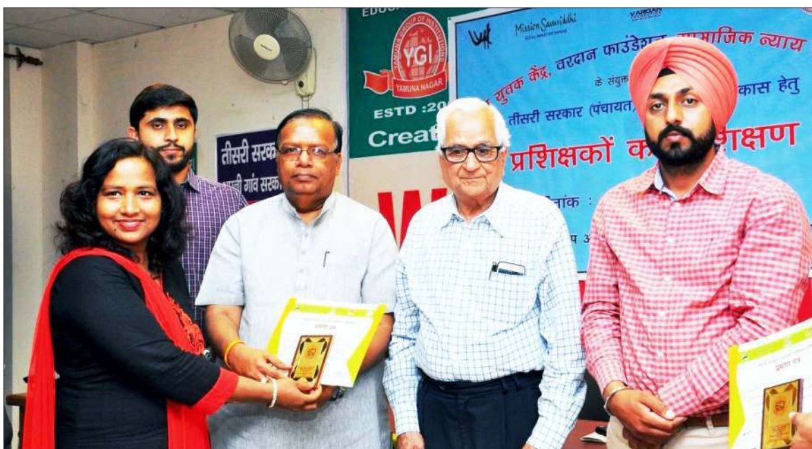
A glimpse of the inaugural session

Foundation and Citizenship Development Society from 24 to 28 March, 2019 at Yamuna Nagar, Haryana. The panel