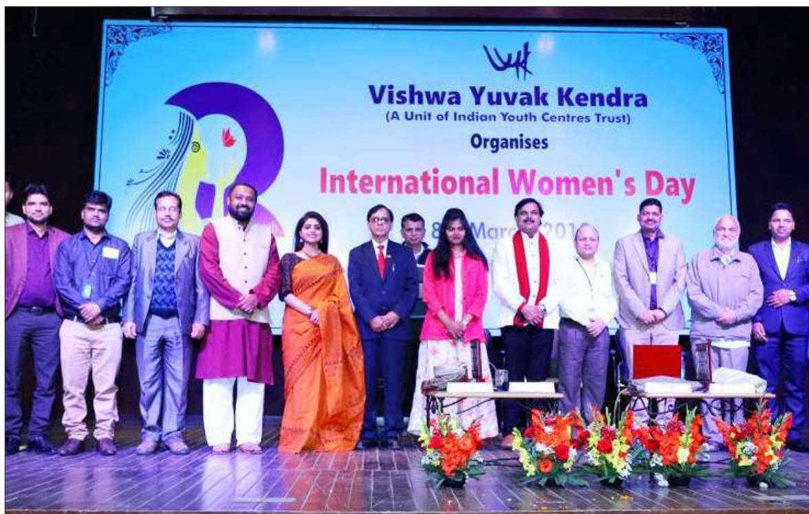
A group photograph of poets and resource persons