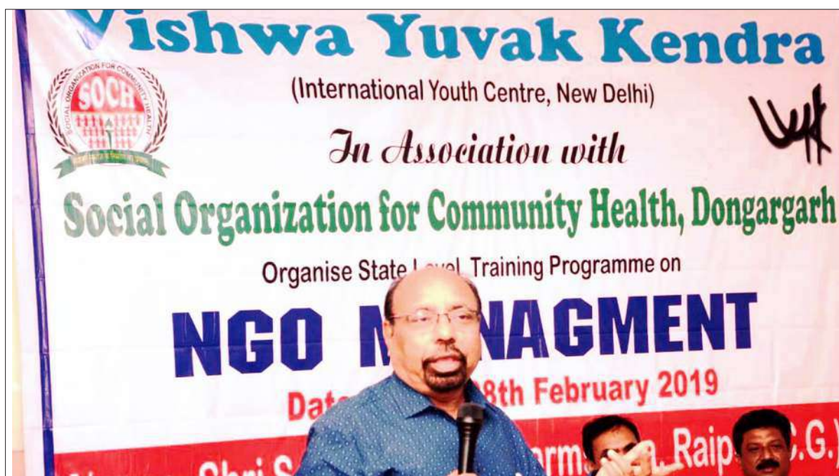
A glimpse of the ongoing session

Vishwa Yuvak Kendra and Social Organization for Community Health (SOCH) jointly organized a two-day training programme on “NGO Management” from 07