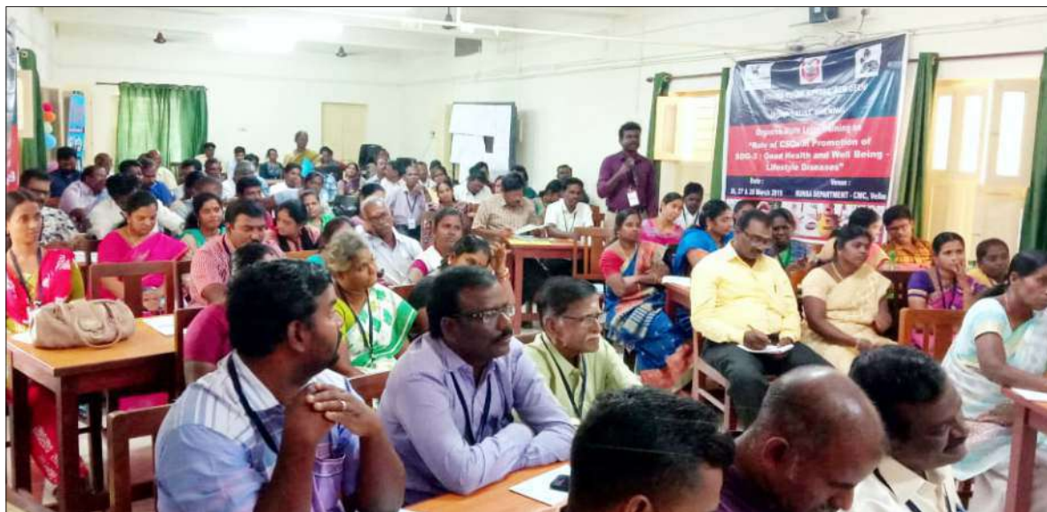
A participant is posing query to the speaker

A pool of eminent medical experts highlighted on various key thematic aspects and shared the root causes and preventive measures to a number of prevalent life style