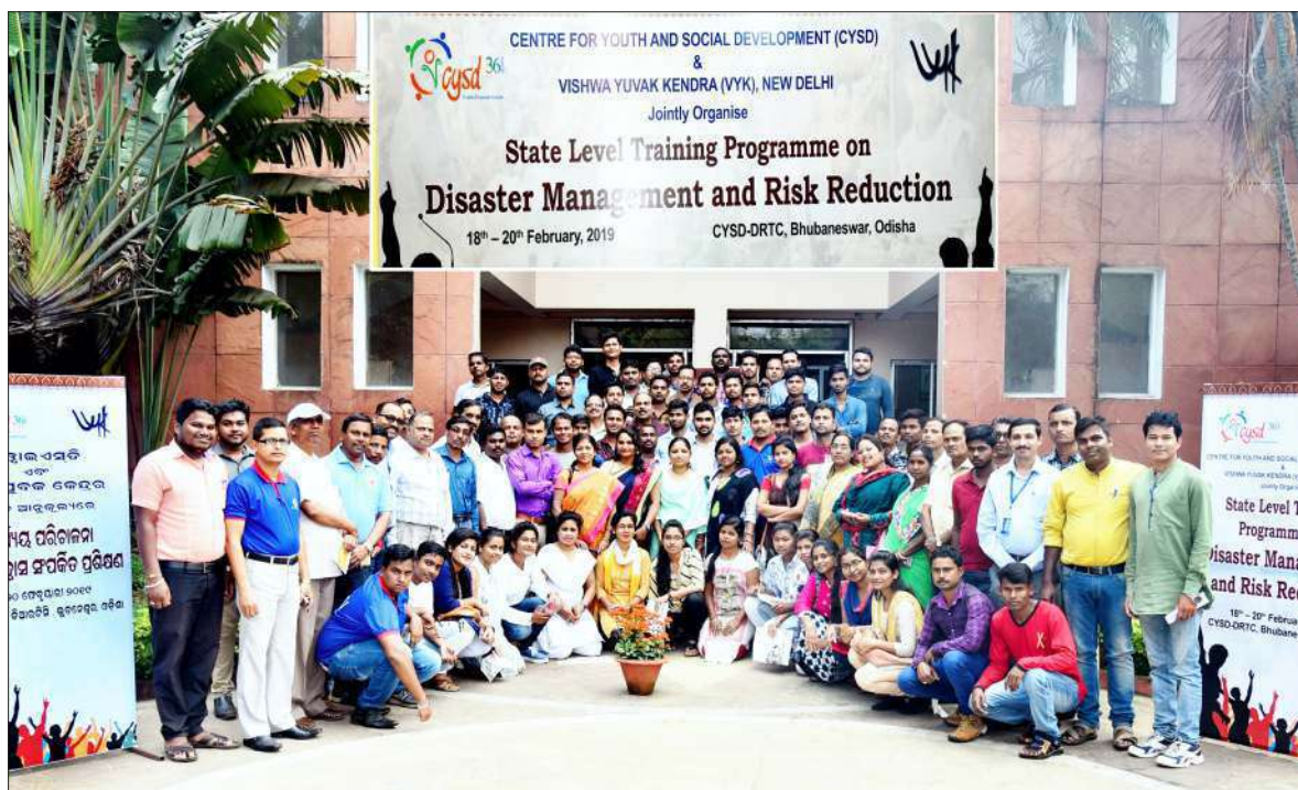
A group photograph of the participants

representatives of NGOs, VO, CBOs, faculty members and students from 15 districts of Odisha actively participated in the programme.