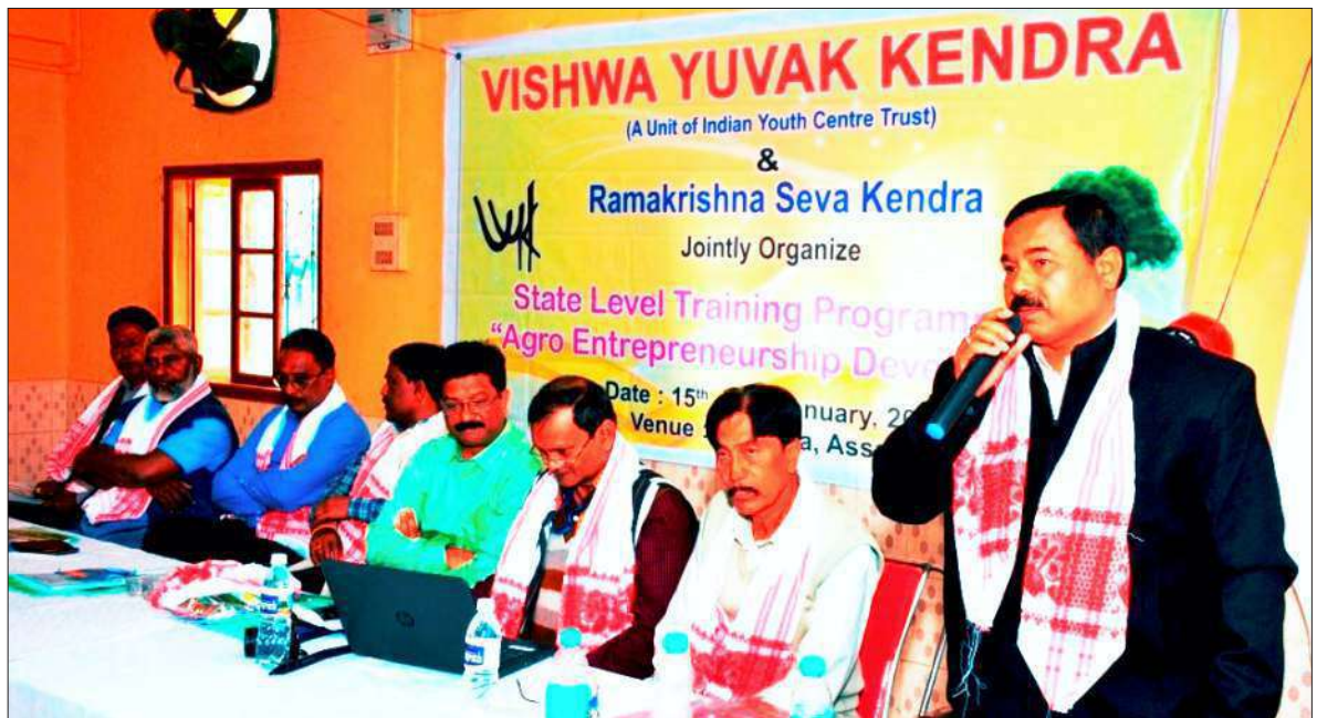
A glimpse of the inauguration