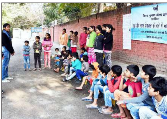
The Group photographs of the beneficiaries