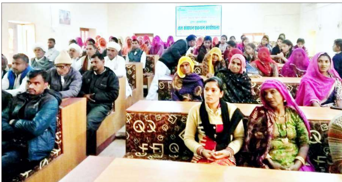
A glimpse of the participants

of workshop was to sensitize participants and deliberate on various key thematic aspects. 132 participants from NGOs, CBOs and Students of Rajasthan participated in the workshop.