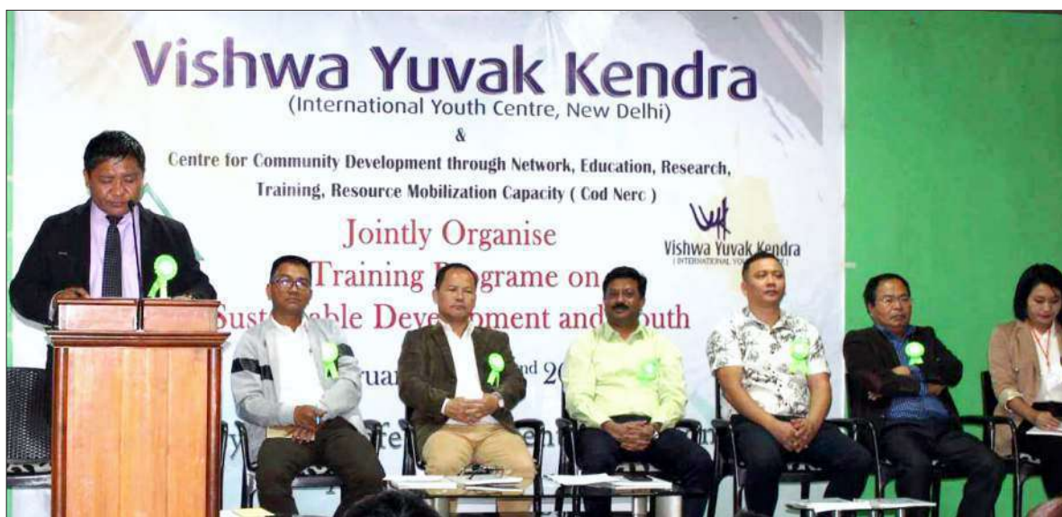
A resource person is addressing the participants

jointly organized a two-day training programme on "Sustainable Development Youth" from 21 to 22 February, 2019 at Aizawl, Mizoram. The programme was