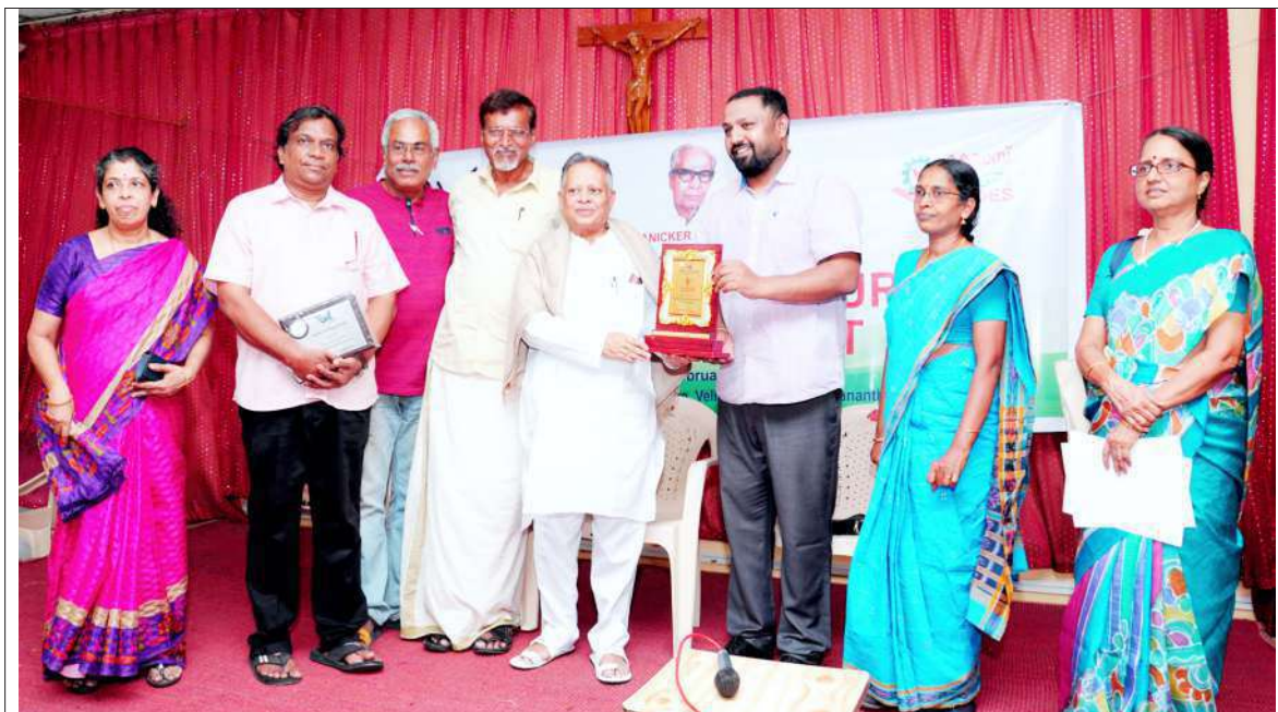
A glimpse of the inauguration