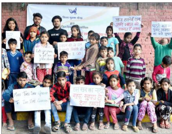
The Group photographs of the beneficiaries