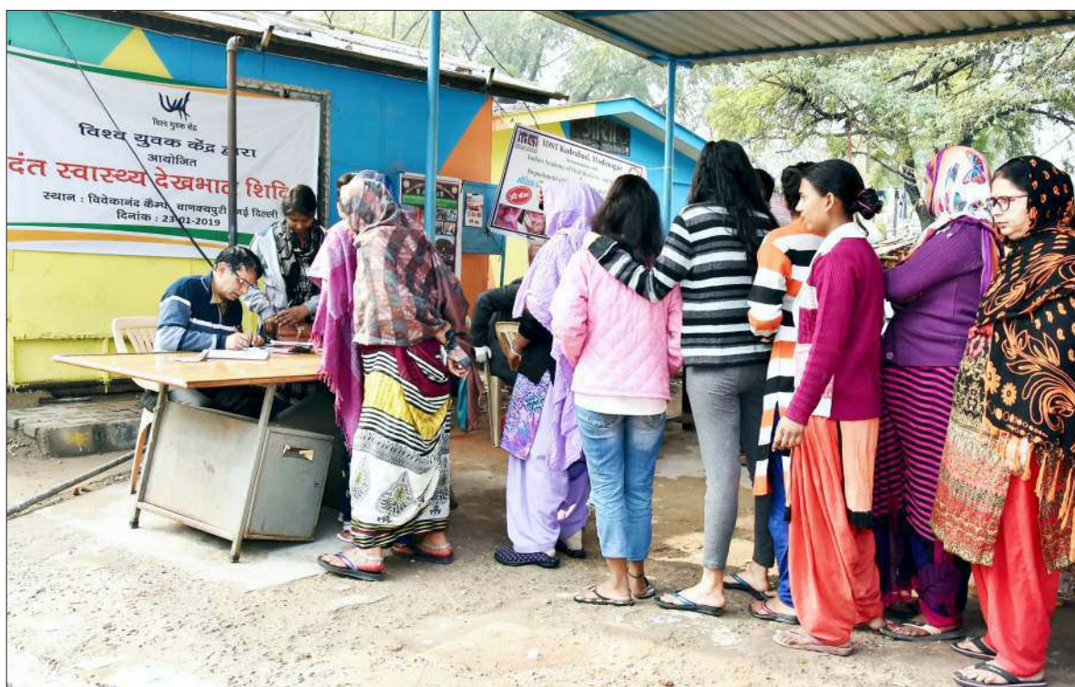
The community people are being registered

IDST Kadrabad, Modi Nagar, Uttar Pradesh diagnosed and treated the people. Besides, some people were offered with tooth pastes and tooth brushes to protect their teeth. A total of 110 patients were covered in the camp.