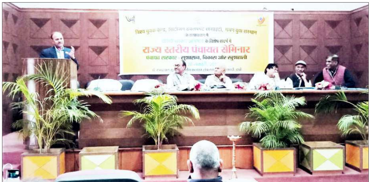
A glimpse of ongoing session

implementation and delivery. The 73rd Constitutional Amendment Act, 1992 marked a new era in the democratic set up as it created PRI as tiers of self-governance