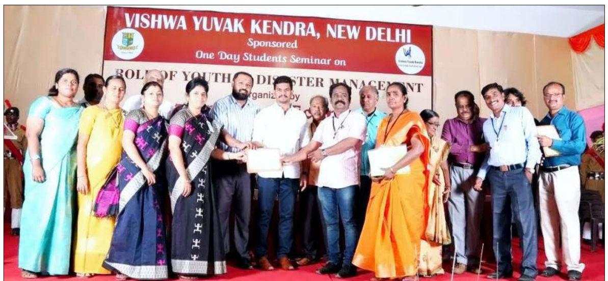
A group photograph of the participants

youth towards their prospective role in Disaster Management. 1687 students from several educational institutions of the state enthusiastically participated in the seminar.