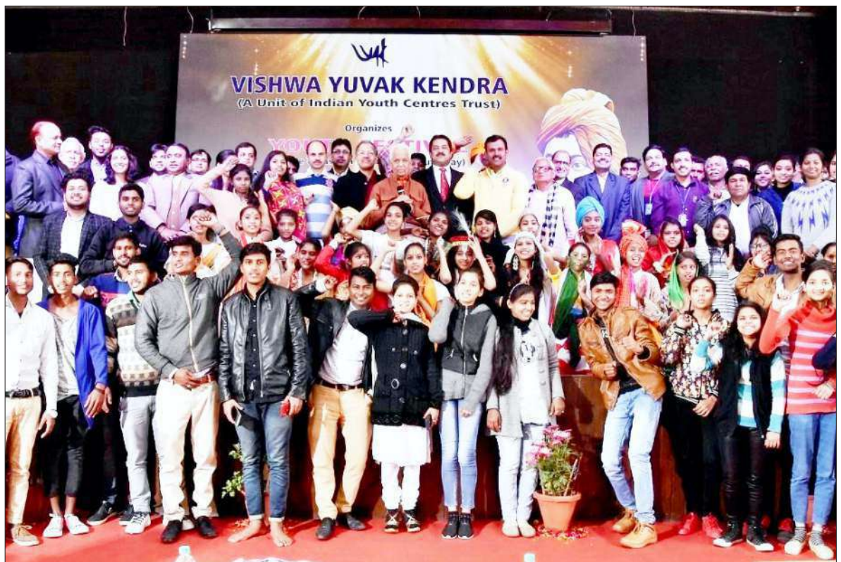
A group photograph of the participants

The festival was full of deliberations and thought provoking panel discussion to stimulate the participants led by a pool of eminent resource parsons. Special feature of programme was to highlight the glorious heritage and culture of our country through organizing the rich cultural performances.