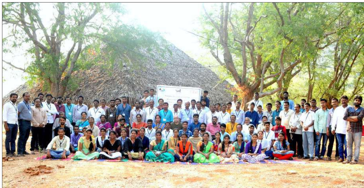
A group photograph of the participants