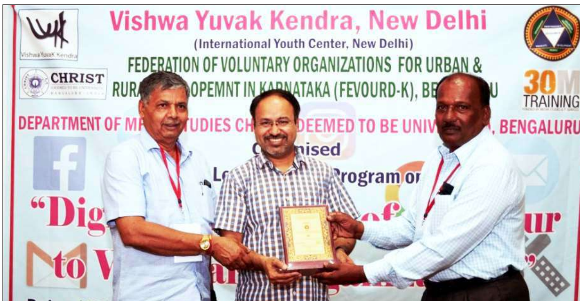
A resource person is being felicitated