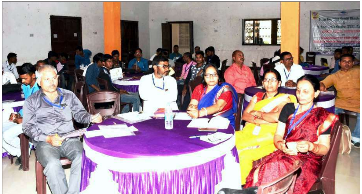
A glimpse of the participants

Bihar. A panel discussion on main thematic aspects was held by eminent resource persons. 100 representatives of NGOs and youth from various parts of state actively participated in the workshop.