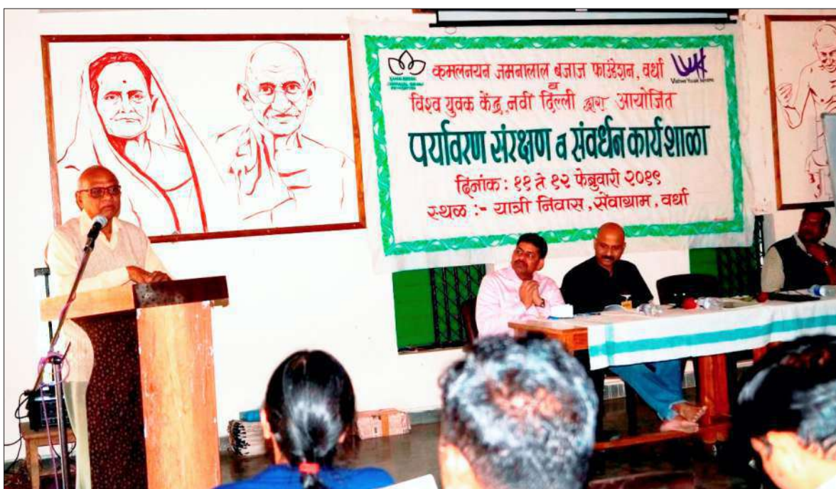
A glimpse of the inauguration

thematic issues and challenges in their addresses. The participants were imparted training on various environmental aspects. Several panel discussions were held by eminent panelists on different thematic aspects i.e. Resources Conservation and Management, Environmental Issues, Global Warming, Livelihood, Sustainable Development. 100 representatives from NGOs, VOs and CBOs from Maharashtra state actively participated in the programme.