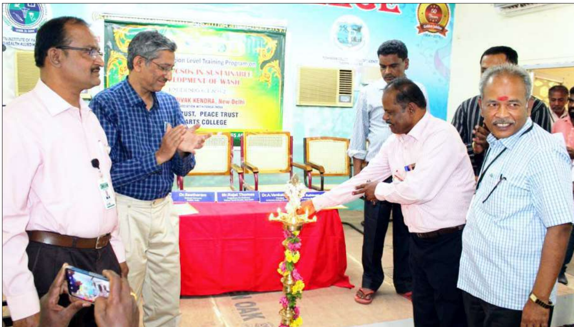
A glimpse of the inauguration

conjointly with FANSA India, GTN Arts College, VAIGAI Trust and Peace Trust from 03 to 05 January, 2019 at Dindigul, Tamilnadu. 132 representatives of NGOs from Southern Region of India actively participated in the programme.