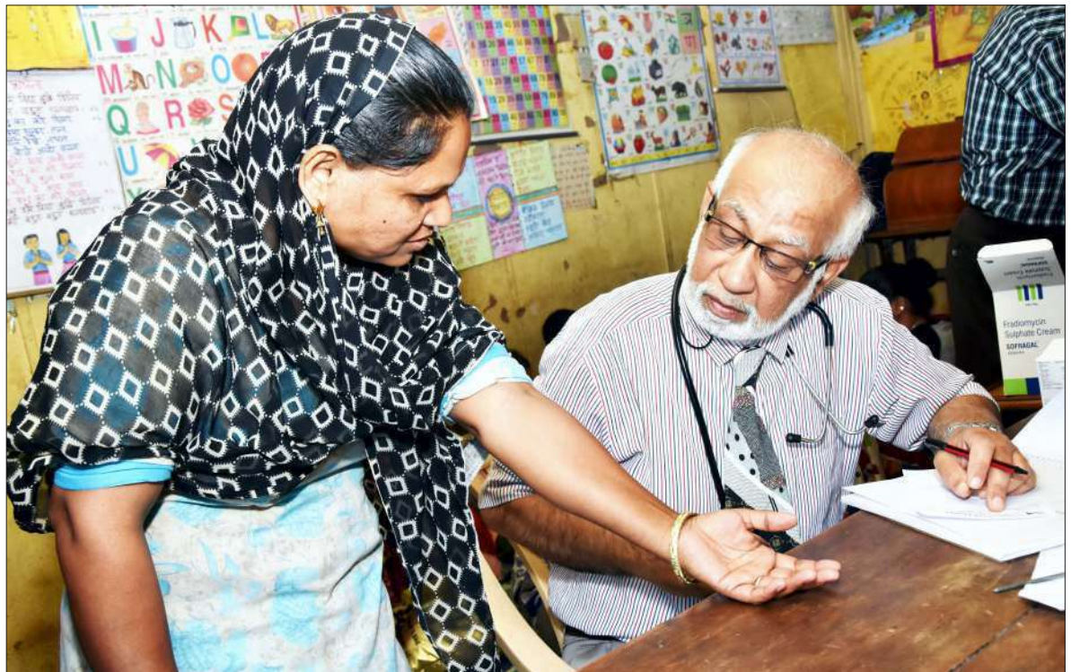
The Doctor is detecting the infection

with the people. Various skin diseases of people were diagnosed and treated during the camp. The special Health camp created a mass community health awareness among the people.