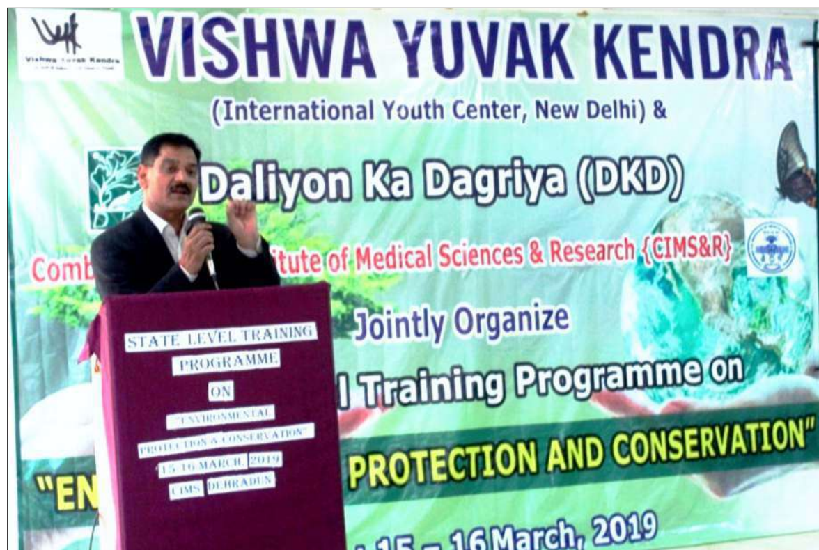
A glimpse of session

Eminent speakers addressed on key thematic aspects during the panel discussion. 120 representatives from NGOs and educational institutes of Uttarakhand actively participated in the programme.