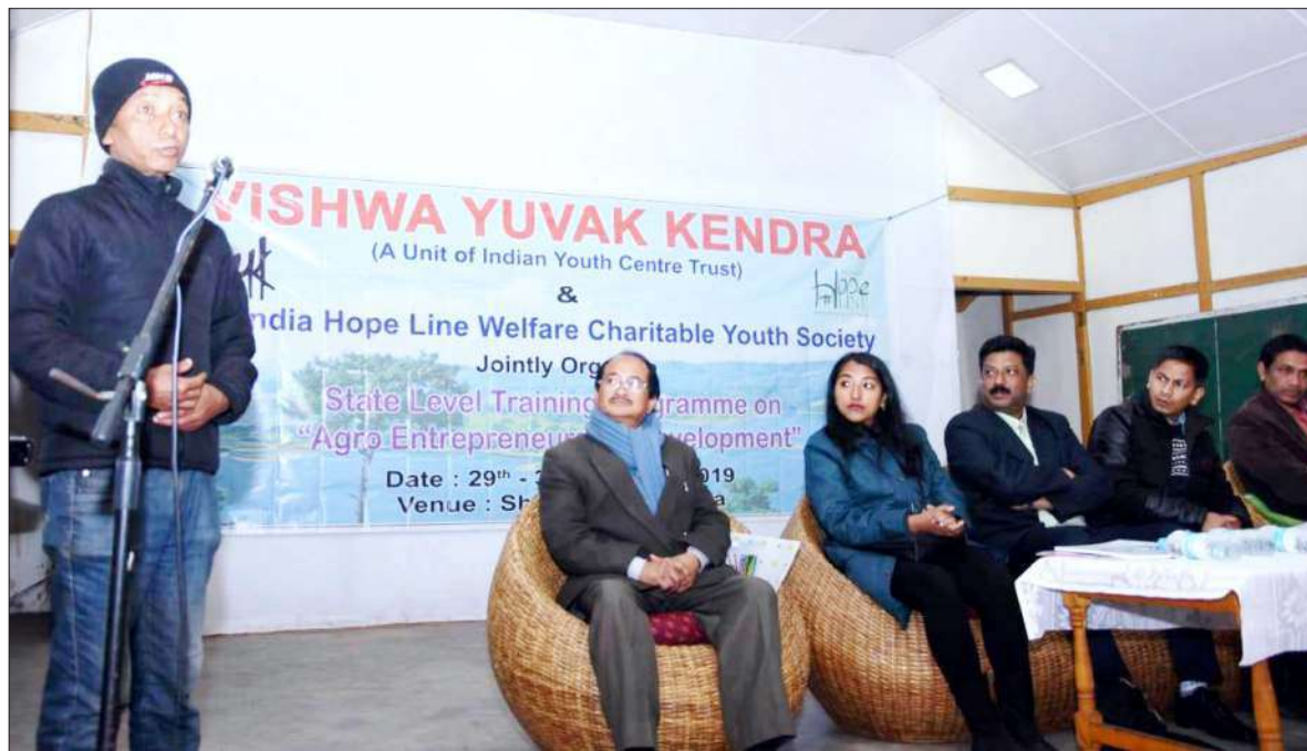
A view of the inauguration

Organizations from Assam, Arunachal Pradesh and Meghalaya actively participated in the programme.