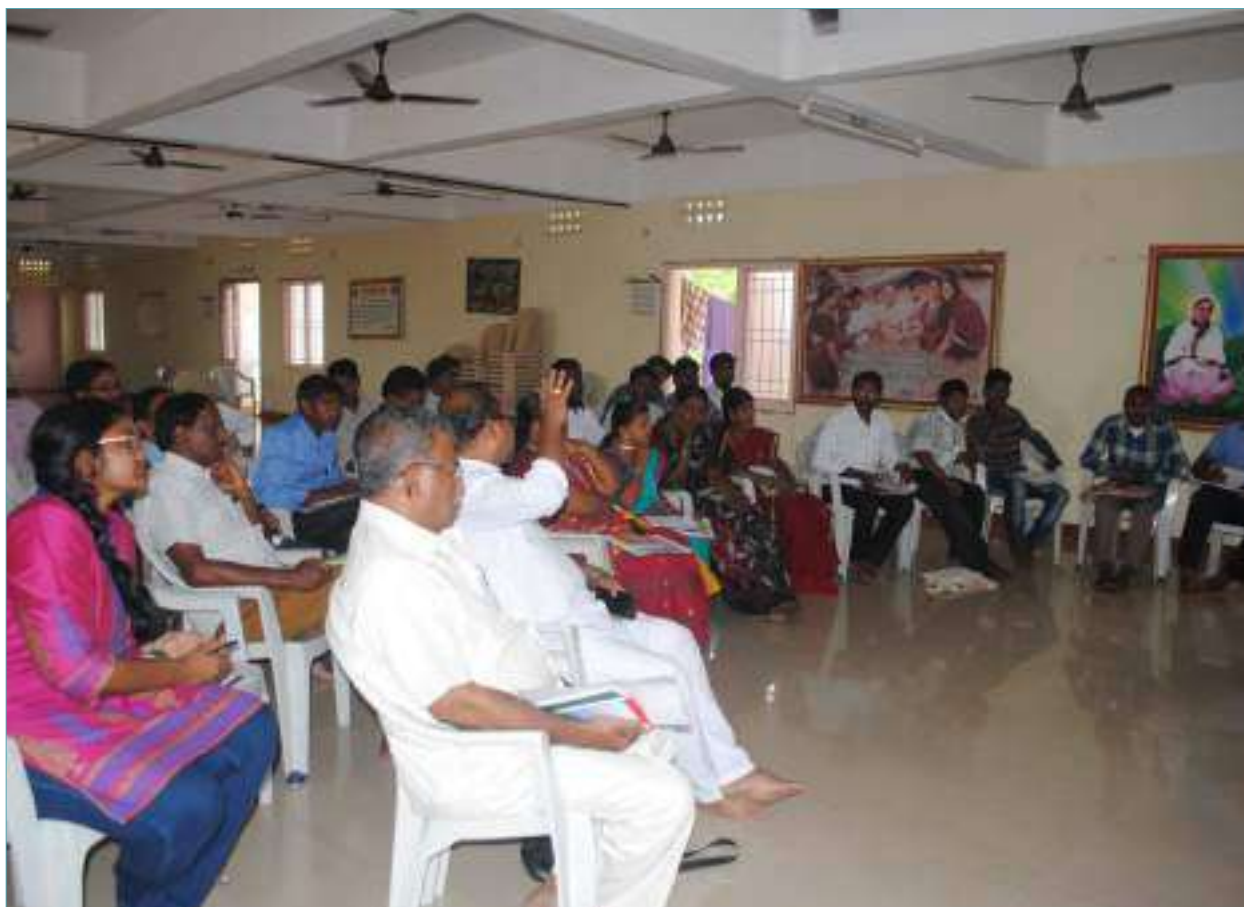
A view of ongoing Programme

Apart from the sessions, cultural event was also organized which was the centre attraction of the programme.