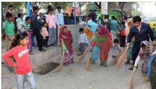
Community people involved in cleaning the lane

VYK organized an awareness generation programme on 'Swachata Abhiyan' through street play and cleanliness drive at Vivekanand Camp, Chanakyapuri on 19 December, 2016. The event was organized to promote 'Clean India Drive' in the community. The event was conducted with the help of a theatre group along with local youth, children and women.