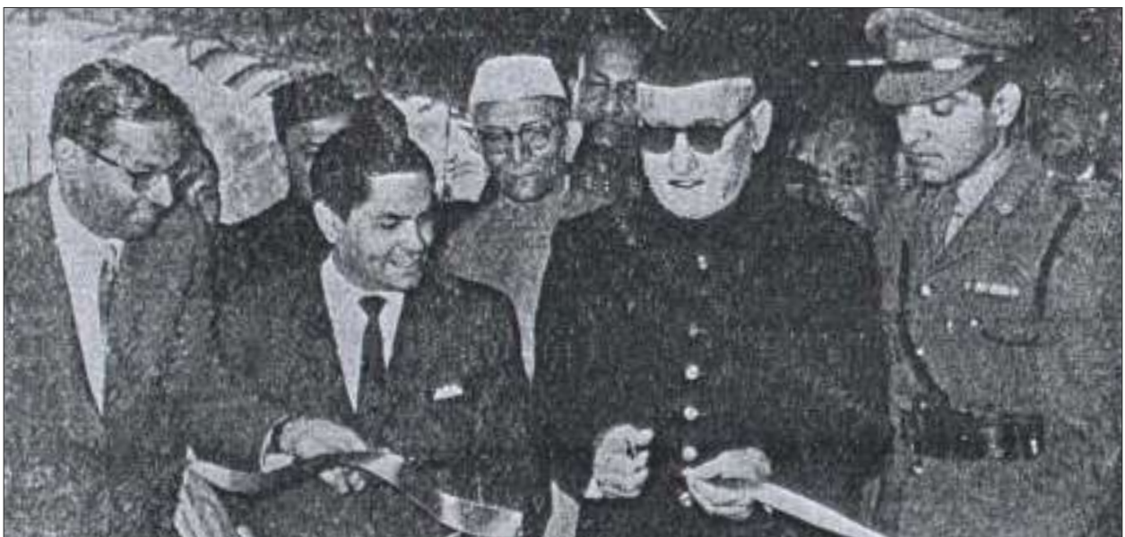
Dr. Zakir Husain, the then President of India, inaugurating the building of Vishwa Yuvak Kendra