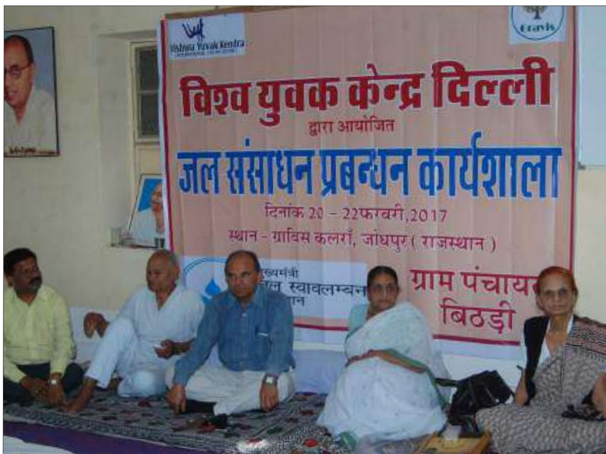
Distinguished dignitaries during the inaugural session

Total 108 persons belonging to NGOs, CBOs and local institutions engaged in different fields of community development actively took part in the training.