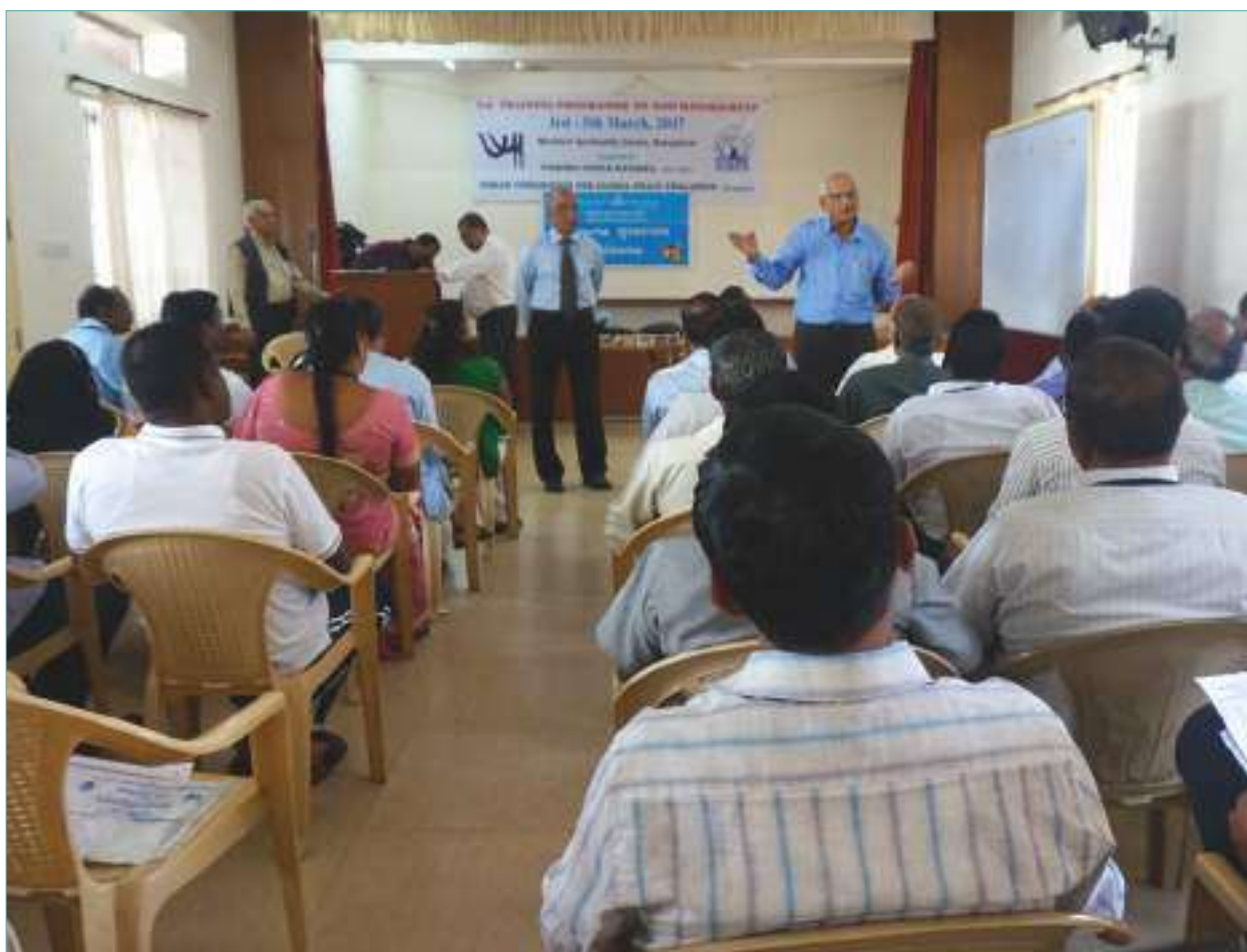
A glimpse of ongoing session