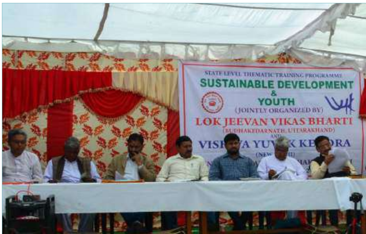
Distinguished dignitaries during the inaugural session

The efforts being made by VYK and LJVB to enhance the capacity of youth and sensitize them to contribute for the society was well appreciated and participants expressed their views that such type of programmes should be conducted on regular basis.