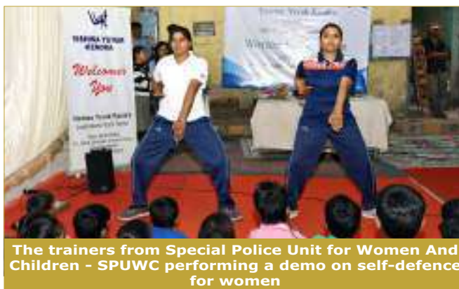
The trainers from Special Police Unit for Women And Children - SPUWC performing a demo on self-defence for women

The basic objective of the event was to make community women familiar with various techniques for self-protection. Stage performances covering different tactics of women self - defense were demonstrated through role play.