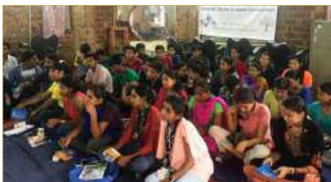
An Awareness Programme on Computer Literacy and Career Development