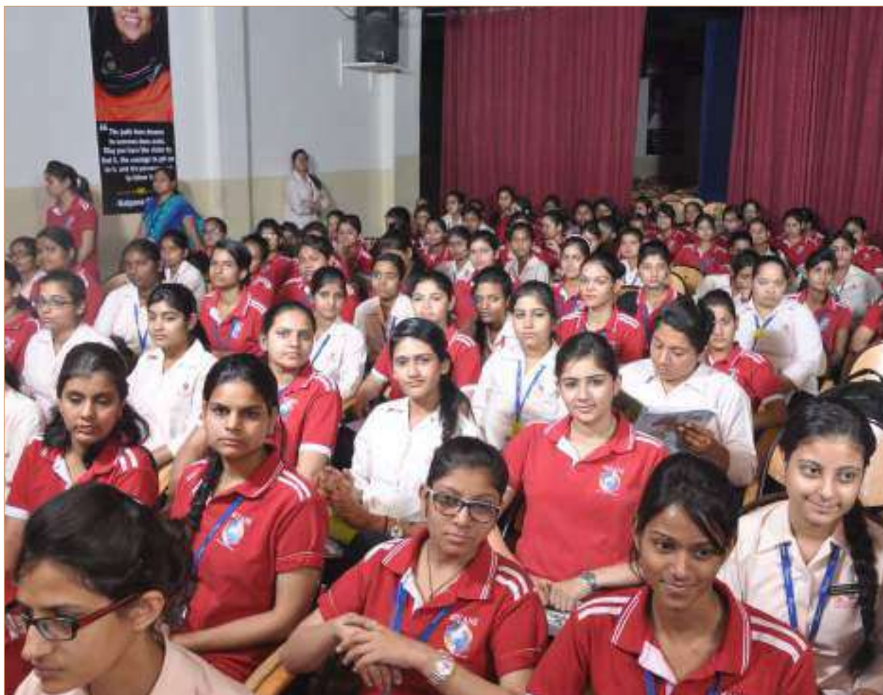
Active participation of students during the event