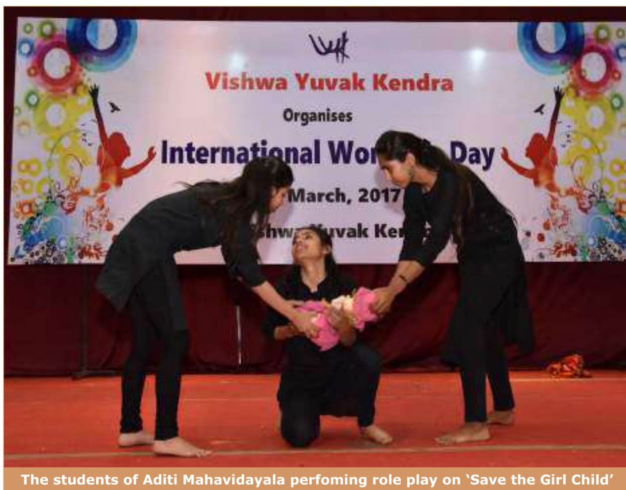
The students of Aditi Mahavidyalaya performing role play on 'Save the Girl Child'