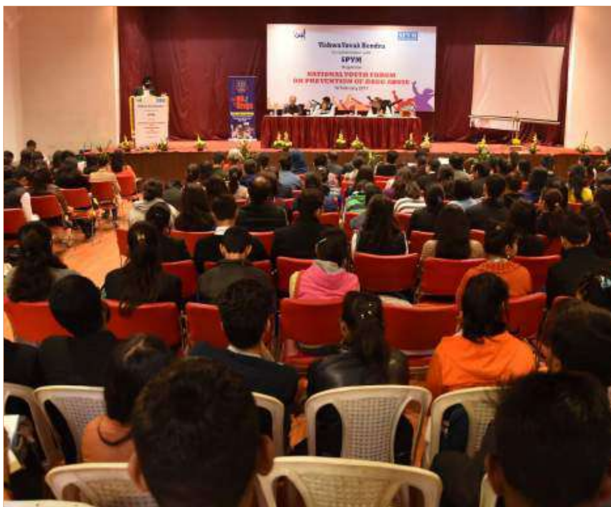
A session of the event in progress