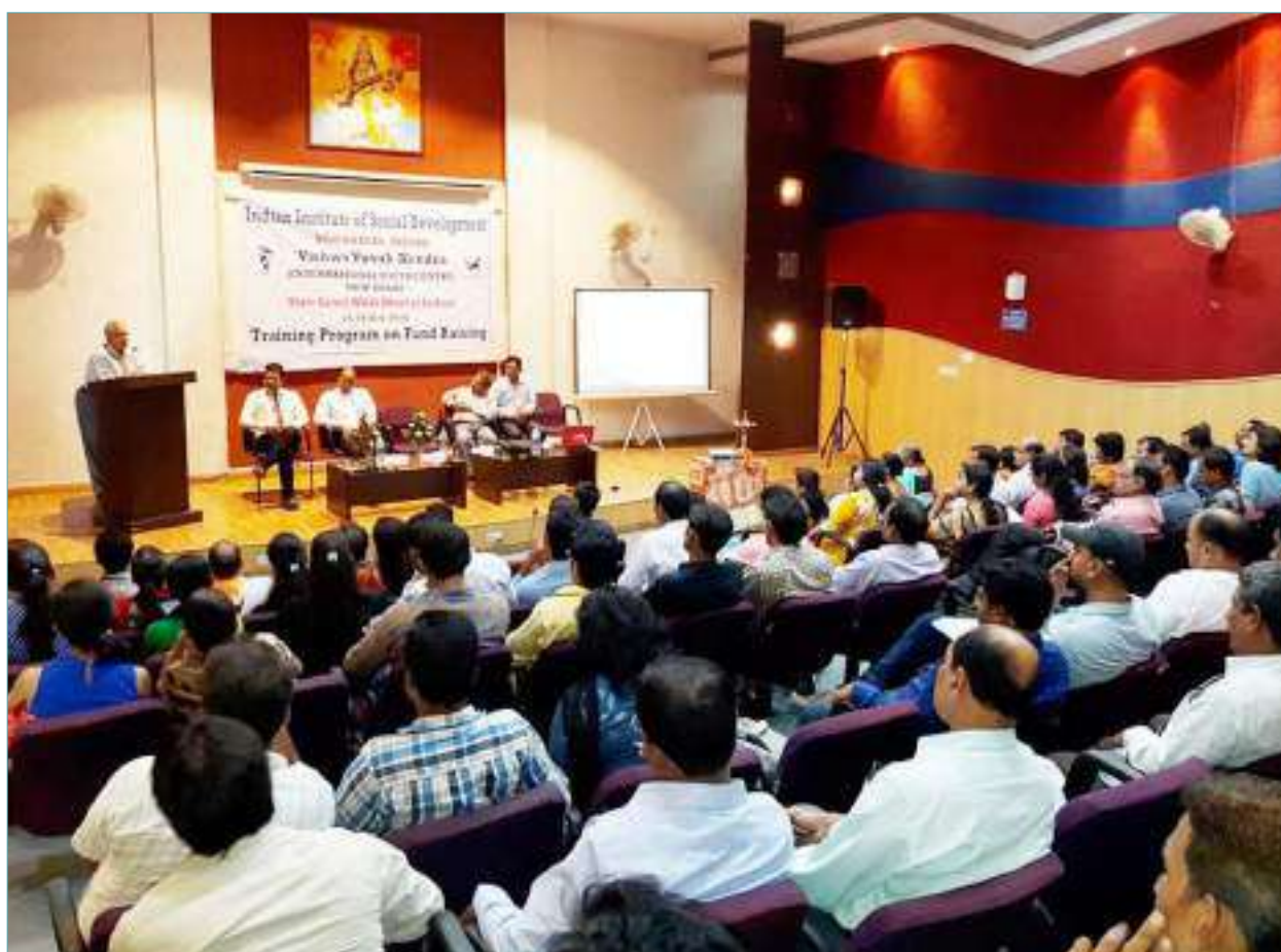
A view of ongoing programme session