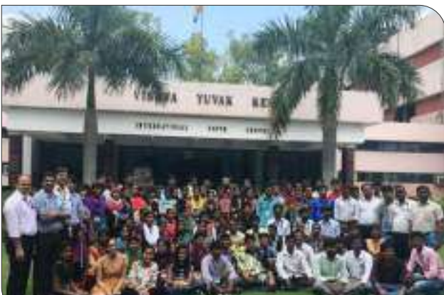
A group photograph of MSW students, Gulbarga University