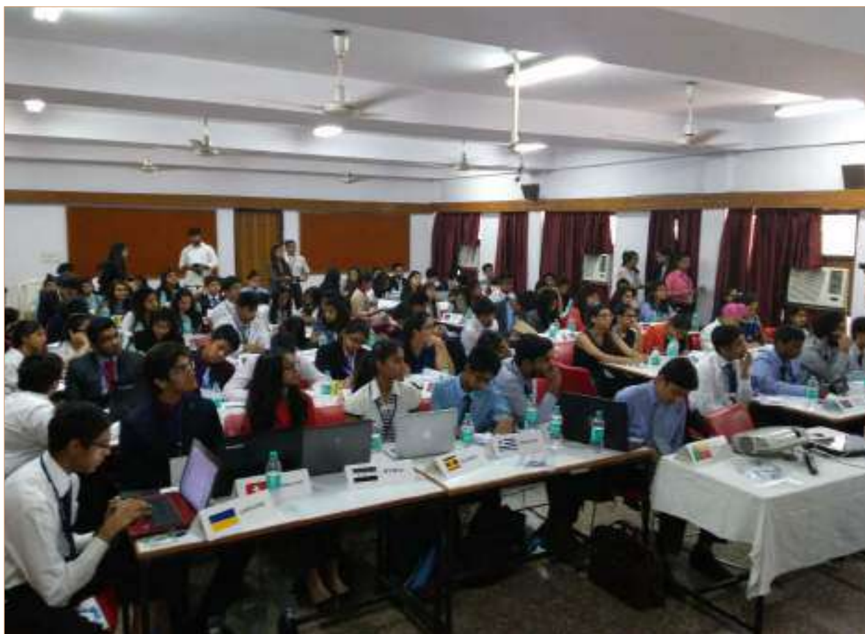
A glimpse of ongoing session