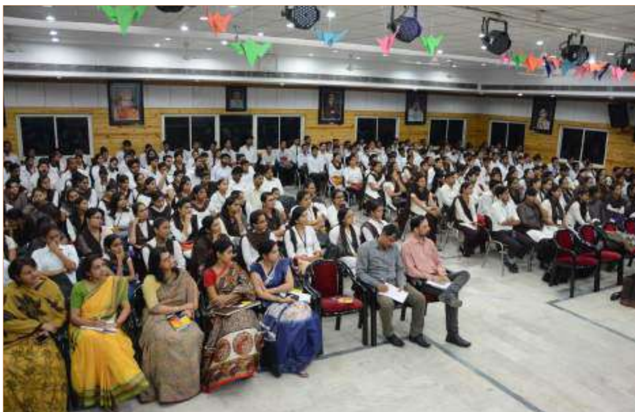
The distinguished invitees are doing prayer

The young students, who were present during the event actively participated and interacted with the guests.