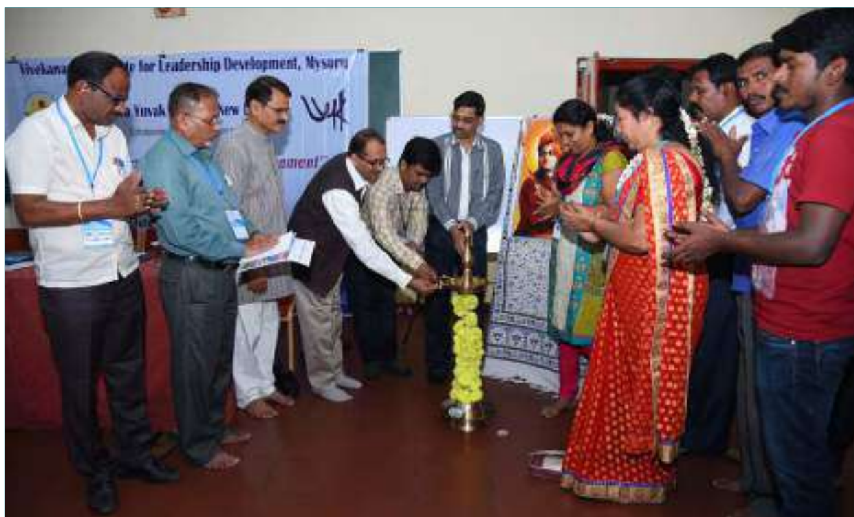
Programme is being inaugurated with lighting the lamp