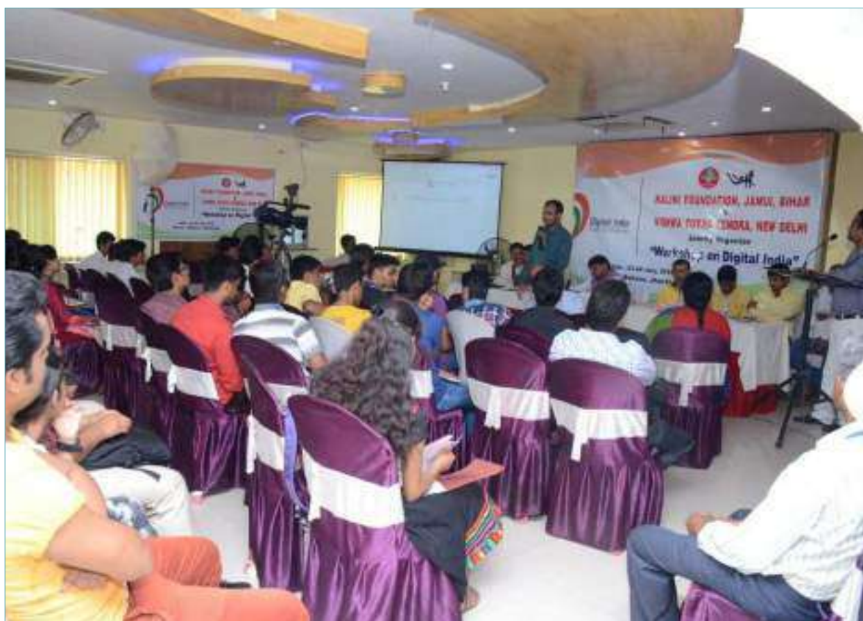
A glimpse of ongoing training programme

Total 129 participants from various NGOs, and educational institutions enthusiastically participated in the seminar.