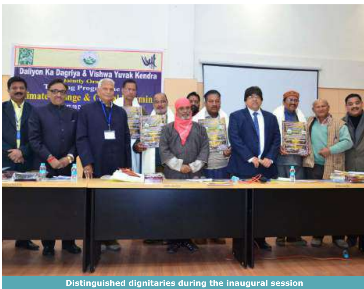
Distinguished dignitaries during the inaugural session

Total 137 trainees comprising NGO representatives from Pauri Garhwal, Tehri Garhwal and faculties of HNBG University actively participated in the programme.