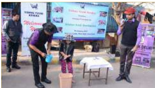
A demonstration on proper and washing

The audience were imparted know how about importance of water and key elements of saving it besides maintaining proper sanitation. In addition, the community children were also taught proper method of hand washing necessary for disease free lives.