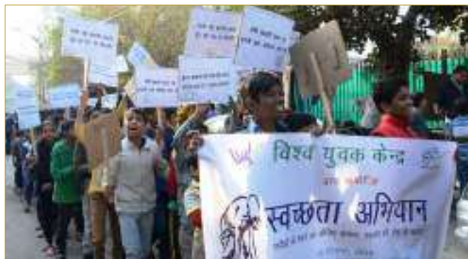
A rally on Swachhta Abhiyan by community children

VYK organized another awareness generation programme on Swachata Abhiyan, a clean drive and rally - this time through a puppet show, on 28 December, 2016 at Shankar Camp. The purpose of the event was to sensitize and inspire people towards Clean India Drive. The event also focused on motivating the youth, women and children towards need of having hygienic environment in their surroundings.