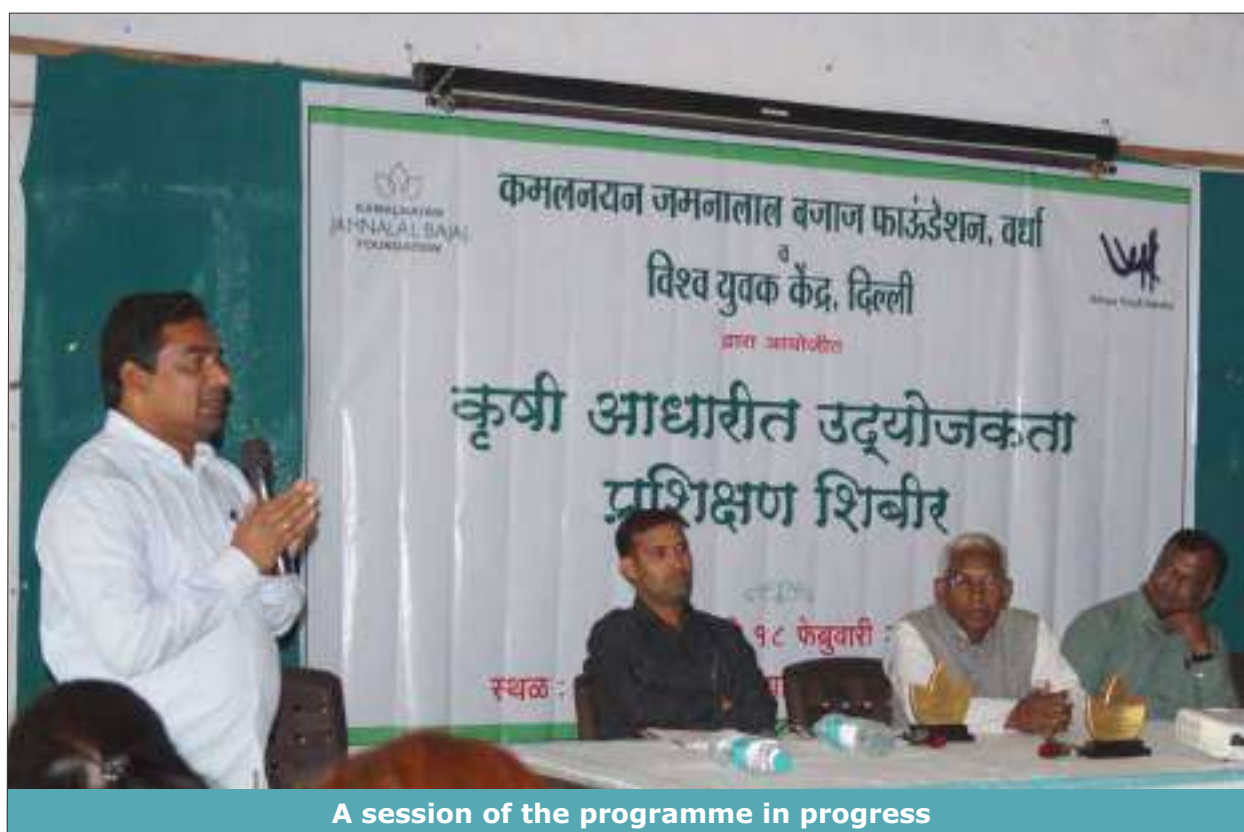
A session of the programme in progress

The event was actively attended by 72 representatives from 20 organizations of Wardha, Amaravati, Yawatmal, Bhandara, Chandrapur and Nagpur districts of Maharashtra.