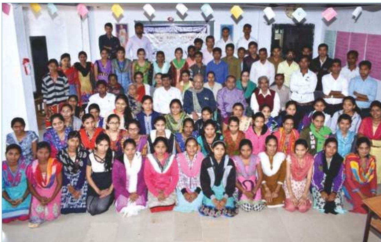
A group photograph of the participants

The second workshop was organized at 'Jai Korbai Vidya Mandir', Village Kherava in the Mehsana district from 06 - 08 February, 2017.