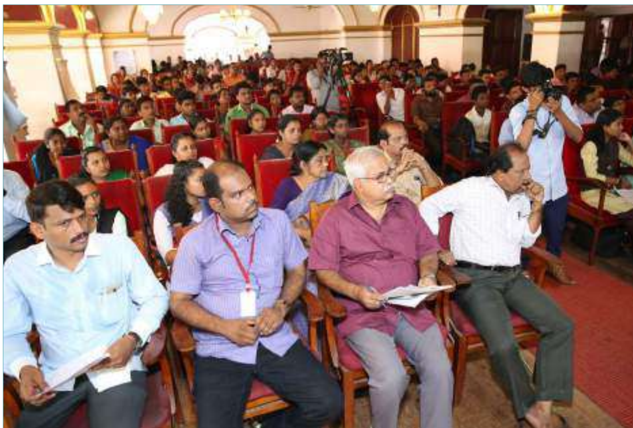
A glimpse of ongoing session