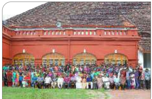
A view of participants, Digital Literacy Programme, Kerala