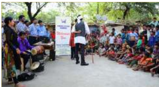
Street play on Health and Hygiene performed by 'Mehak Theatre Group' in progress at Vivekanand Camp

An awareness generation programme on 'Health and Hygiene' was organized through street play at Vivekanand Camp on 20 May, 2016. The event aimed at propagating the 'Clean India Drive' and implement 'Swacch Bharat Abhiyan'. The play covered a number of important health issues like malaria, diarrhea, water borne diseases, etc.