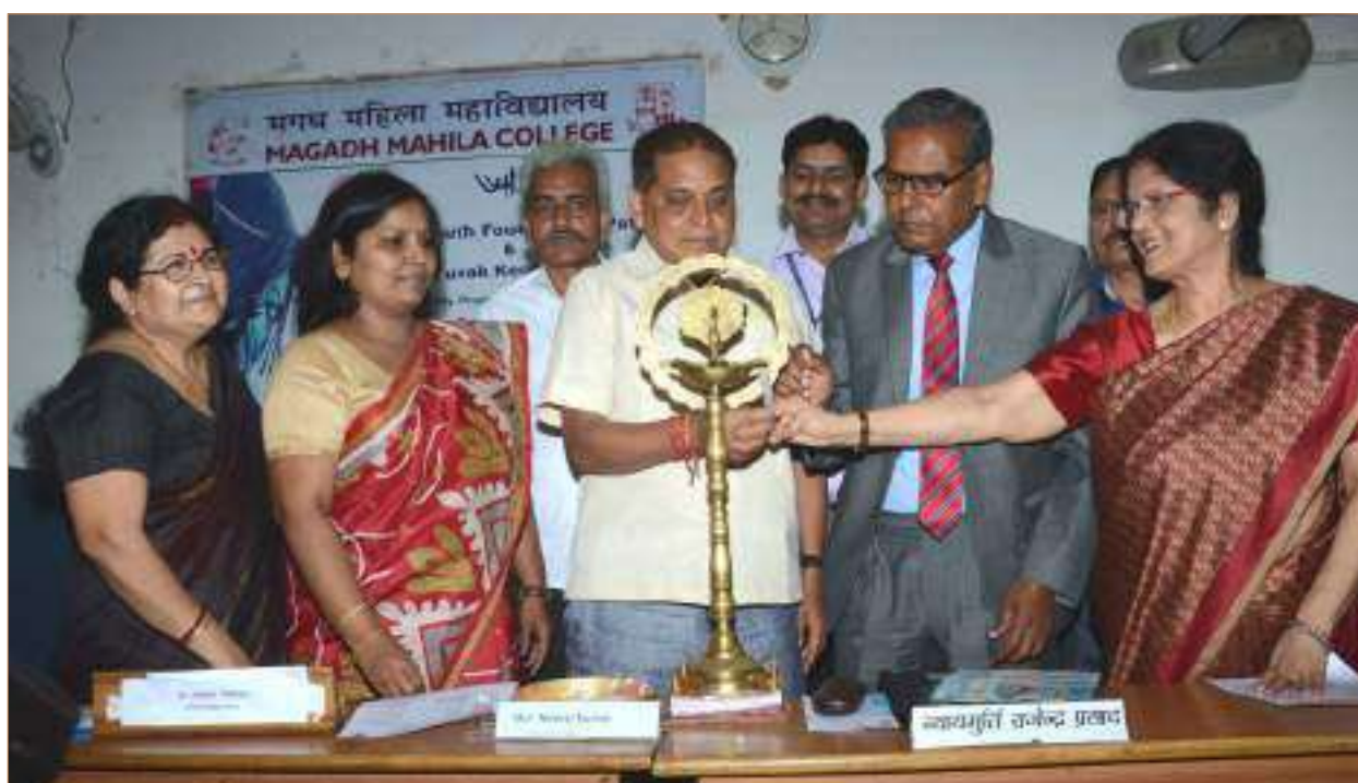
Distinguished dignitaries inaugurating the session with lighting the lamp