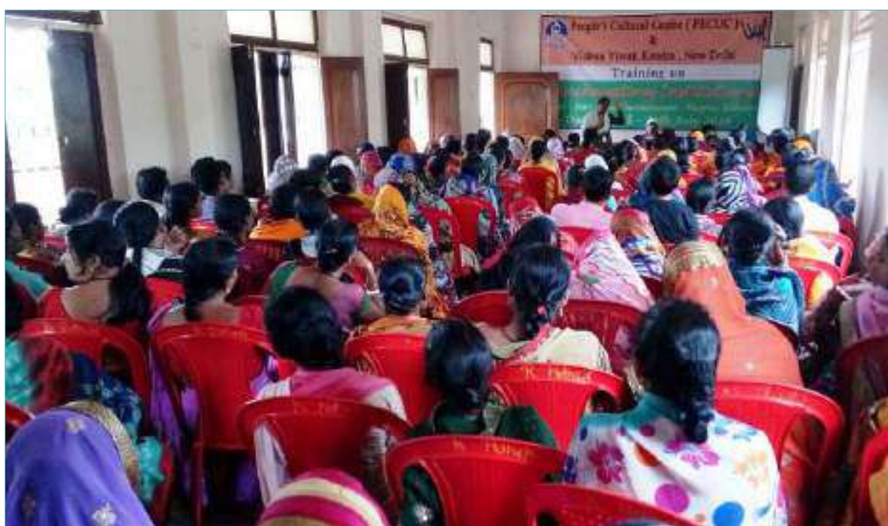
A glimpse of training programme on Panchayatiraj Institutions, Balasore, Odisha

Relevant topics like role and function of state PRIs, implementation mechanism, MGNREGA, social welfare schemes, health related schemes, rural electricity and NRLM were discussed. In addition to this, Right to Food Act, role of different stakeholders in strengthening PRIs, guidelines for Panchayat elections were also covered by the eminent resource persons during the training. Group