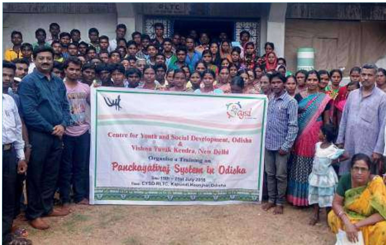
A group photograph of the participants