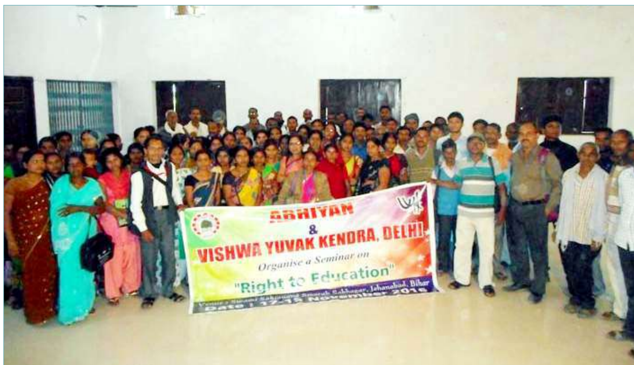
A group photograph of the participants