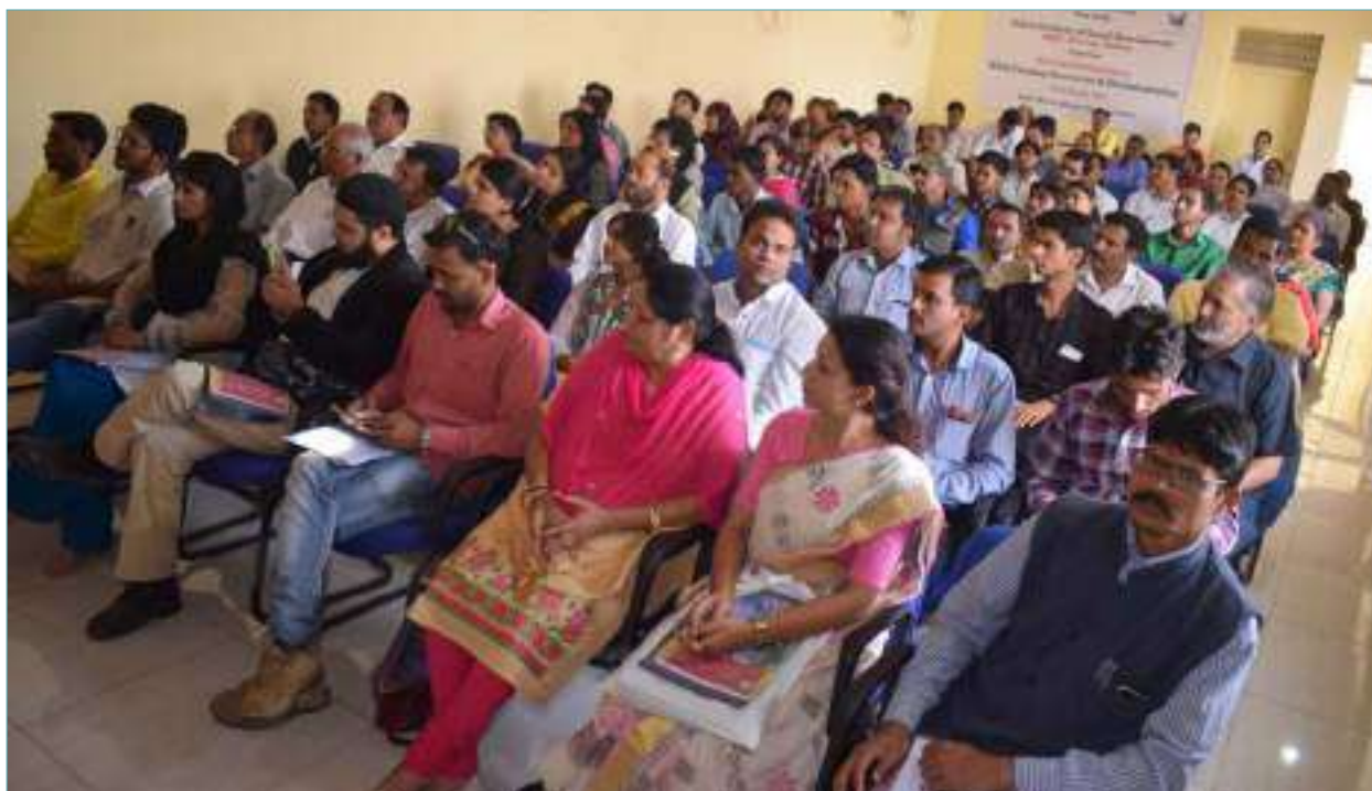
A view of ongoing session of the workshop

In all, 124 NGO representatives belonging to 16 districts of Madhya Pradesh actively