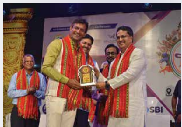
Some glimpses of the event