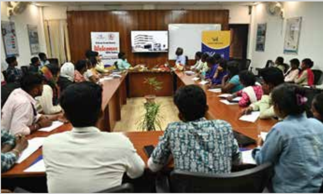
Students interacting with VYK Team