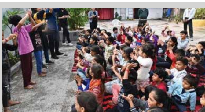
Active participation of the participants during the session