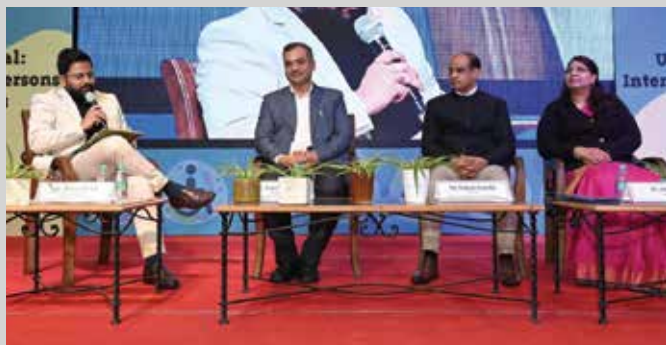
During the panel discussion