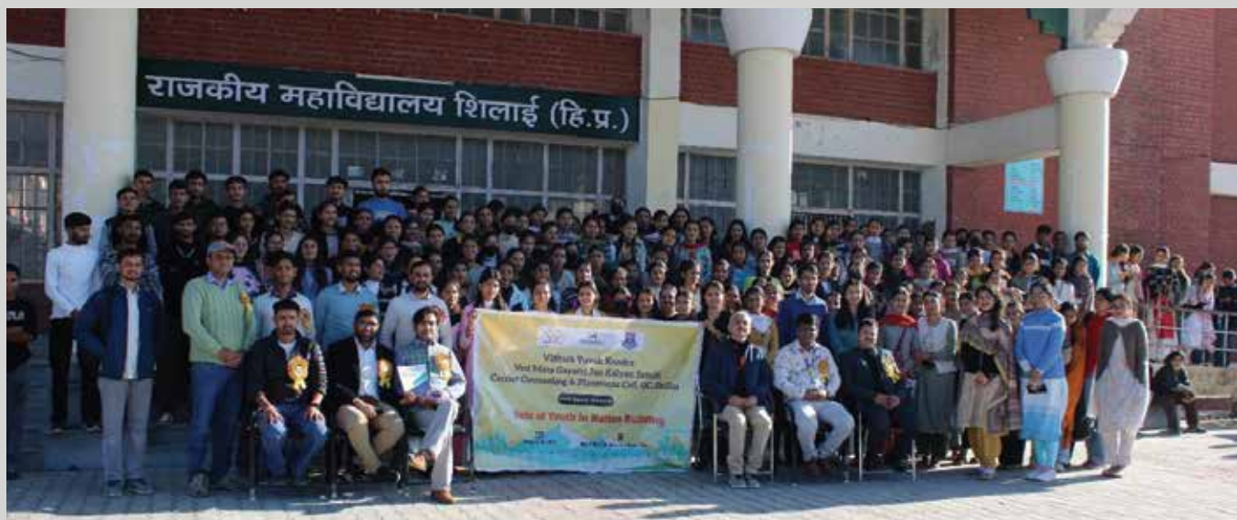
Glimpses from the seminar