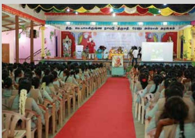
Glimpses of the event