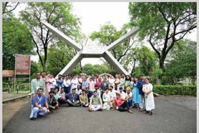
Glimpses from the second batch visit