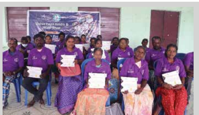
Participants in rapt attention