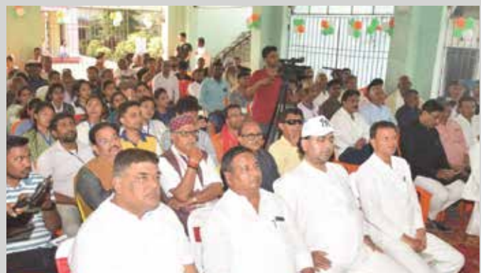
Glimpses from the camp