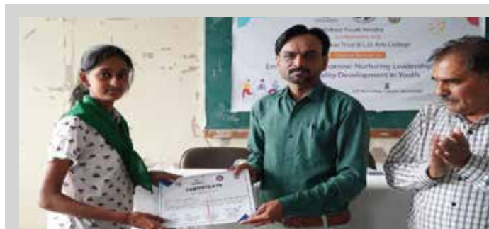
Glimpses from the seminar

More than 120 students of National Service Scheme of different departments of college participated in the programme.