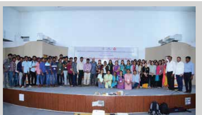
Glimpses from the seminar