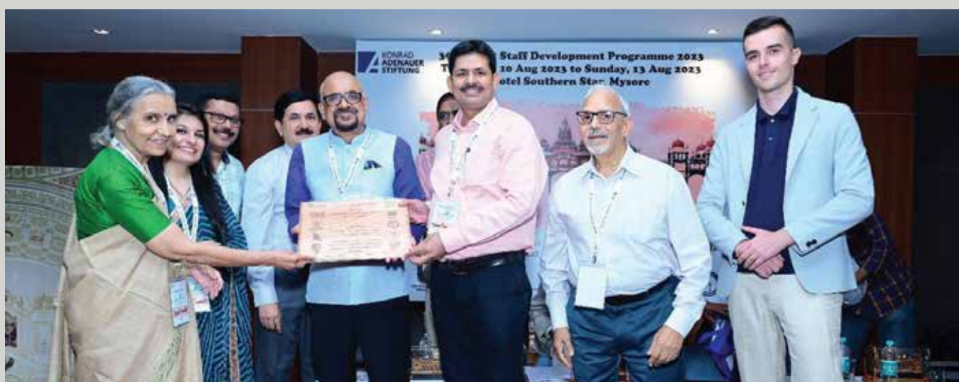
Glimpses of the event