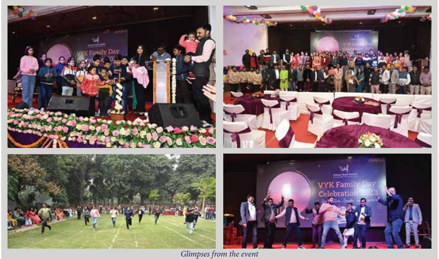
Glimpses from the event