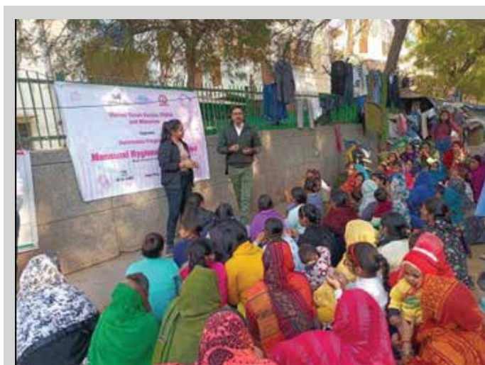
Active participation of the participants

Around 70 adolescent girls and women participated in the programme.