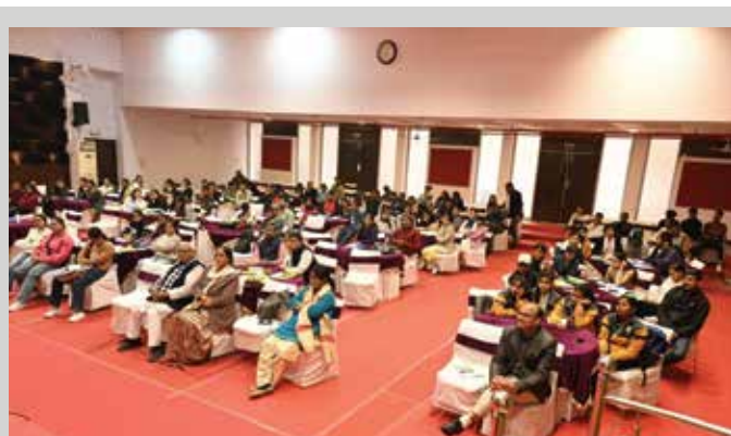
Glimpses from the seminar