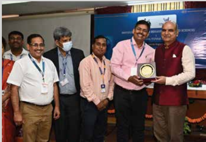
During the felicitation session