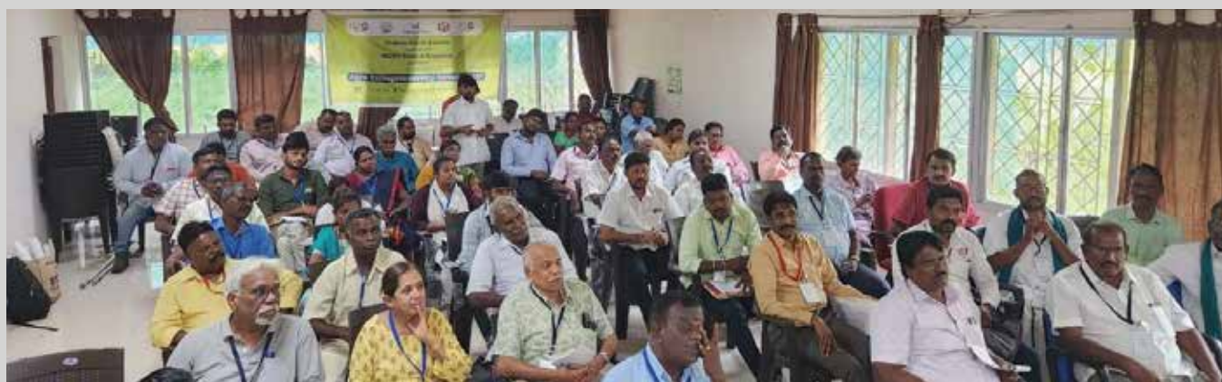
Glimpses of the event