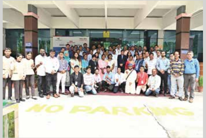
Glimpses of Module 1