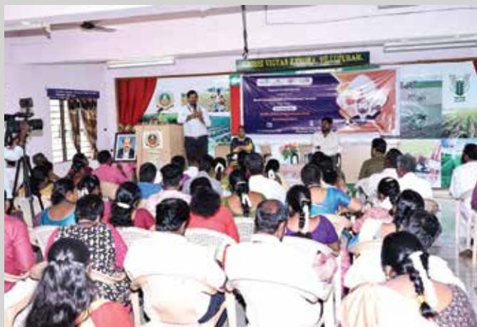
Training session in progress

Nearly 110 participants from across the state attended the programme.