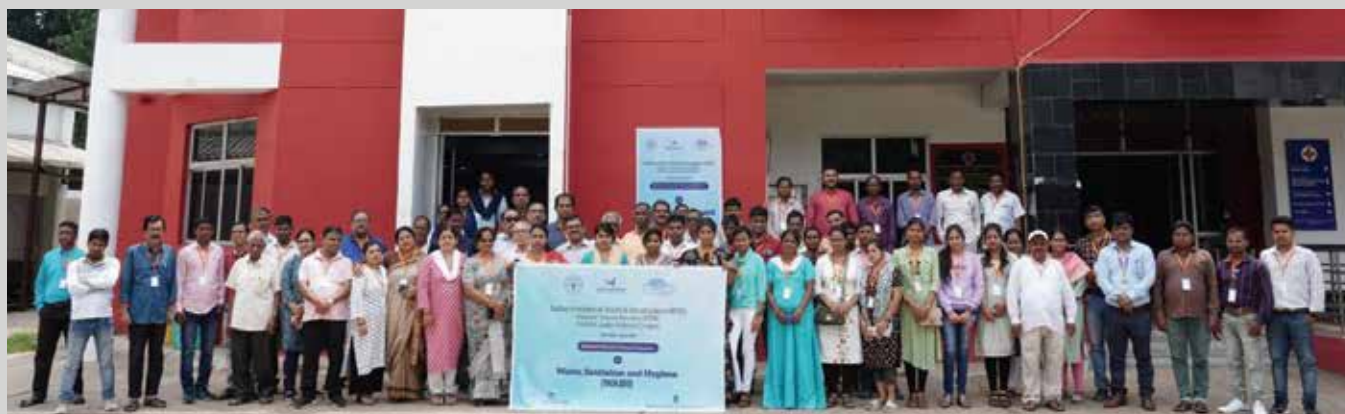
Glimpses of the programme and group photo