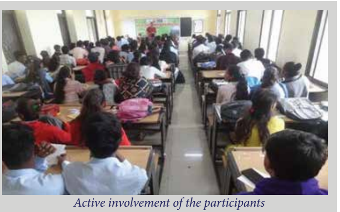
Active involvement of the participants