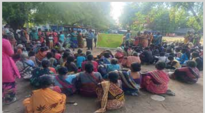
Glimpses of the campaign