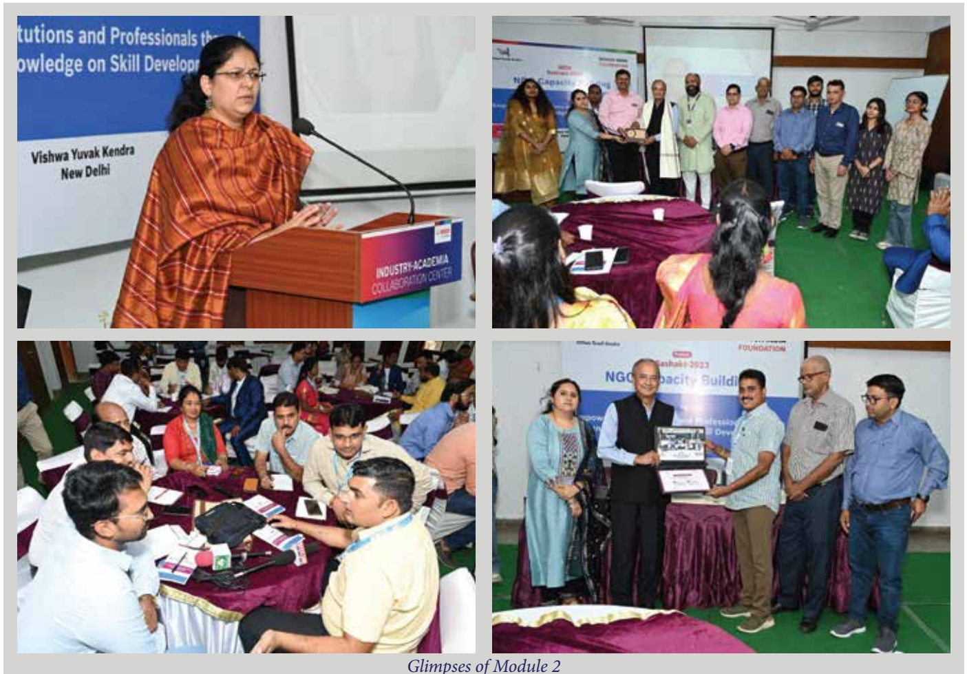
Glimpses of Module 2