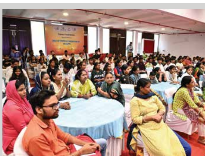
Glimpses of the event