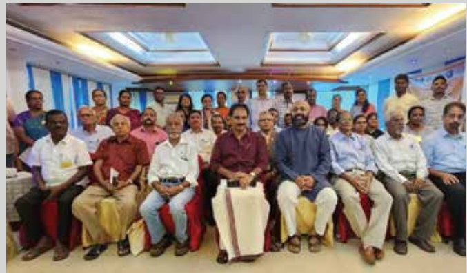
Glimpses of the event