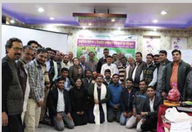
Glimpses from the First Batch