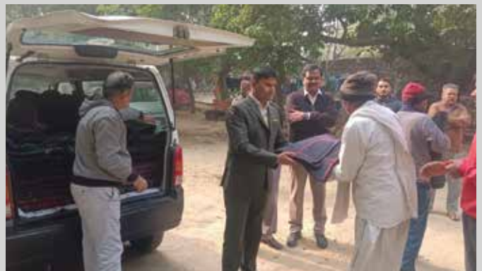
Glimpses of the blanket distribution drive