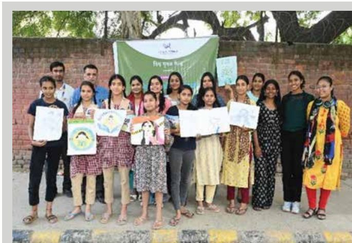
Participants displaying the posters during the activities

Seventy seven adolescent girls and women participated.