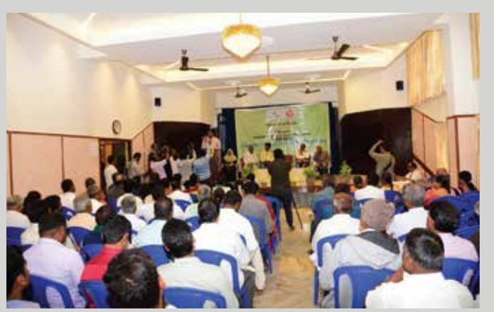
Glimpses of the proceedings