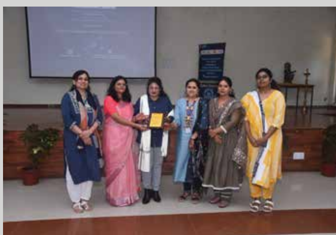
Guests and speakers being felicitated by team members