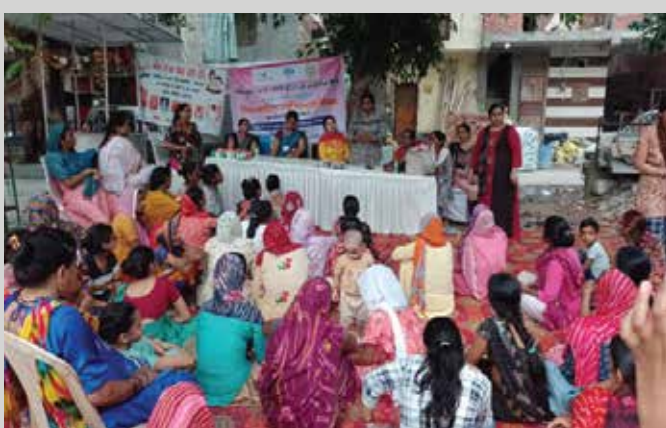
Glimpses of the event