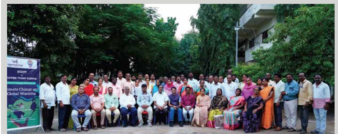
Glimpses from the programme