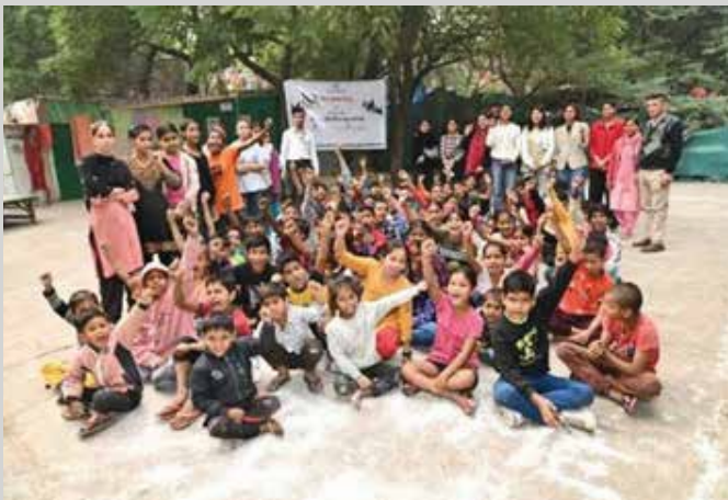
Group photo of the participants

One hundred and fifty participants in 10 groups actively participated in the programme.