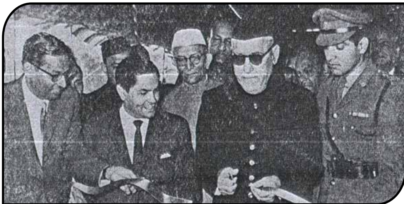
Dr. Zakir Husain, the then President of India, inaugurating the building of Vishwa Yuvak Kendra