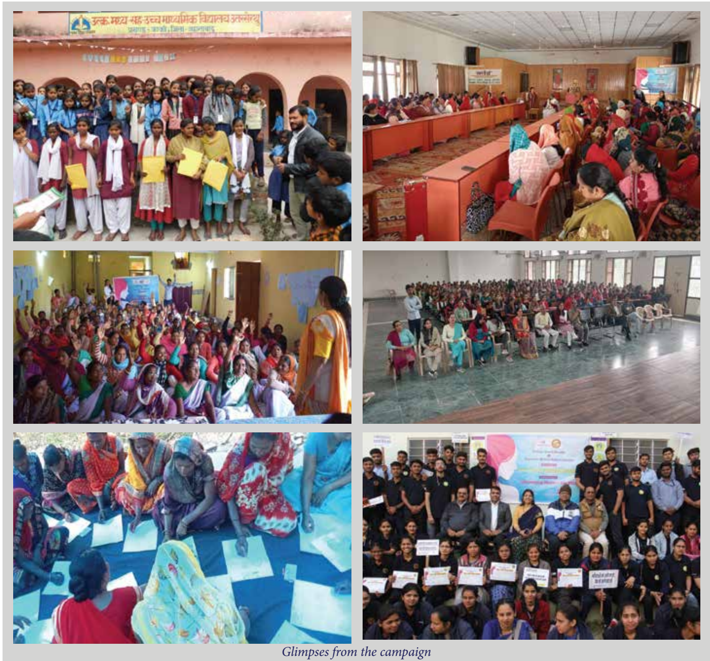
Glimpses from the campaign

Women’s Day. Seminars provided platforms for in-depth discussions and knowledge sharing, rallies, filled with fervor and solidarity, took to the streets amplifying the message of gender equality and demanding action for women’s rights. In addition to traditional forms of advocacy, creative expressions such as poster making, paintings, film screenings, and puppet shows were utilized to engage diverse audiences and foster meaningful dialogue. The impact of the campaign was felt far and wide, with nearly 20,000 people actively participating and contributing to its success.