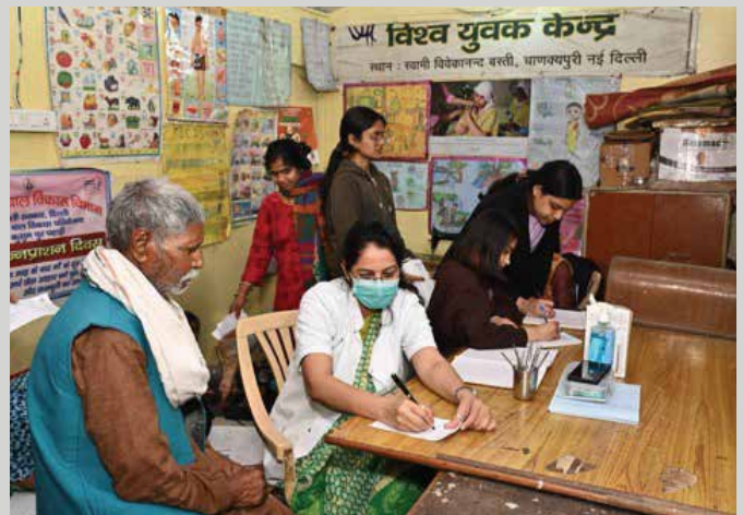
Glimpses from the Health Camp