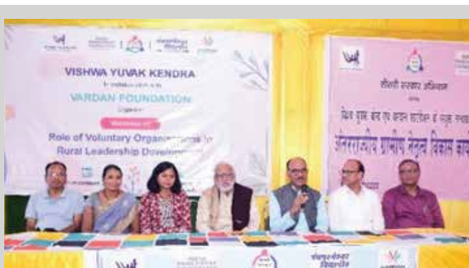
Estmreed speakers sharing their thoughts & ideas