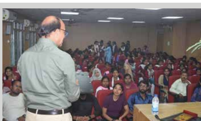
Training session going on