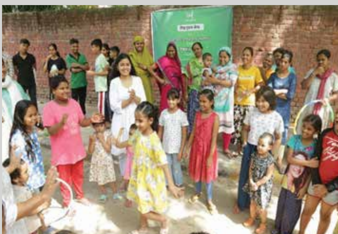
Glimpses of the event