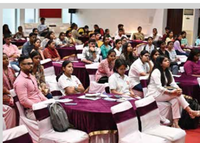
Active participation of audience