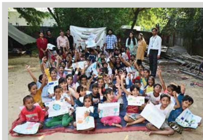
Group photo of the participants

There were about 85 girls and child participants who were present.