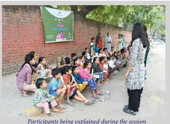
Participants being explained during the session