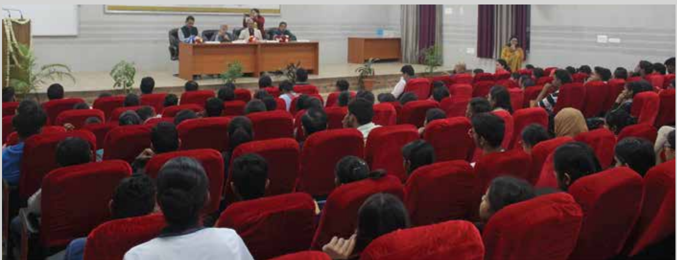
Glimpses from the seminar