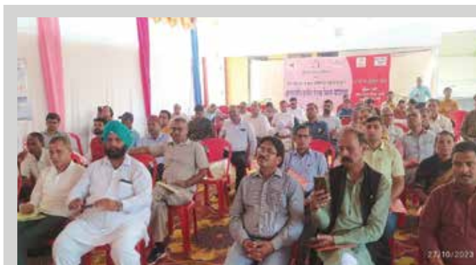
Training session going on

On the last day of the workshop, a joint action plan was made for leadership development work and a resolution was also taken to take this work forward. Nearly 74 representatives of Voluntary Organizations participated in this workshop.