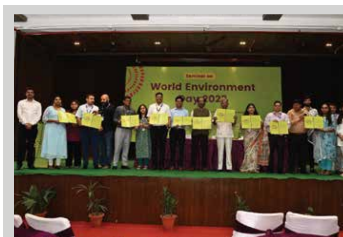
During the campaign launching

The seminar was held at the VYK Campus in New Delhi, attracting the participation of nearly 150 individuals from civil society organizations and educational institutions who recognized the significance of the event.