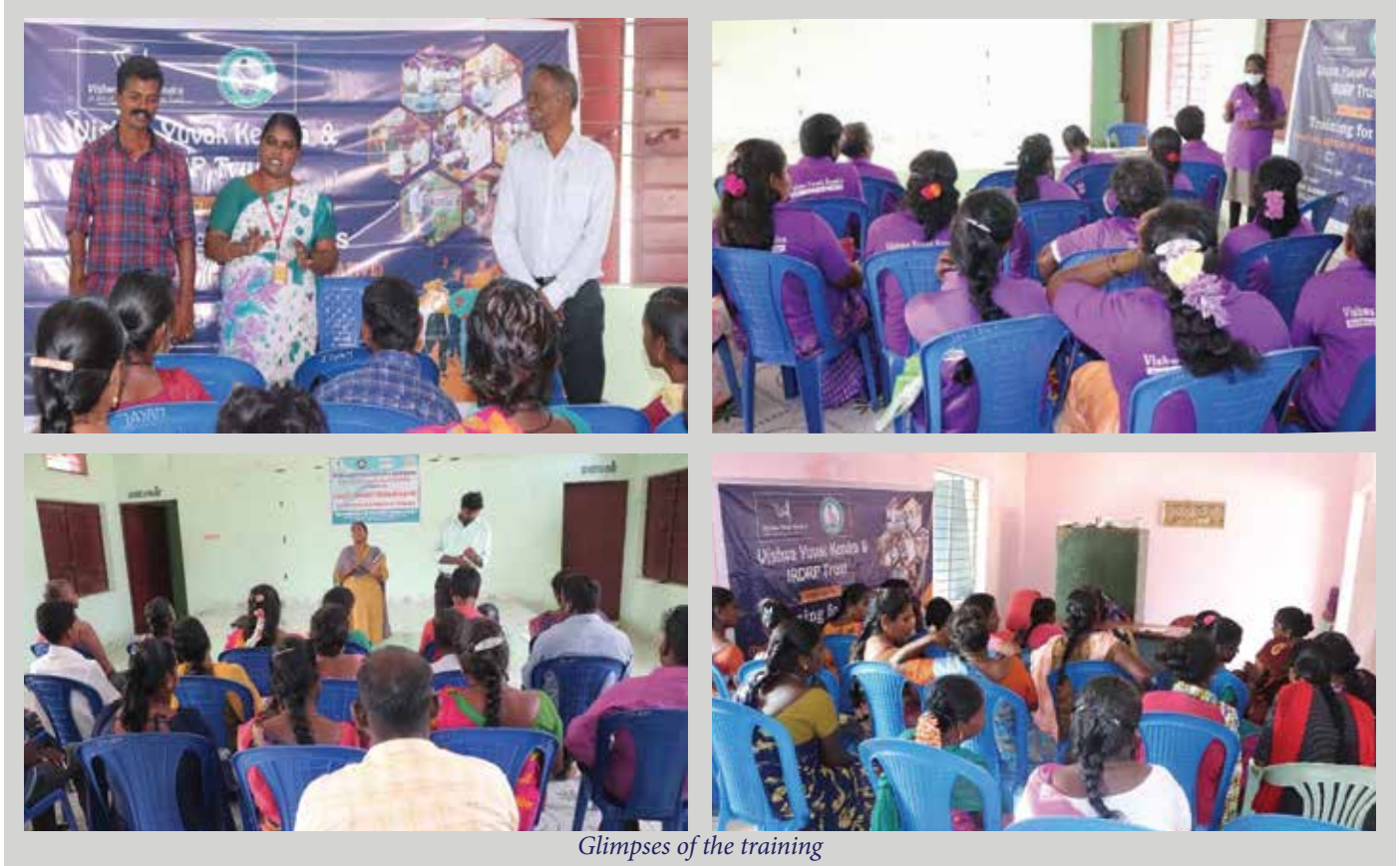
Glimpses of the training