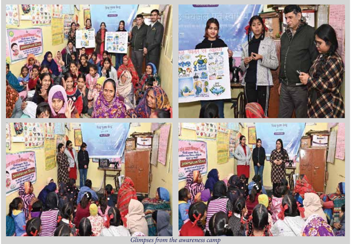
Glimpses from the awareness camp