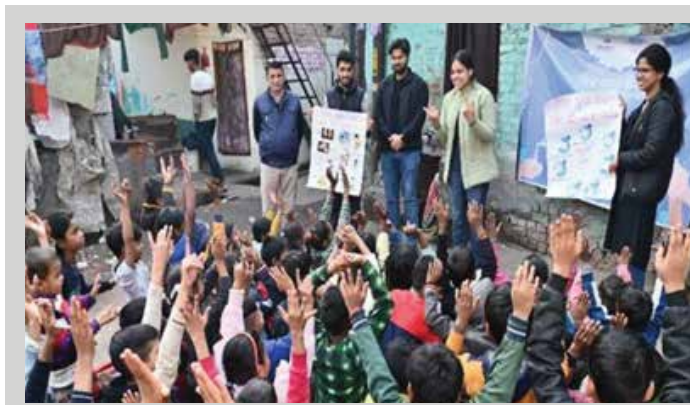
Active participation of the participants

Nearly 125 participants attended the awareness programme and gained insights into the far-reaching impacts of personal and environmental hygiene on health.