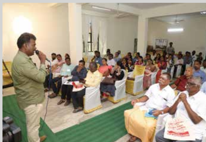
Eminent speaker addressing the session