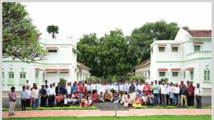
Glimpses from the visit of the first batch