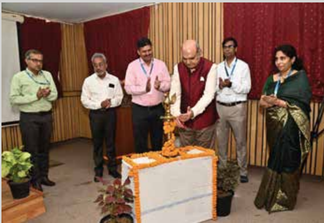
During the inaugural session

The workshop held in the Delhi National Capital Region (NCR) was a significant gathering of nearly 70 participants, including 65 non-governmental organizations (NGOs) and various stakeholders.