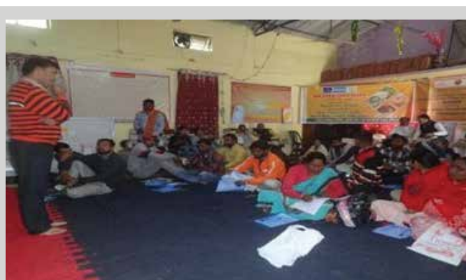
Active involvement of the participants