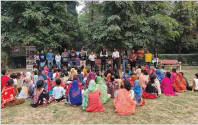
Active participation of the participants during the session