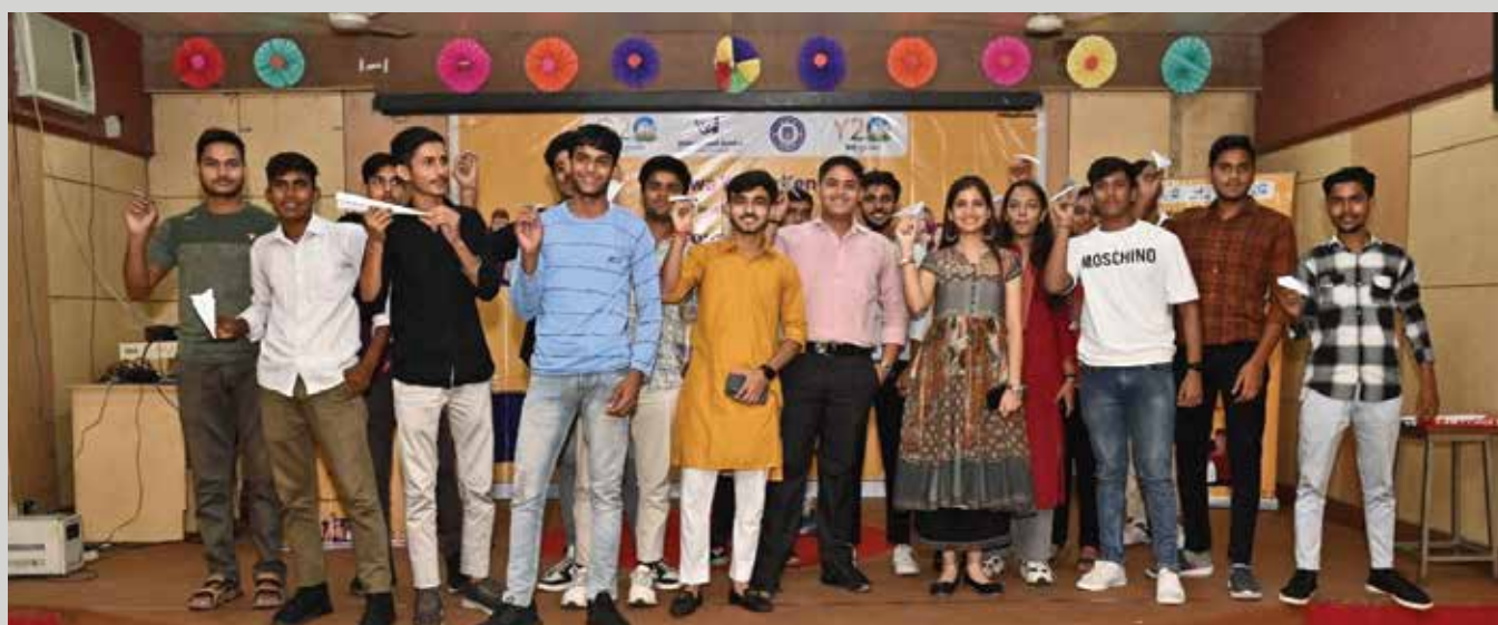
Glimpses from the seminar