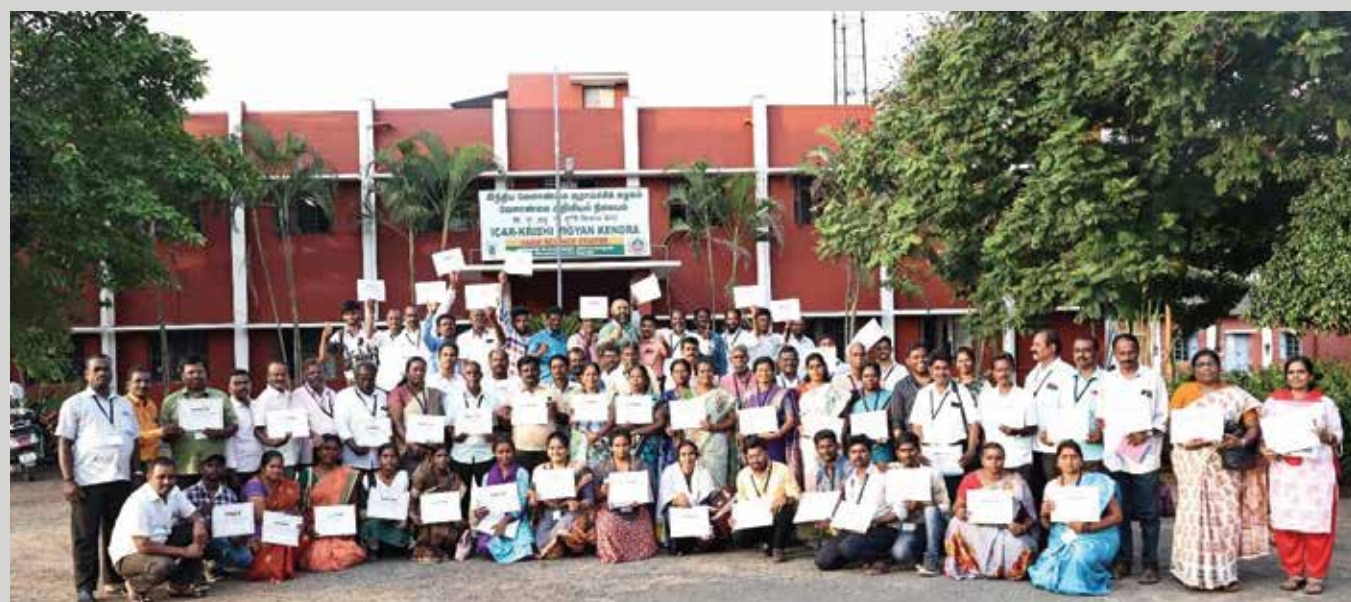
Group photo of the participants