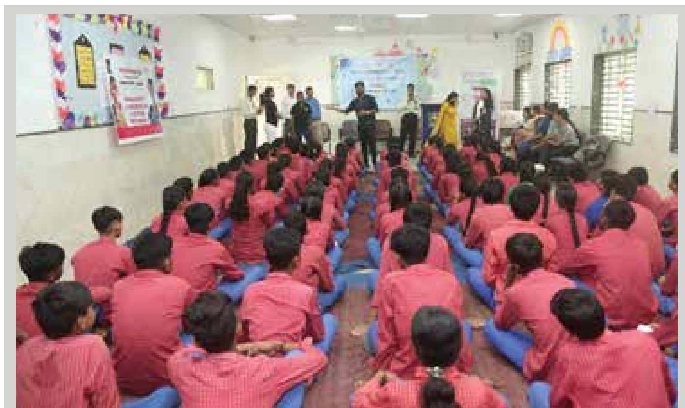
Glimpses of the event

Approximately 200 participants participated in the event. The students greatly appreciated the endeavours of the VYK Team and requested them to organize similar activities in future also.