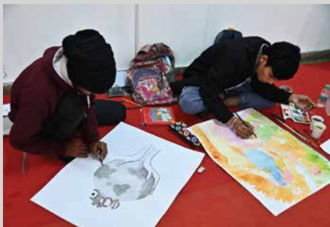
Glimpses of various sessions