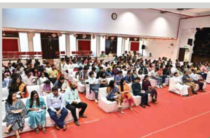
Active participation of the audience