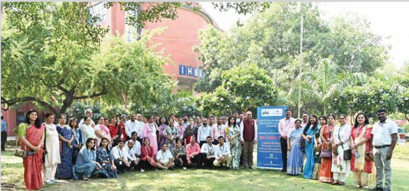
Group photo of the participants