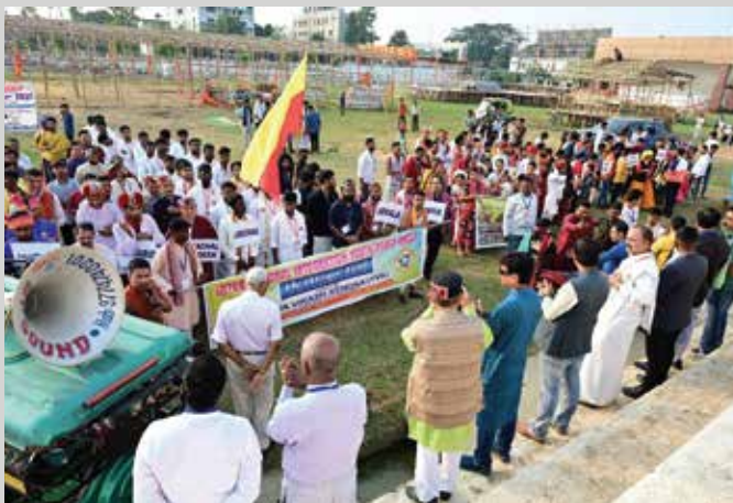
Glimpses from the event