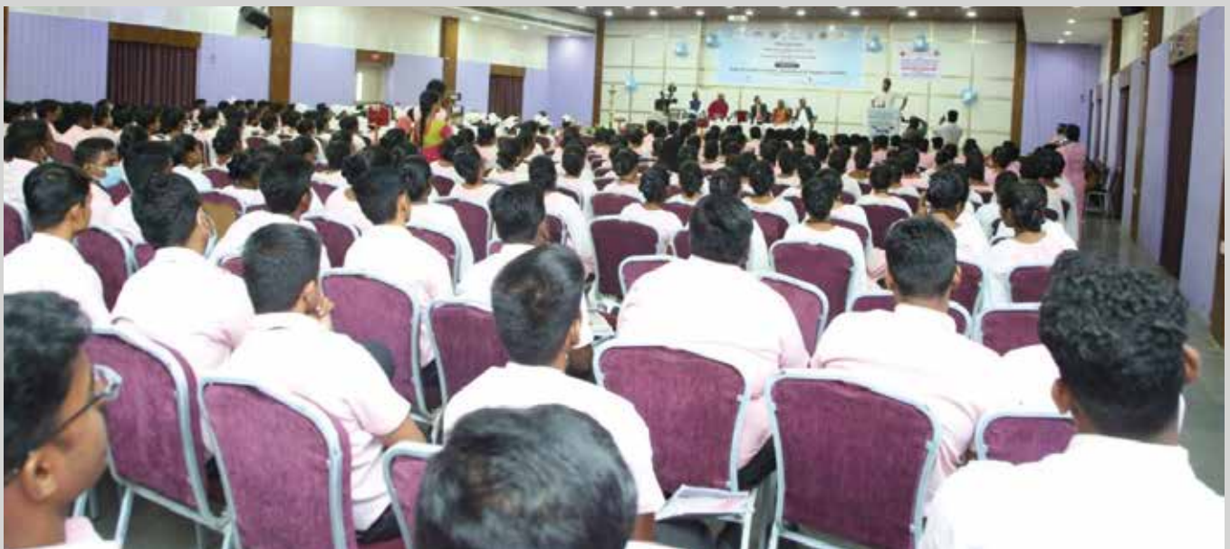
Glimpses of the event