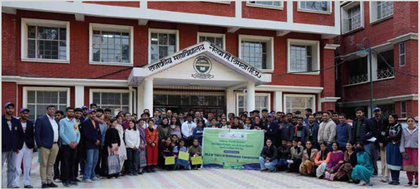
Glimpses of the event