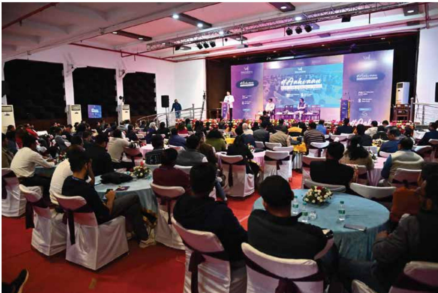
Glimpses of the event