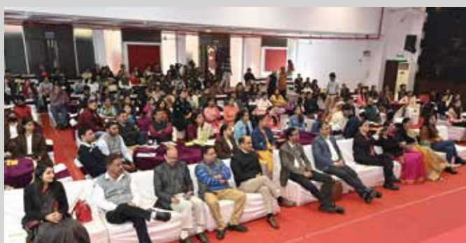
Glimpses of the event