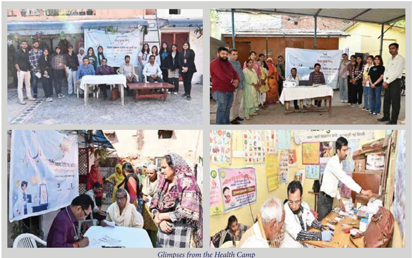
Glimpses from the Health Camp

Around 150 men and women combinedly participated in the camps and got benefited.