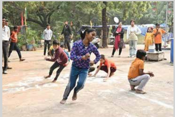
Active participation of the participants during game