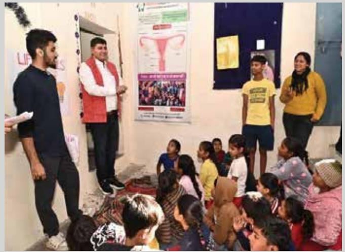
Active participation of the participants