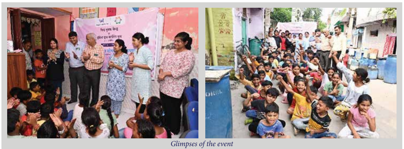
Glimpses of the event

The awareness camp proved to be an informative event for the children. By instilling the importance of open communication, the camp aimed to create a safe environment where children feel empowered to protect themselves and seek assistance when needed. The camp saw a participation of approximately 50 children.