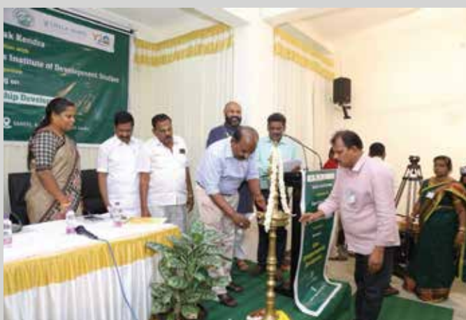
Inaugural session in progress

Nearly 80 representatives from NGOs/FPOs and Farmers Clubs from Tamil Nadu, Kerala, Andhra Pradesh, Telangana, Delhi, Puducherry and Karnataka participated in the three-day training programme and got benefited from it.