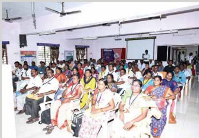
Participants listening attentively