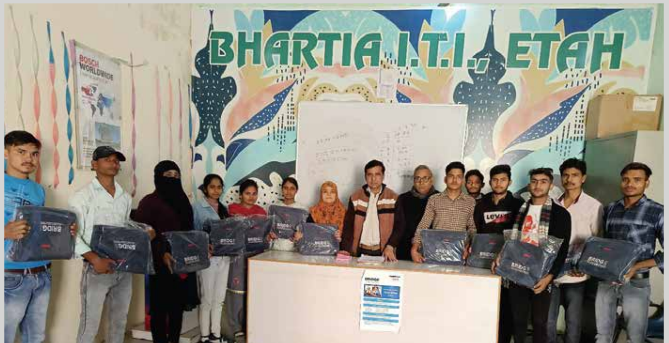
Glimpses of the Caregiver Project