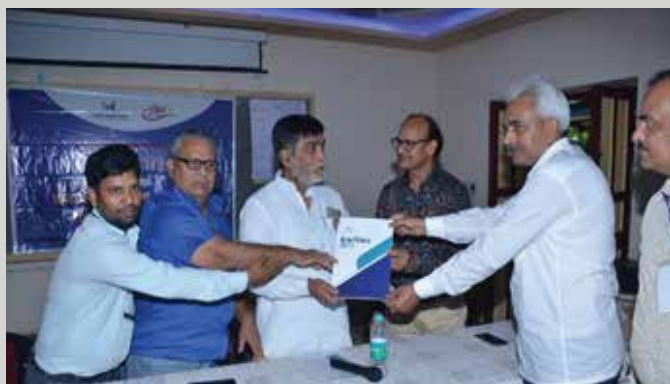
Training session in progress

The training was attended by a total of 65 participants.