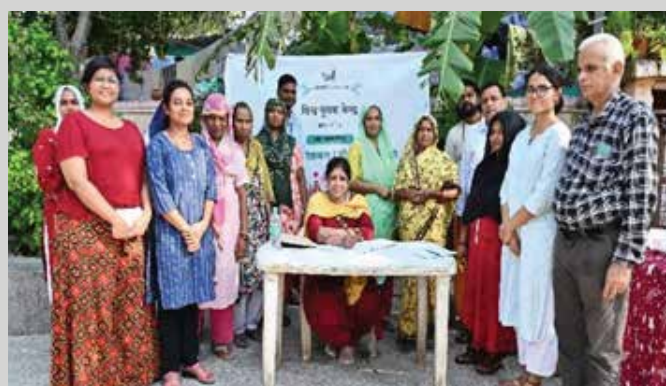
Glimpses of the event