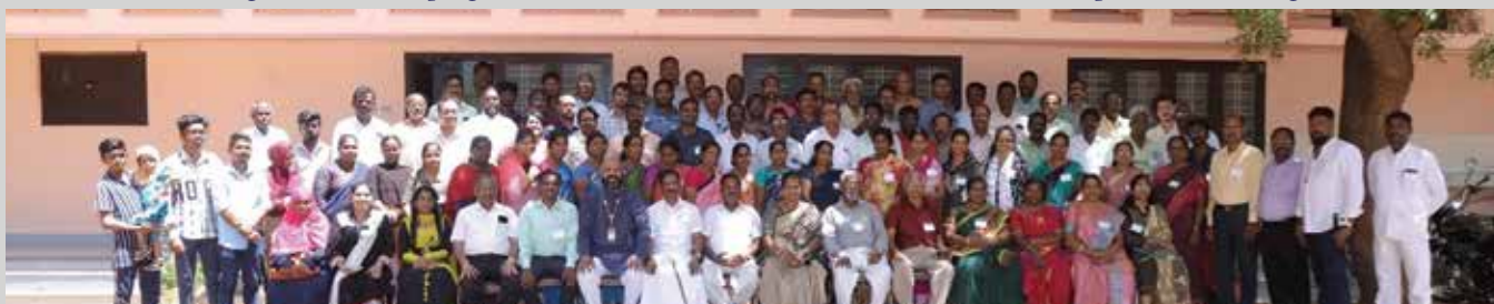
Group photo of the participants