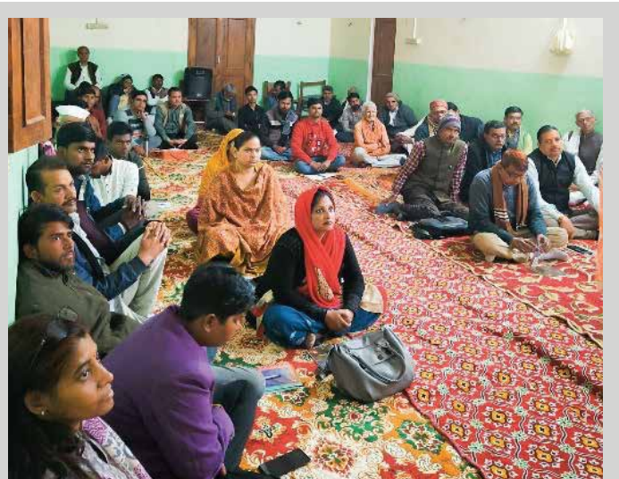
Glimpses from the programme