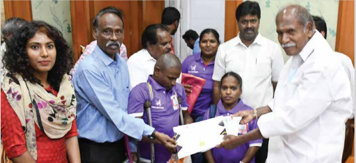
Chief Minister of Puducherry, Shri N. Rangaswamy interacting with organisers and felicitating participants