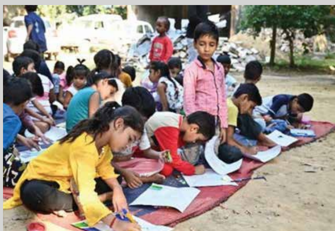
Participants during the activities