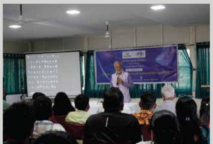
Glimpses from the workshop