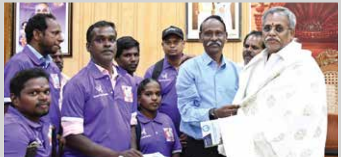
Glimpses of the event