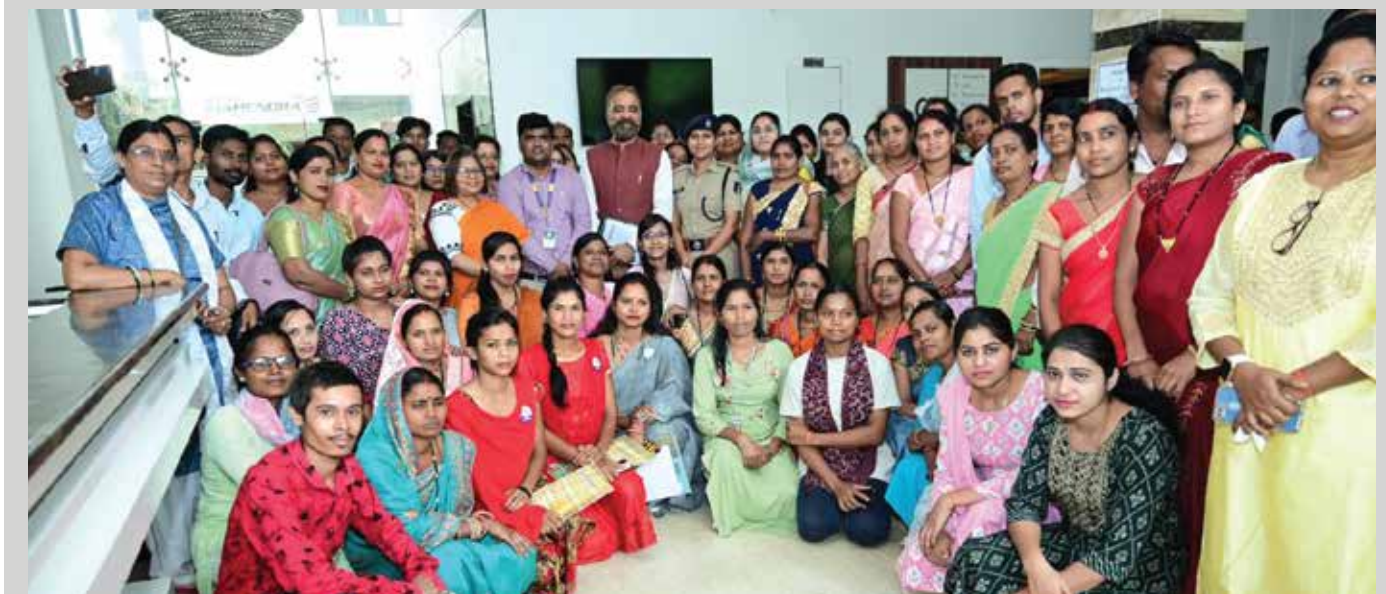
Glimpses of the event