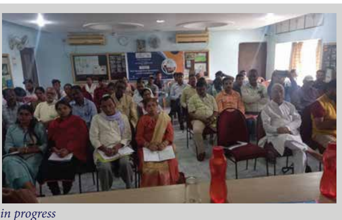
Proceedings in progress