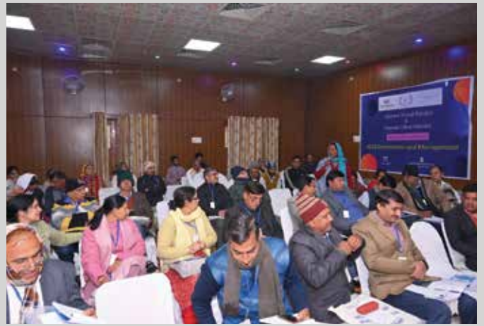
Glimpses from the workshop