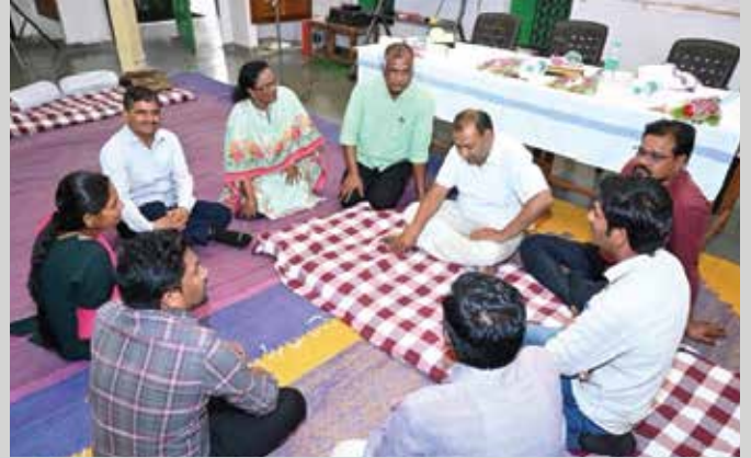
Glimpses from the Second Batch