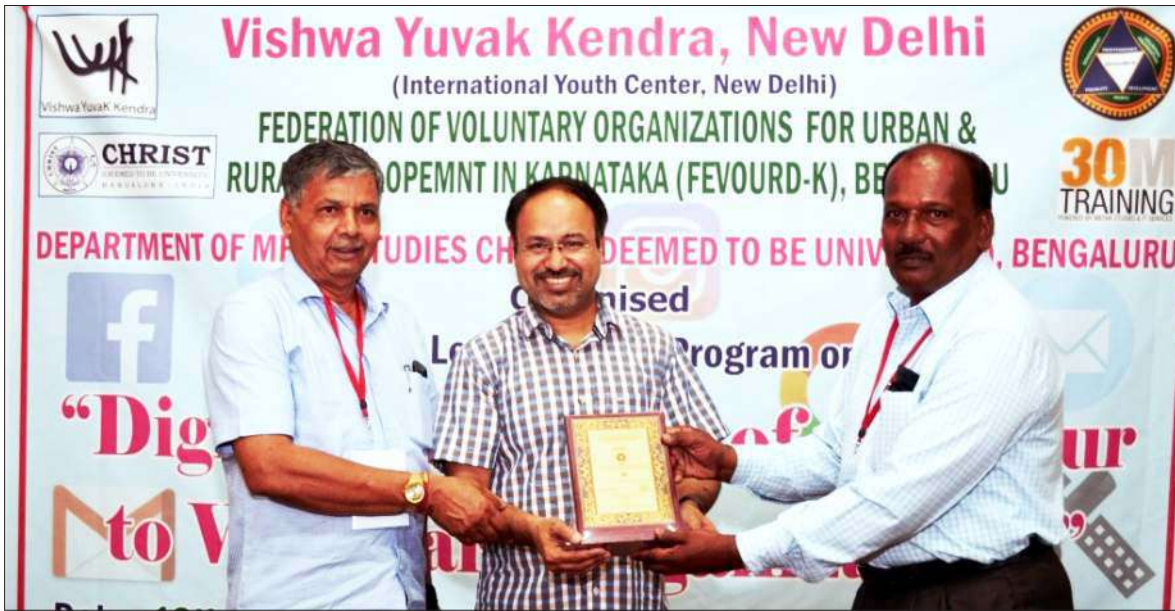
A resource person is being felicitated