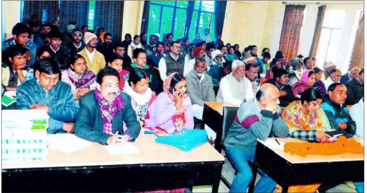
A glimpse of session