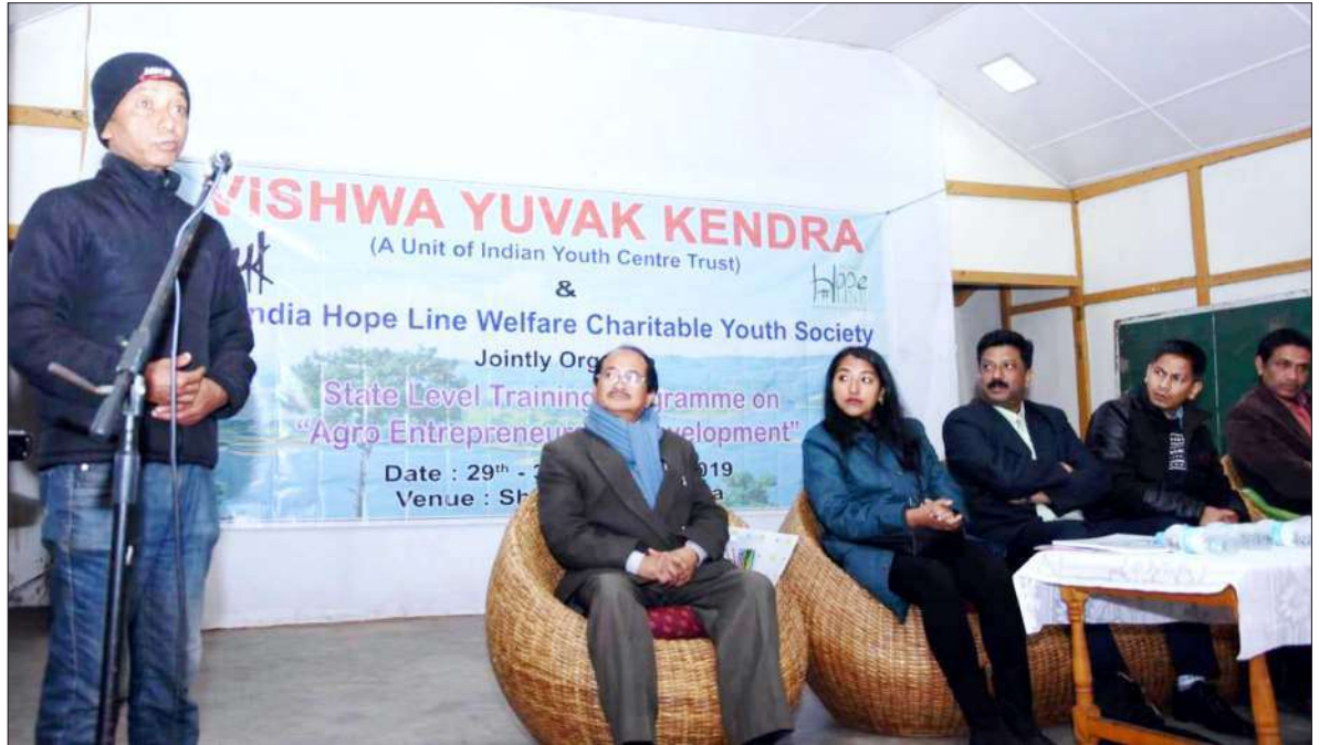
A view of the inauguration

Organizations from Assam, Arunachal Pradesh and Meghalaya actively participated in the programme.