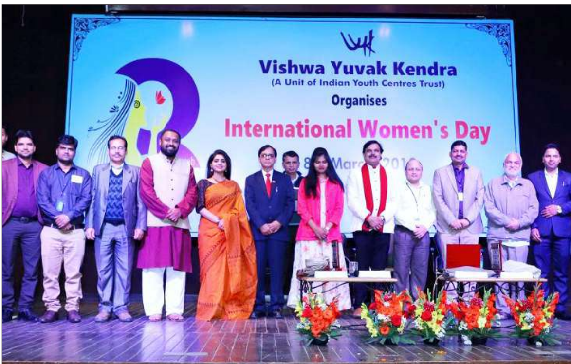
A group photograph of poets and resource persons