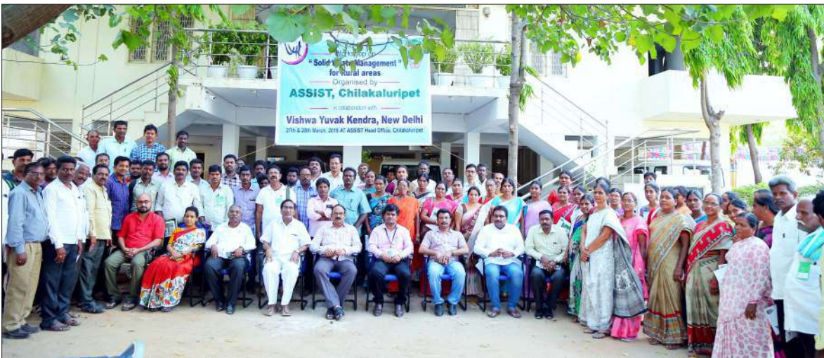
A group photograph of the participants