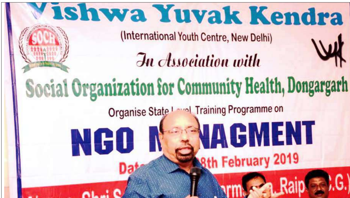
A glimpse of the ongoing session

Vishwa Yuvak Kendra and Social Organization for Community Health (SOCH) jointly organized a two-day training programme on “NGO Management” from 07