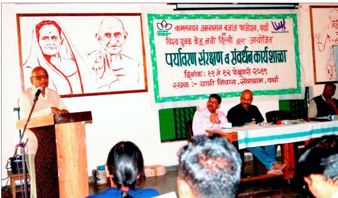
A glimpse of the inauguration

thematic issues and challenges in their addresses. The participants were imparted training on various environmental aspects. Several panel discussions were held by eminent panelists on different thematic aspects i.e. Resources Conservation and Management, Environmental Issues, Global Warming, Livelihood, Sustainable Development. 100 representatives from NGOs, VOs and CBOs from Maharashtra state actively participated in the programme.