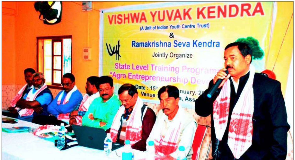
A glimpse of the inauguration