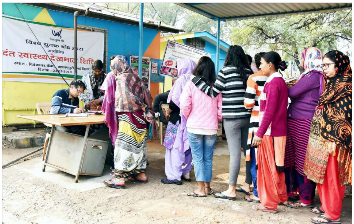
The community people are being registered

IDST Kadrabad, Modi Nagar, Uttar Pradesh diagnosed and treated the people. Besides, some people were offered with tooth pastes and tooth brushes to protect their teeth. A total of 110 patients were covered in the camp.