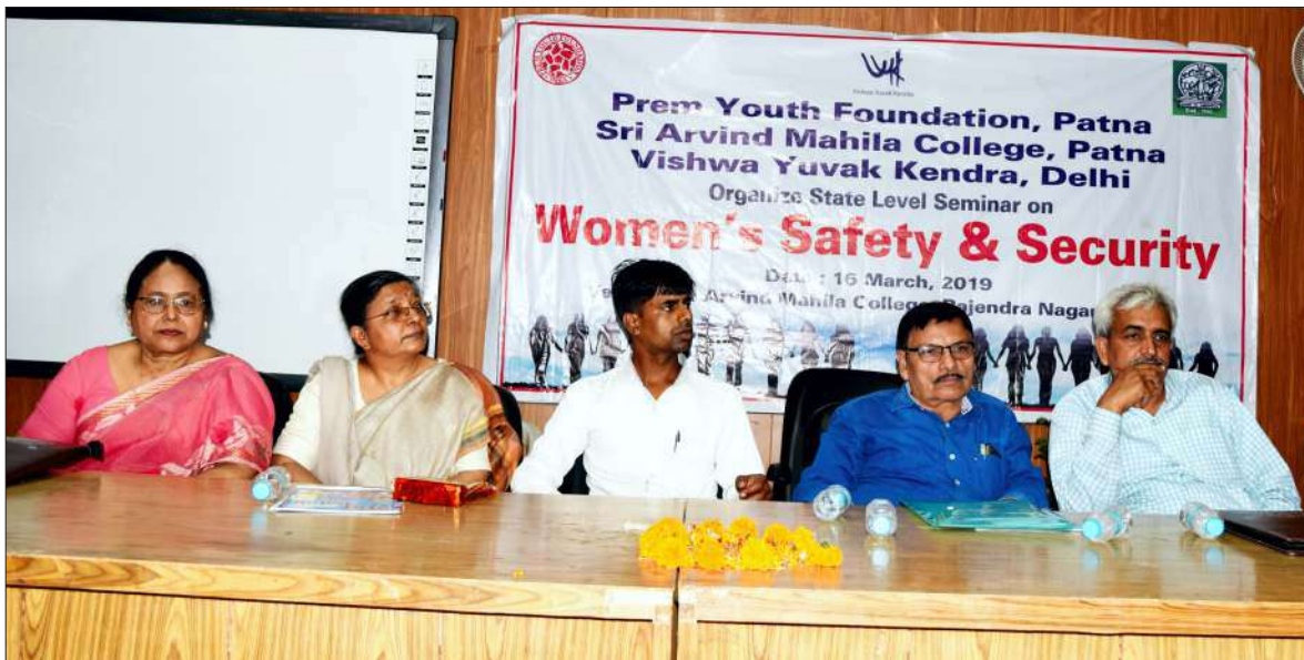
A glimpse of the dignitaries during inauguration