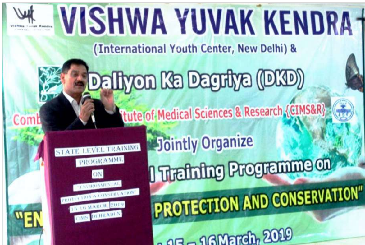
A glimpse of session

Eminent speakers addressed on key thematic aspects during the panel discussion. 120 representatives from NGOs and educational institutes of Uttarakhand actively participated in the programme.