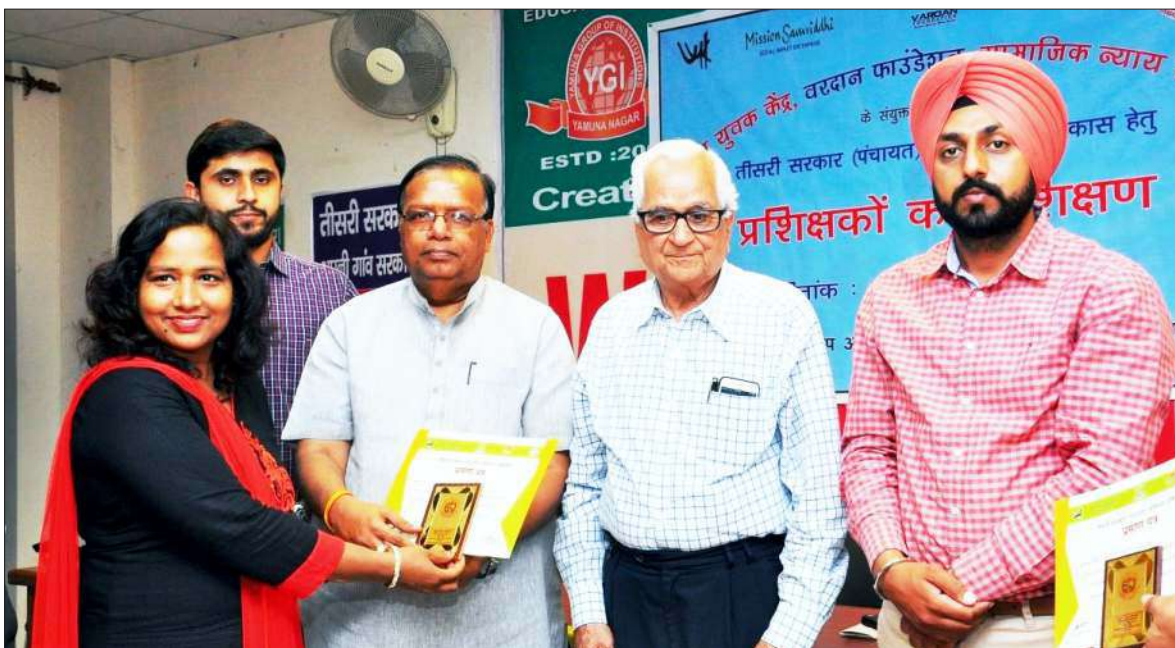
A glimpse of the inaugural session

Foundation and Citizenship Development Society from 24 to 28 March, 2019 at Yamuna Nagar, Haryana. The panel