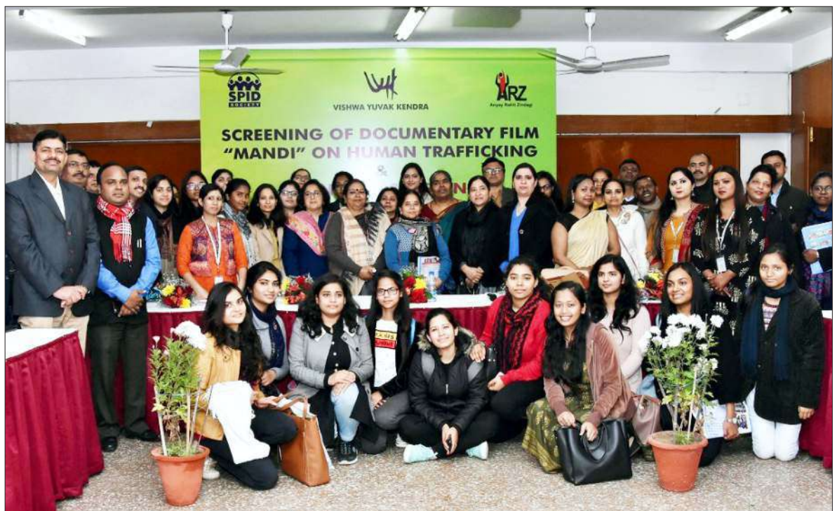
A group photograph of the participants

A pool of eminent resource persons comprised of Members of National Commission for Women, Delhi Commission for Women, Delhi Commission for Protection of Child Rights highlighted the key thematic aspects and urged for carrying out many activities especially in educating and training people at the National, State and Community levels. Former M P, Legal Professionals, Development Professionals,