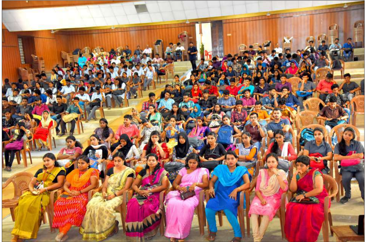
A glimpse of the participants during seminar on "Role of Youth in Disaster Management", Thiruvananthapuram, Kerala (06 February, 2019)