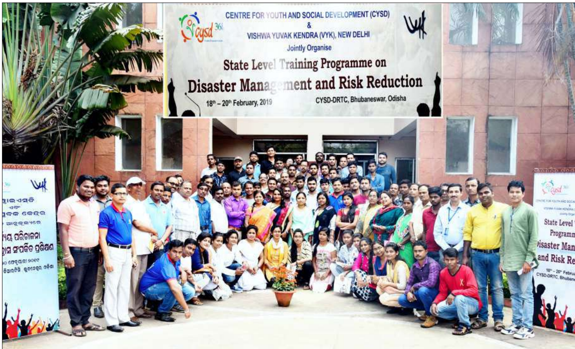
A group photograph of the participants

representatives of NGOs, VOs, CBOs, faculty members and students from 15 districts of Odisha actively participated in the programme.