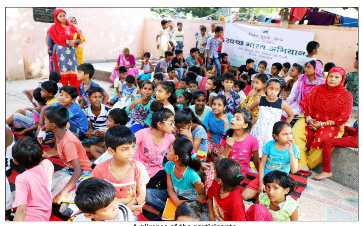
\begin{tabular}{ll} A glimpse of the participants \\ \end{tabular}

Abhiyaan" on 20 September 2019 at Bhaiya Ram Camp. The local adolescents took an