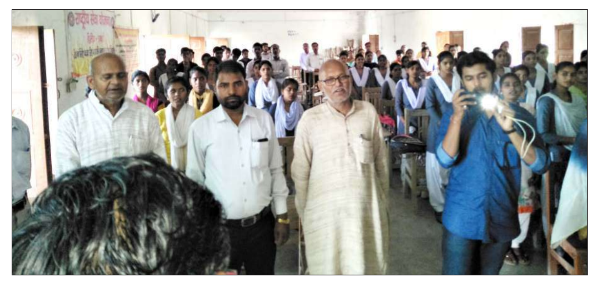
The participants offering prayer

covered under a panel discussion to enriched the knowledge of the participants. 76 representatives of CSOs from several parts of