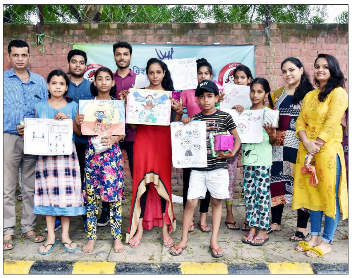
A group photograph of the participants and interns

attention of people to control female feticide and promote girl child education. A pool of 40 students from the community keenly participated in the programme. The role played in organizing the event by the interns Ms