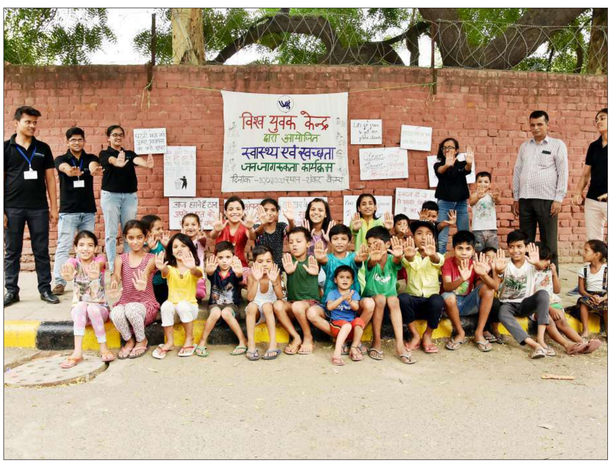
A glimpse of the programme

called 'Health Matchup' was performed to understand various aspects of personal hygiene and generate awareness by the children of the community. Besides, a rally was also organized with the children holding banners in their hands and reciting slogans on hygiene.