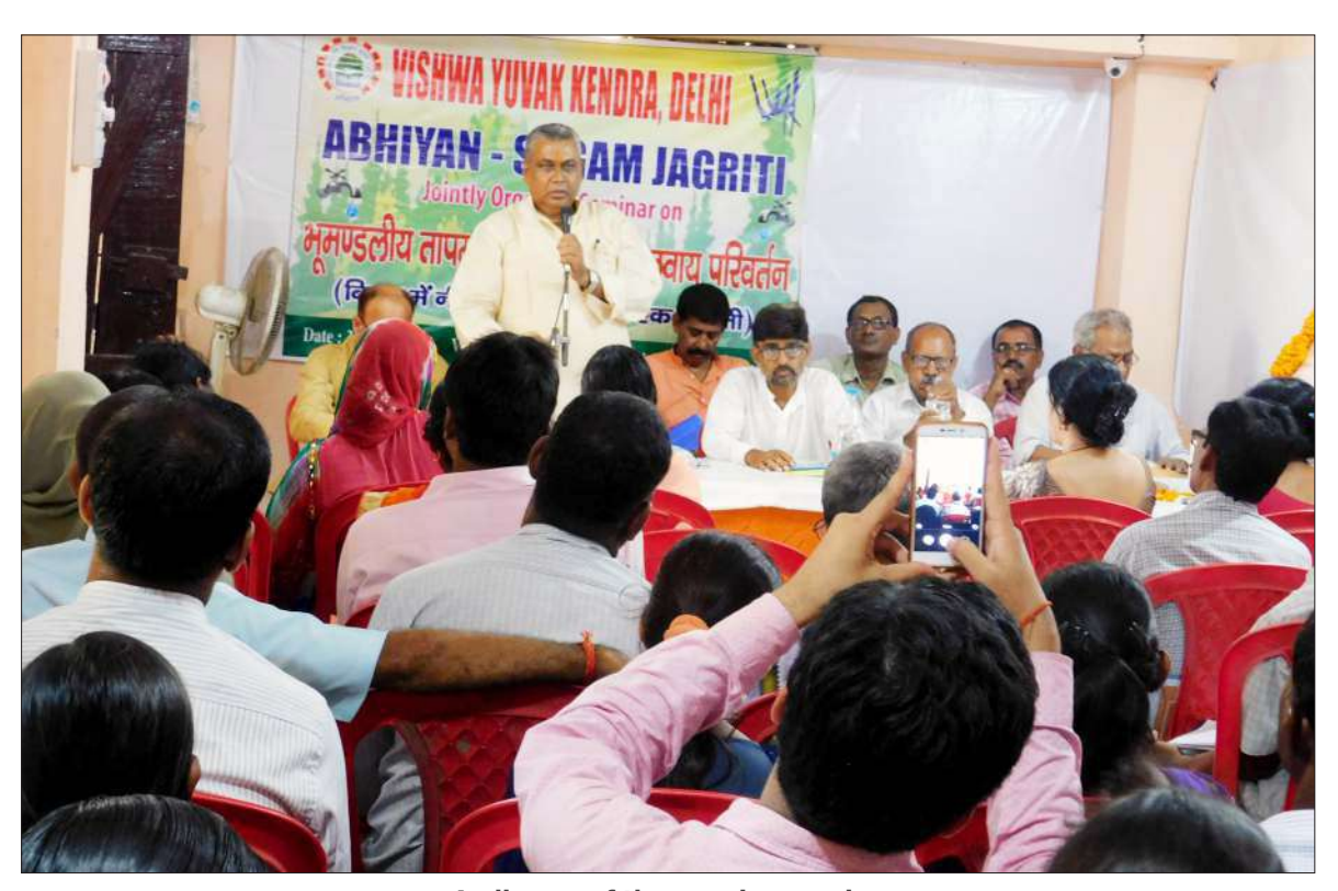
A glimpse of the ongoing session

Sustainability. 119 participants comprised of NGO Functionaries, CSO Representatives, Social Workers and Students from several regions of Bihar and Jharkhand keenly attended the seminar.