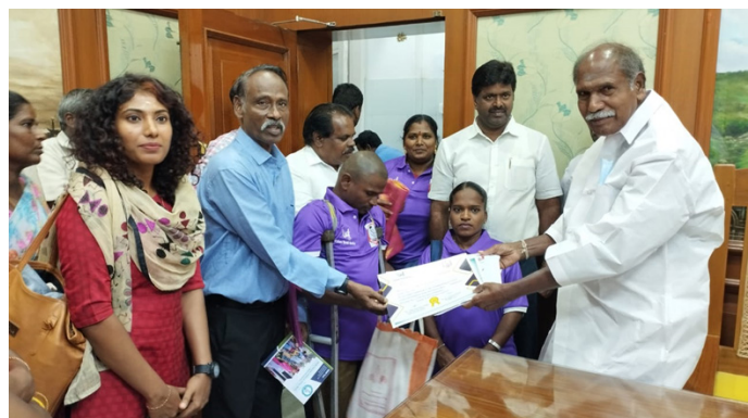
Honorable Shri N. Rangaswamy, the Chief Minister of Puducherry, presenting certificates to the participants