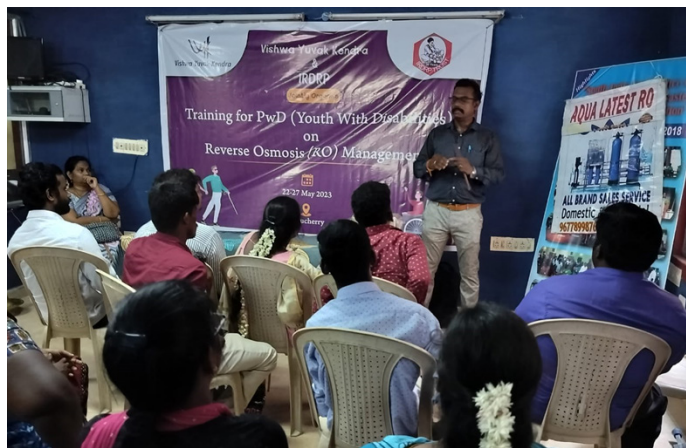
The Subject Expert is presenting a lecture on the functioning of RO systems