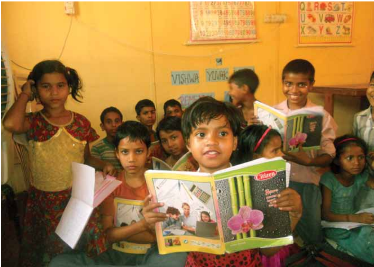
Children from Vivekanand Community actively participating in the remedial classes run by Vishwa Yuvak Kendra

Remedial classes are another initiative of VYK for the children from the community. Classes are run four times a week.