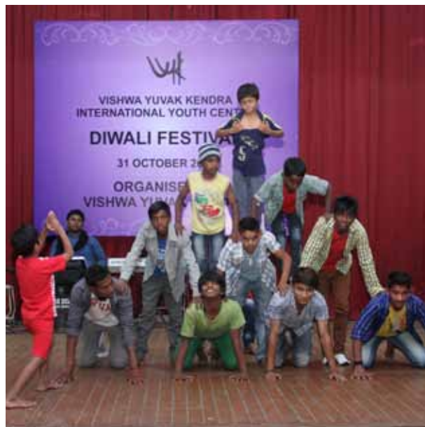
Students from Aman Biradari performed the dance on the occasion of Diwali Festival, held on 31 October, 2013 at VYK, on the occasion of Diwali Festival.

To develop a sense of cultural integrity VYK organizes various cultural performances from different states of India. The Bamboo dance or a Cheraw dance from Mizoram was presented by the group from Mizoram, which was enjoyed by all. Eighty students representing 12 organizations performed regional, folk and motivational dances. Mahak Theatre group performed the play, "Khaishe" and "Phark", the plays were based on gender equality and girls' right. "Khaishe" was based on the sexual harassment at workplace and "Phark" was based on the message for stopping female feticide.