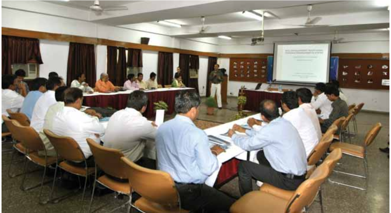
Participants of Orientation Programme for partner organization (Skill Development/Vocational Training programme) on 30 May-2013.