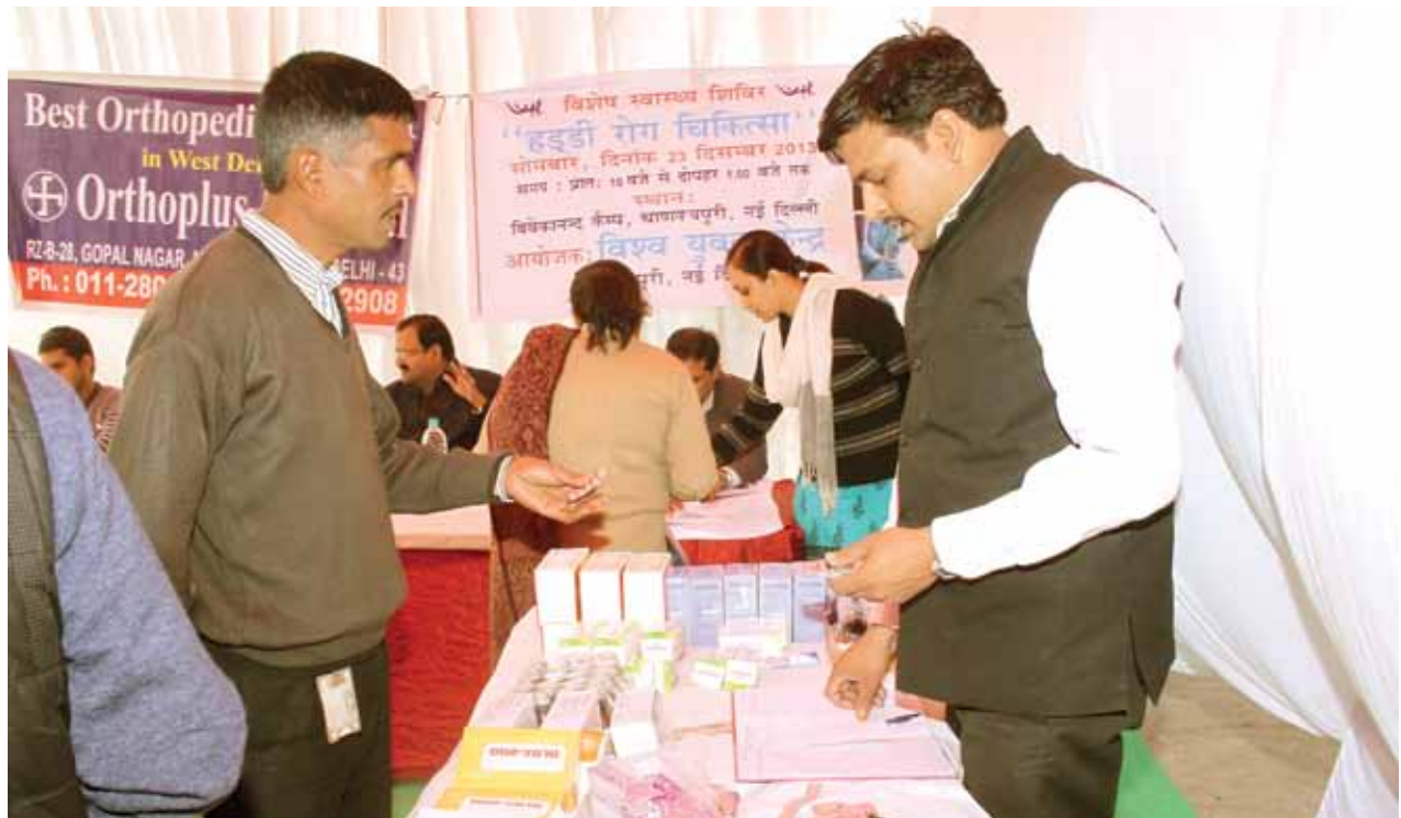
Community Members at specialised camp on Orthopedic Ailment, conducted at Vivekanand Camp, Chanakyapuri.

Vishwa Yuvak Kendra under the Integrated Community Development Project organized a programme on Human Rights Day on 10 Dec 2013 at Vivekanand Camp. It is observed that basic service provisions, like education, health and sanitation are inadequate in Vivekanand community which poses serious threats to the lives of those who reside there. The programme created awareness on human rights among the community members. More than 150 community members were present at the programme which included men, women and youth of the community.