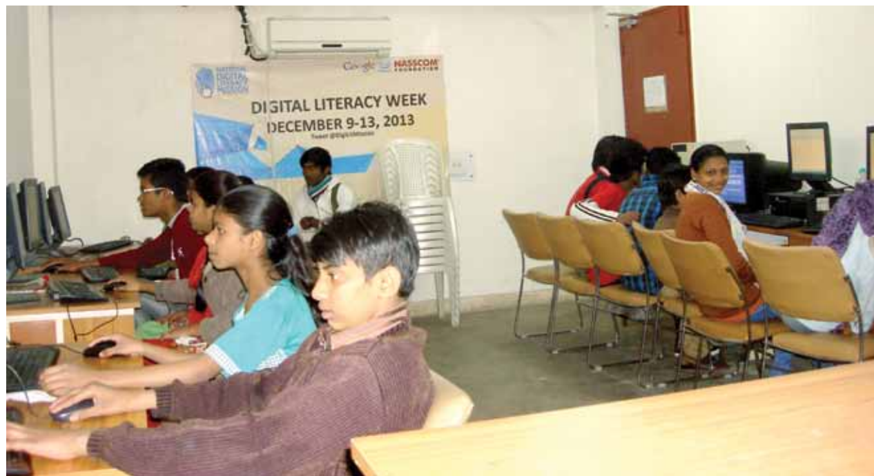
Students of NKN-VYK computer Centre participated in Digital Literacy programme of NASSCOM Foundation held at VYK on 12 and 13 December 2013.

Vishwa Yuvak Kendra is partner for the Community the Youth Collective's programme- My Space – My Un-Manifesto .The objective of the programme is to make the youth realize that we should be “celebrating” politics by participating in it every day of our lives and not merely on Election Day. Two Un-manifesto sessions were organized at Vishwa Yuvak Kendra, for 40 Computer class students and 45 women of yoga class. Un -Manifesto team took the sessions on 23 and 24 December 2014. Team member of Un-manifesto explained the groups the importance of participating in politics which is nothing but “Organising groups and influencing decision making” Women who attended the sessions informed that sessions were very informative and made them aware of various social issues and also realized them their responsibility towards decision making. Groups also enjoyed the movie on political rights, Known but Untold.