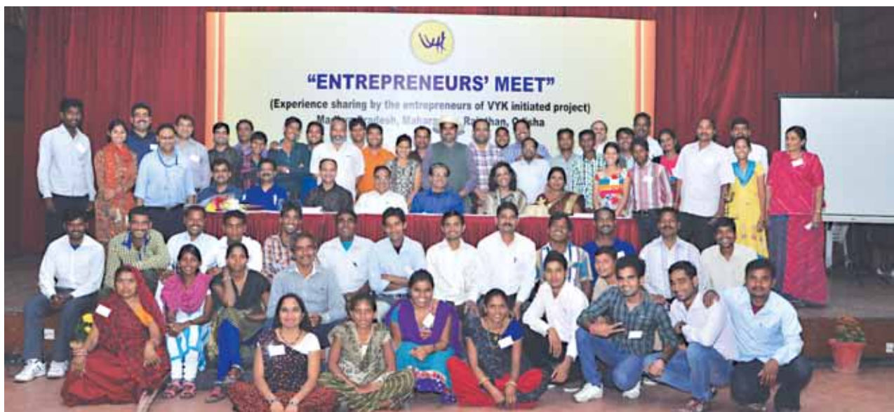
Participants of the training programme, “Entrepreneur Meet”, organized by VYK on 20-21 March 2014.