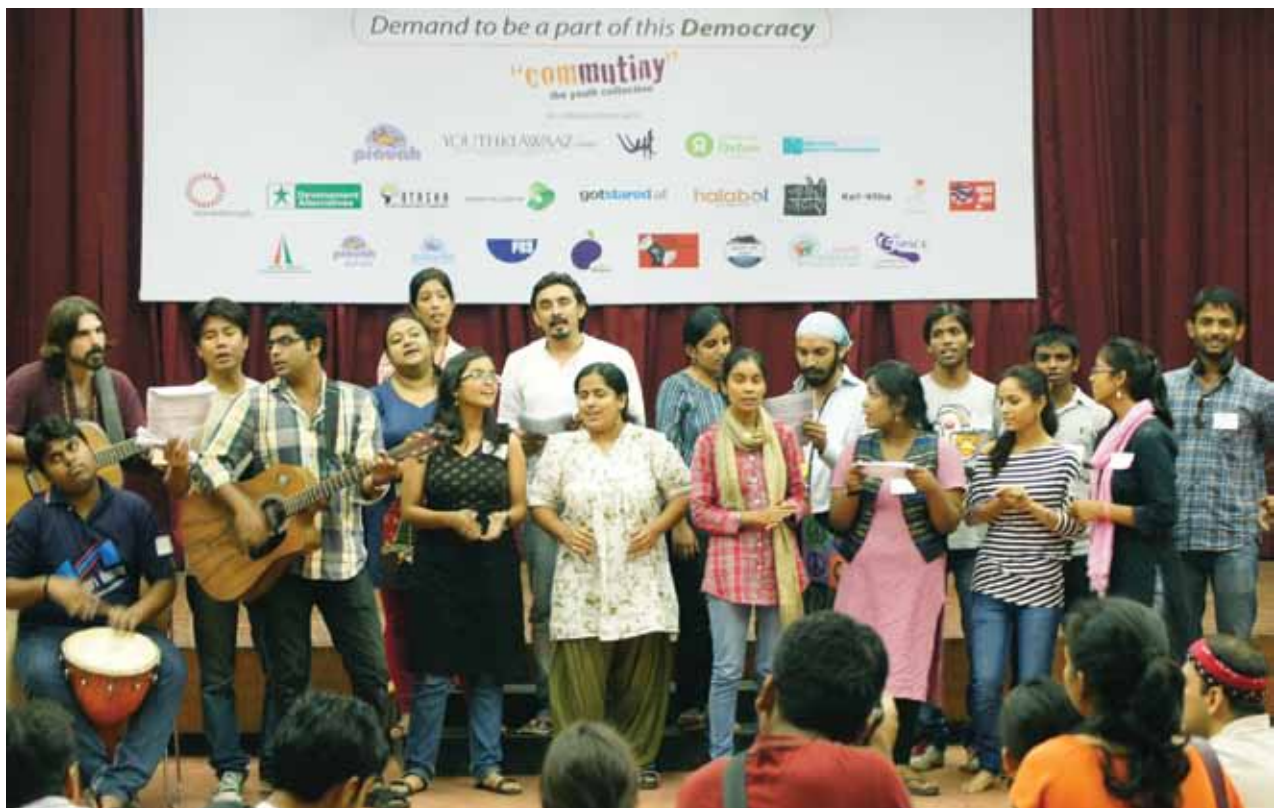
Group song on the theme of UnManifesto by Manzil Mystics - for an event My Space – My Un-Manifesto, held on 19 August 2013.

The event witnessed a participation of nearly 400 individuals, a mix of youngsters from schools & colleges, youth facilitators and people from different communities in Delhi.