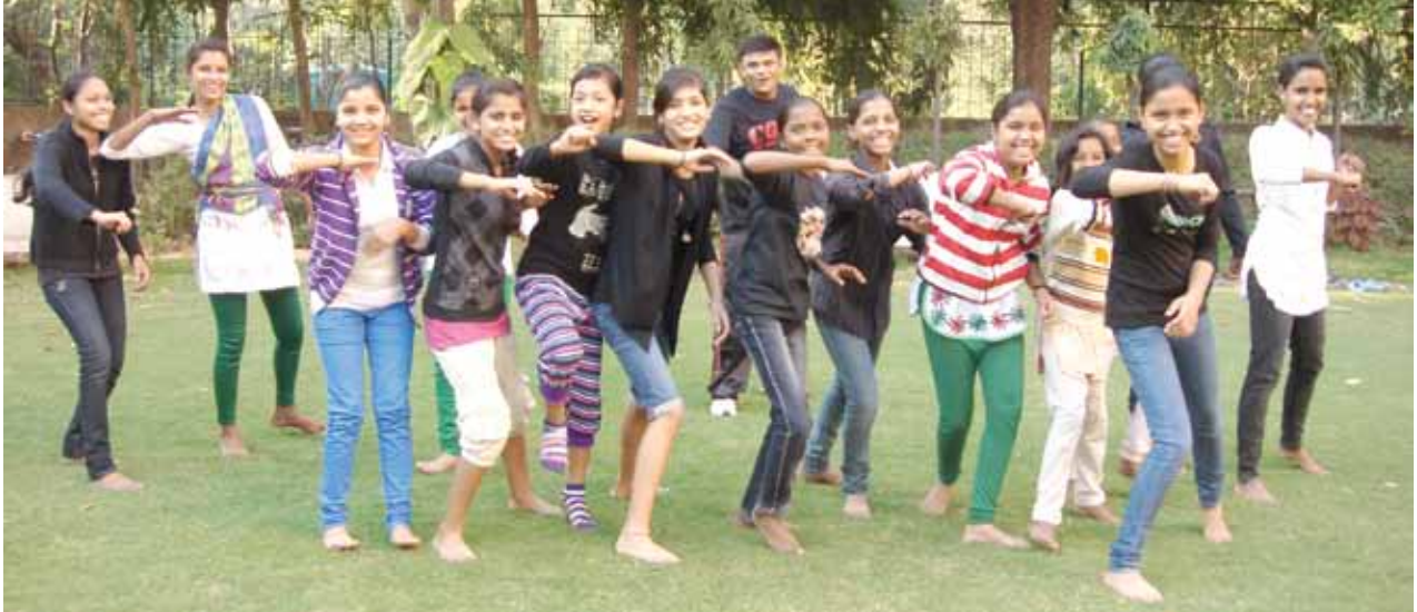
Young girls undergoing training of Self defence conducted by VYK.