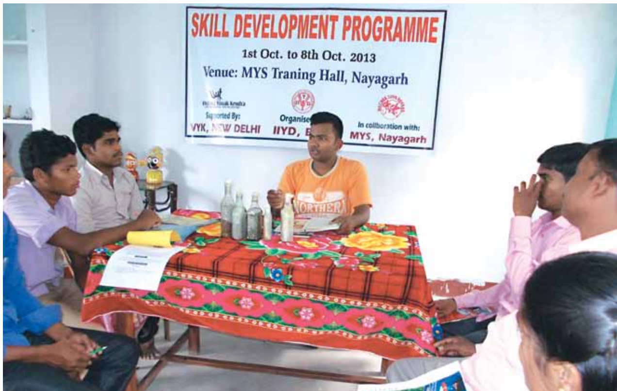
Participants of skill development programme organised by Indian Institute of Youth and Development (IIYD) at Nayagarh, in collaboration with Vishwa Yuvak Kendra.

VYK is thankful to the partner organizations for organizing training in skill development for youth. Skill development training opened a new gamut for youth, where they become