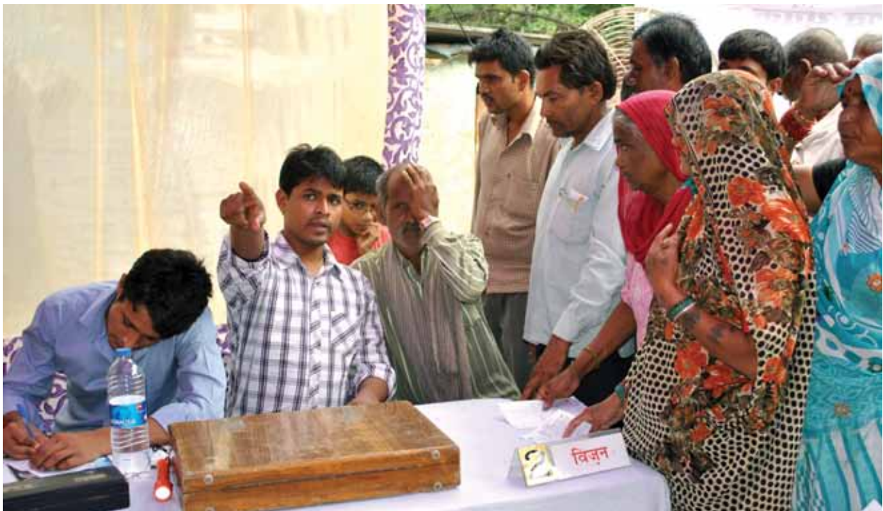
Vivekanand Community Members gather for eye check up on the occasion of Specialised Health Camp on Eye Ailments, held on 28 September 2013.