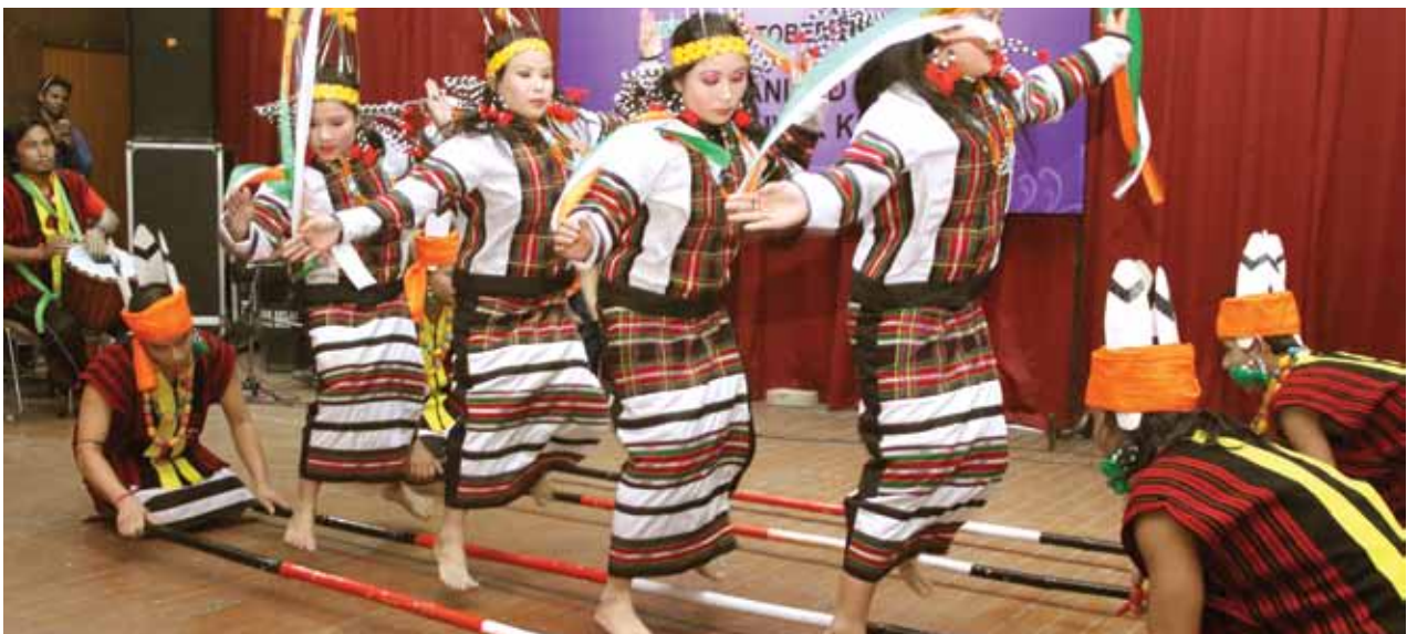
The Bamboo dance or a Cheraw dance from Mizoram was presented by the group from Mizoram, on the occasion of Diwali Festival.