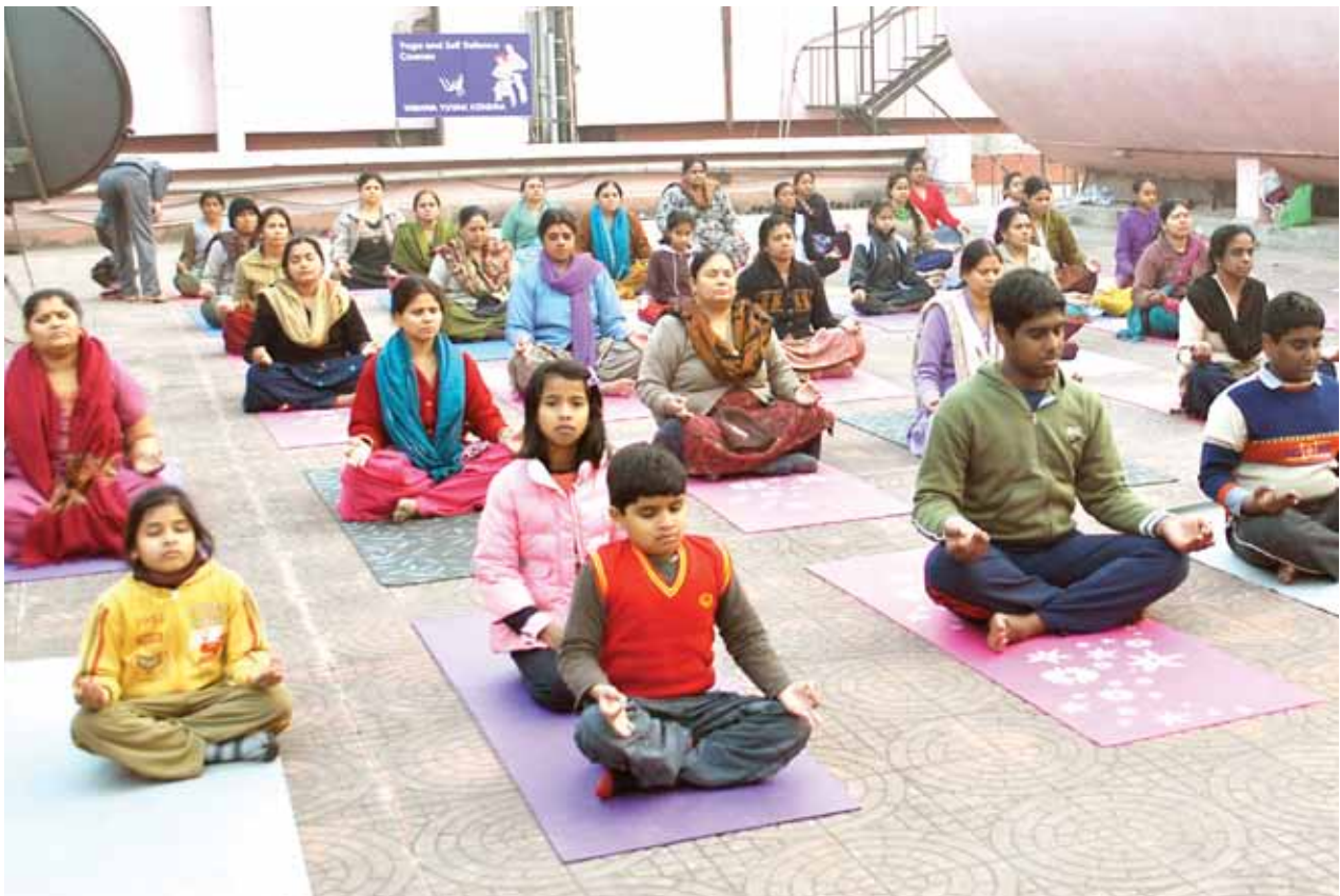
Women and children in Yoga class, organized by VYK in collaboration with Morarji Desai National Institute of Yoga (MDNIY)

Yoga classes commence since October-2013, has received immense response from the students and especially from women. 25 Children and 50 women regularly attended the Yoga-classes from 3 pm to 6 pm, from Monday to Friday. Doing yoga was fun for children and they enjoyed it. Interaction with women revealed that they are gaining health, happiness and harmony due to regular practice of Yoga. They appreciated the teaching and informed that many chronic illnesses such as back pain, headache, and joint pain, cold got cured due to regular practice of Yoga. Women are very much thankful to VYK and Morarji Desai National Institute of Yoga (MDNIY) for providing them healthy lifestyle.