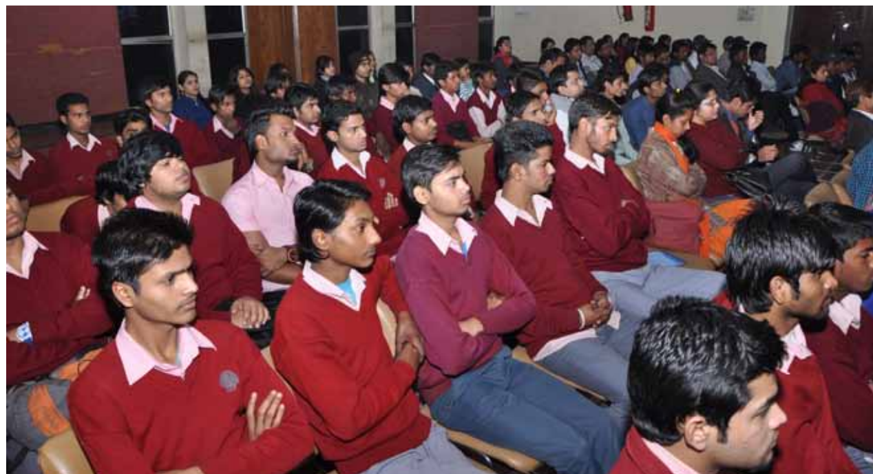
Students from Senior Secondary School, Mandir Marg. The event Talk with Amazing Indians, organised on 29 January 2014, was attended by students from Senior Secondary School, Mandir Marg, New Delhi.

The unique platform for interaction between youth and change makers was provided by Vishwa Yuvak Kendra (VYK), with the aim to motivate youth.