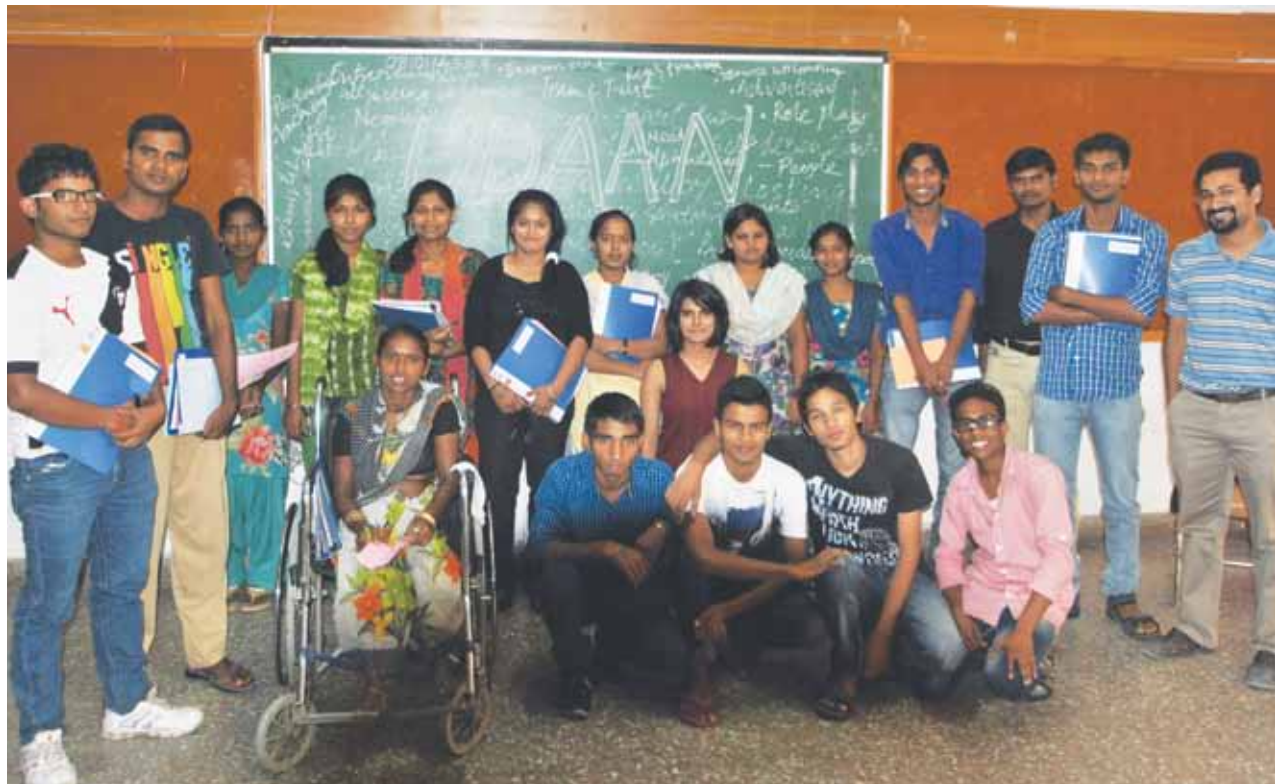
Dhriiti an NGO, in collaboration with Vishwa Yuvak Kendra, Generation Enterprise and World Bank provided training in entrepreneurship to 16 youth from Vivekananda camp, Sanjay Gandhi camp and youth from other communities in the area of skill development.

Skill development programme recognized the multiple intelligence of youth and helped them to initiate their own ventures. To make a demographic dividend a potential, much attention need to give on skills and vocational training to make youth self dependent. In this context, VYK's step towards ensuring quality life for underprivileged youth is very important milesto