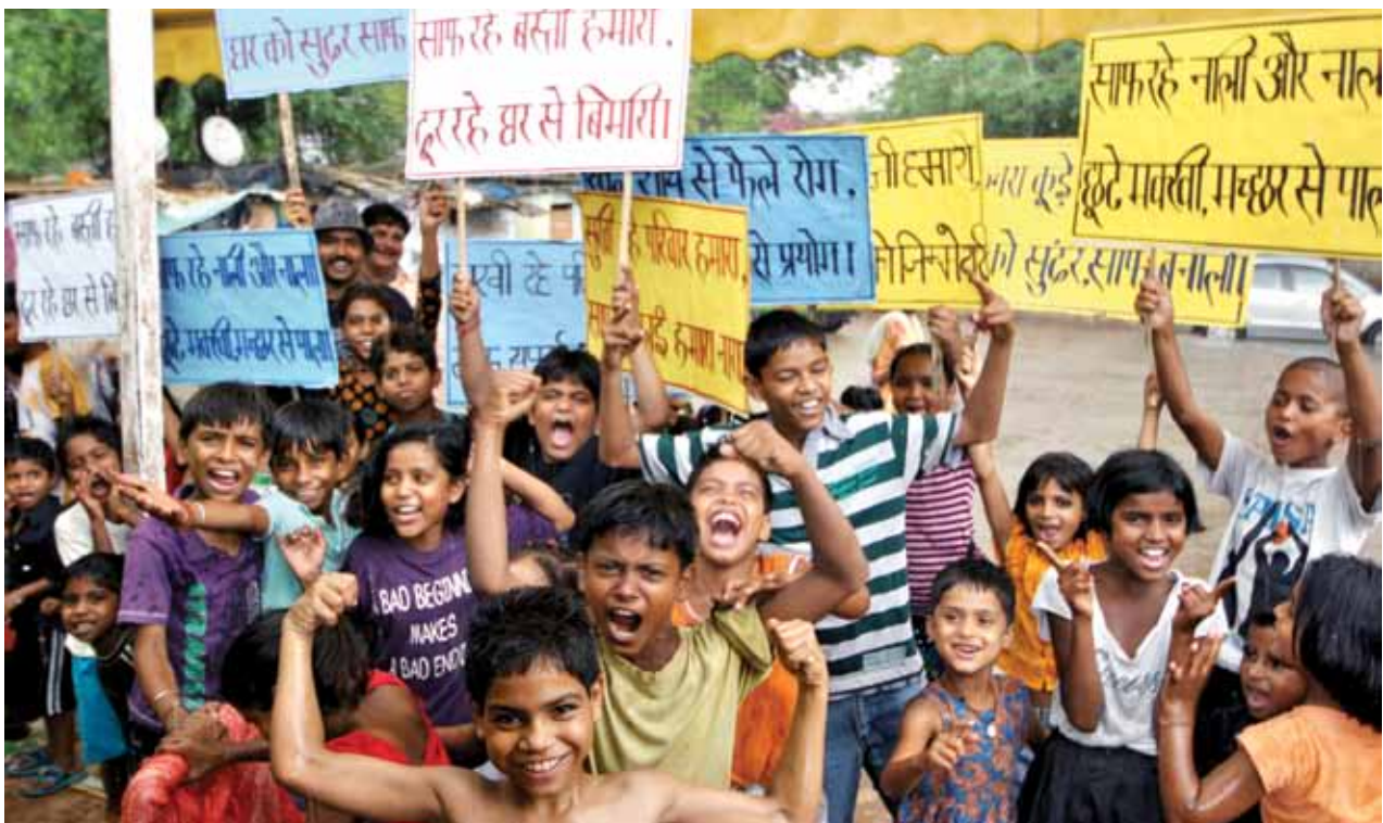
Children of Vivekananda camp participating in the sanitation rally around the settlement

A survey was conducted in the community to ascertain the status of sanitation and people's common understanding on the sanitation issues. A unique methodology was adopted to spread the awareness message in the community. It was decided that sanitation messages will percolate well in the community if children from the community are involved. This methodology worked very well. Under the guidance