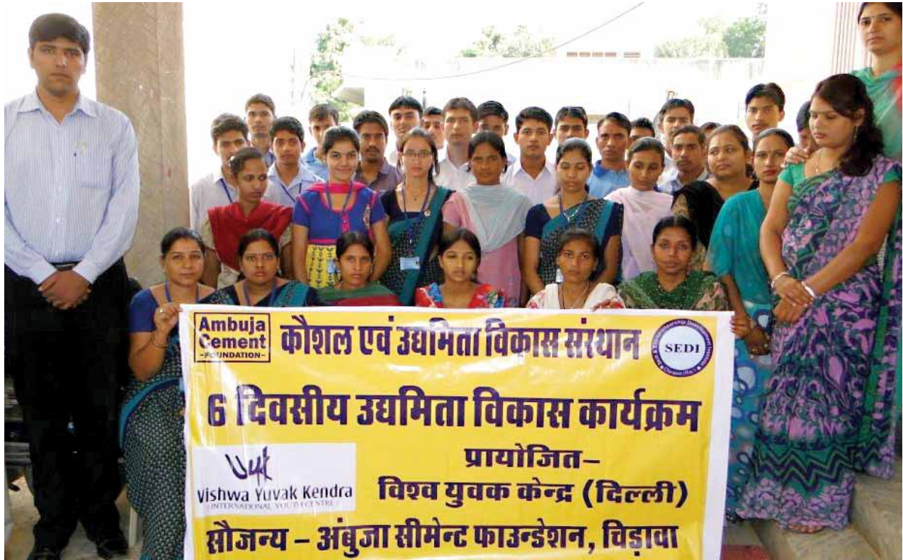
Women group participated in the Entrepreneurship training Programme held on 5-10 August 2013, in collaboration with Skill and Entrepreneurship Development Institute (ACF) at Chirawa.