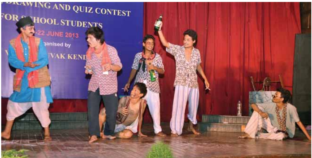
"Naya Kafan" -play performed by Abhigyan Natya Association at VYK, on 22 June,2013.