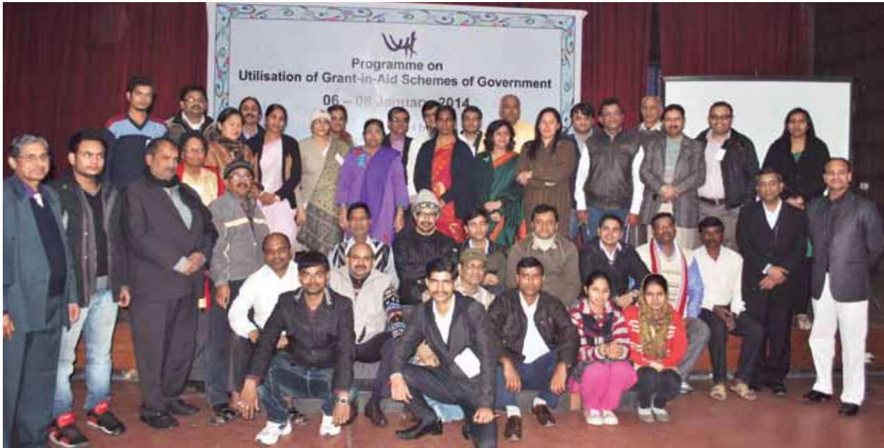
Training programme on Utilization of grant in aid schemes of the Government-Participants of training programme on Utilization of Grant in Aid Schemes of the Government was organized by VYK from 6 to 8 January, 2014.