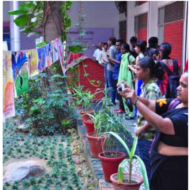
Students and audience having a look at picture gallery after the poster competition held on 26th September 2013, on the occasion of Poster and Debate Contest.