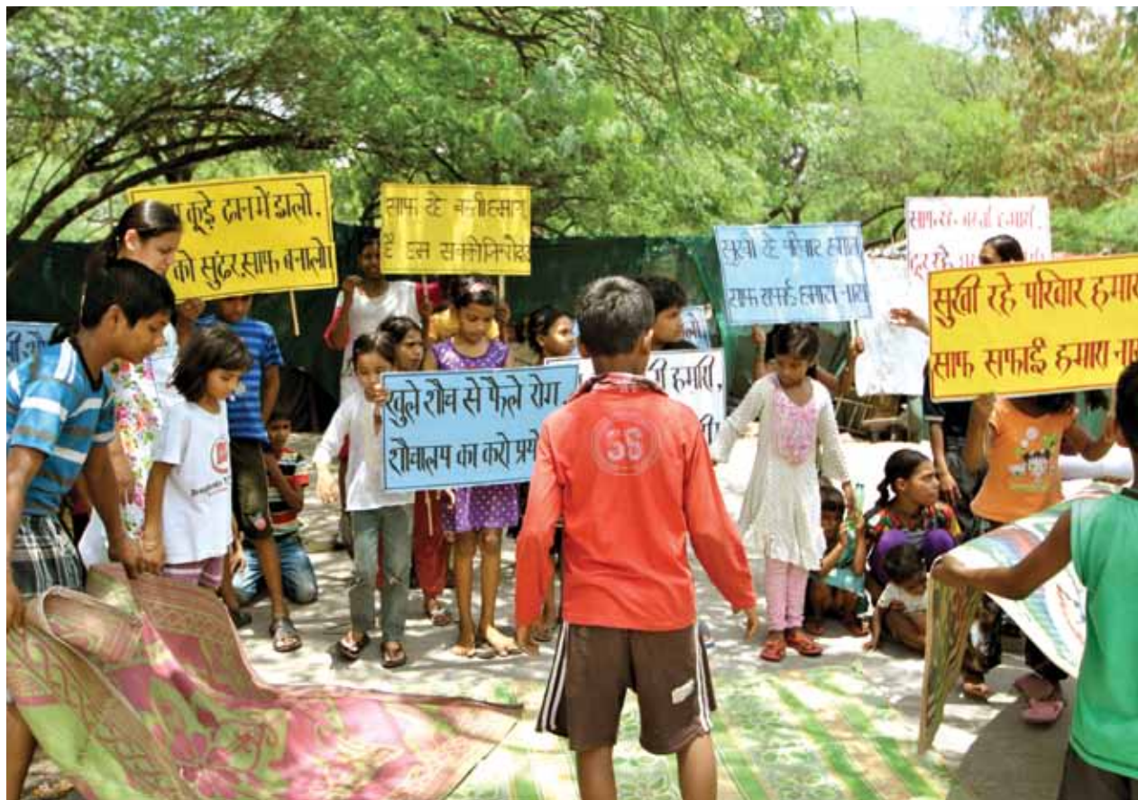
Community children are in action, for performing the play on sanitation, under the guidance of VYK team of ICDP project.