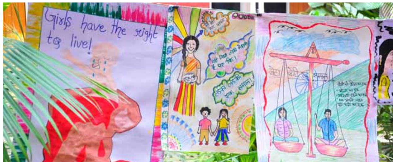
Posters from the competition organized on 26th September-2013