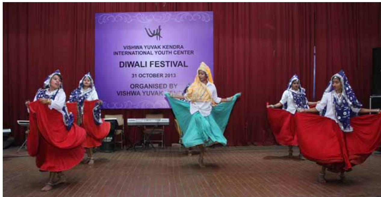
Girls students from YWCA-New Delhi, performed the dance on the occasion of Diwali Festival, held on 31 October, 2013 at VYK.