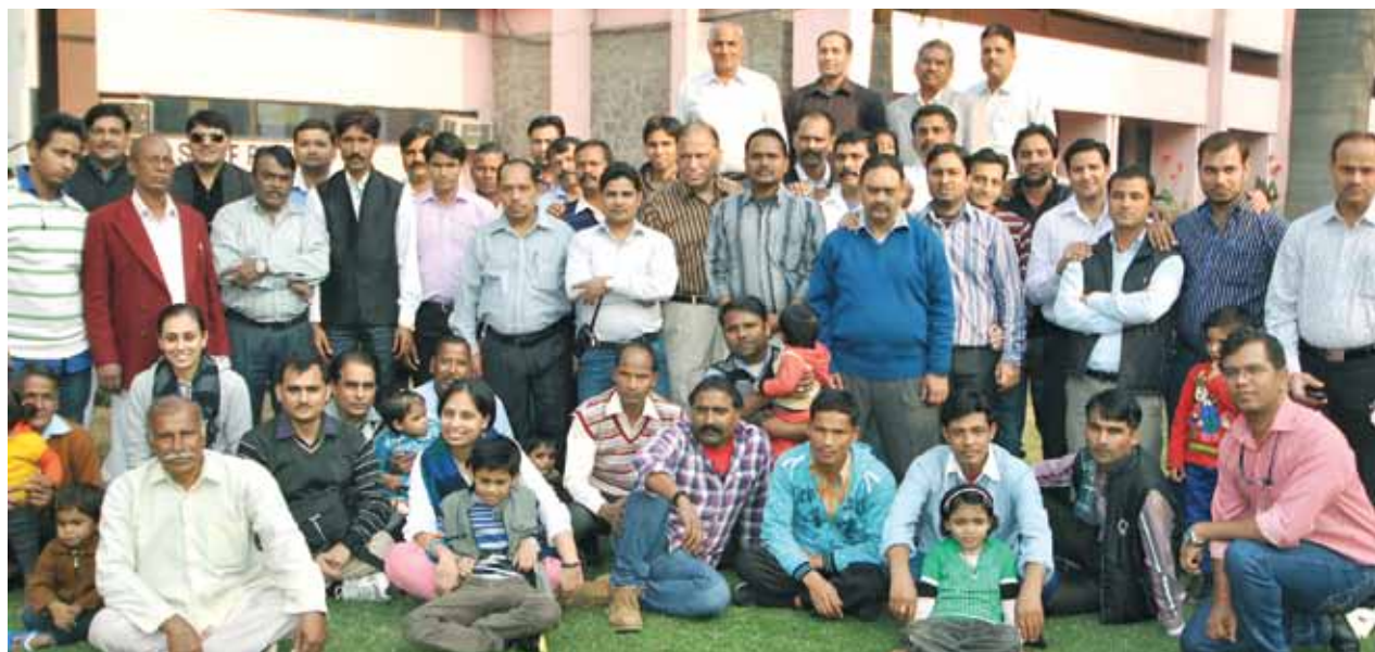
VYK staff at Family Day on 24 December 2013.