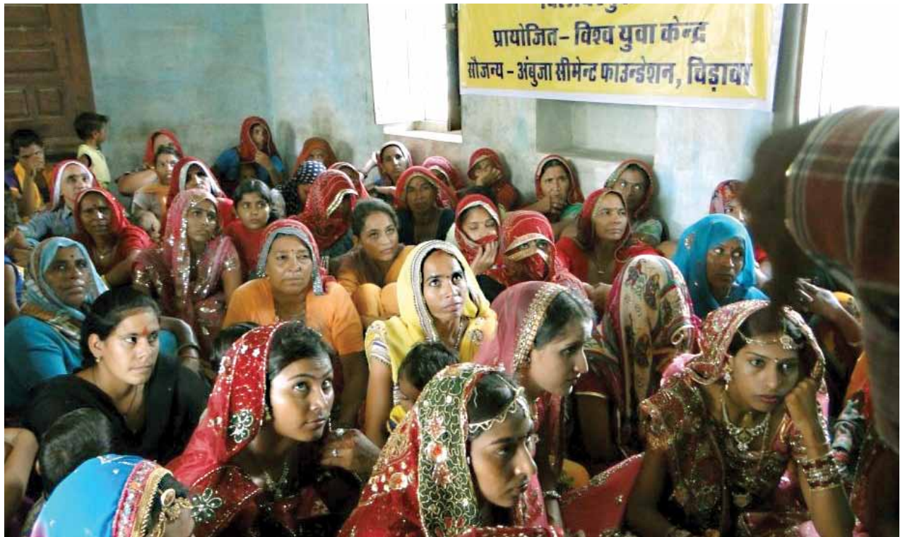
Women group participated in the Entrepreneurship training Programme held on 5-10 August 2013, in collaboration with Skill and Entrepreneurship Development Institute (ACF) at Chirawa.