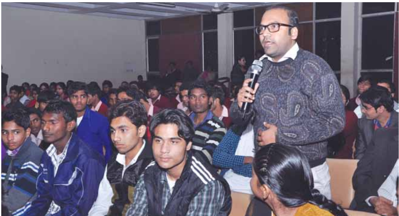
Youth from schools and colleges interacting with "Amazing Indians", at an event, "Talk with Amazing Indians" organised by VYK on 29 January 2014