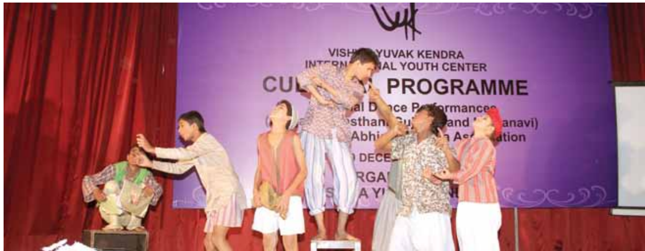
Abhigyan Natya Association performed the play Bade Bhai Saheb by Munshi Prem Chand, on 19 Dec 2013