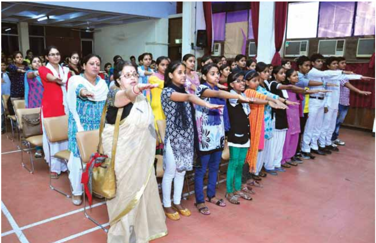
Participants of Poster and Debate contest, took oath on 26th September-2013 at VYK, for not supporting female feticide.