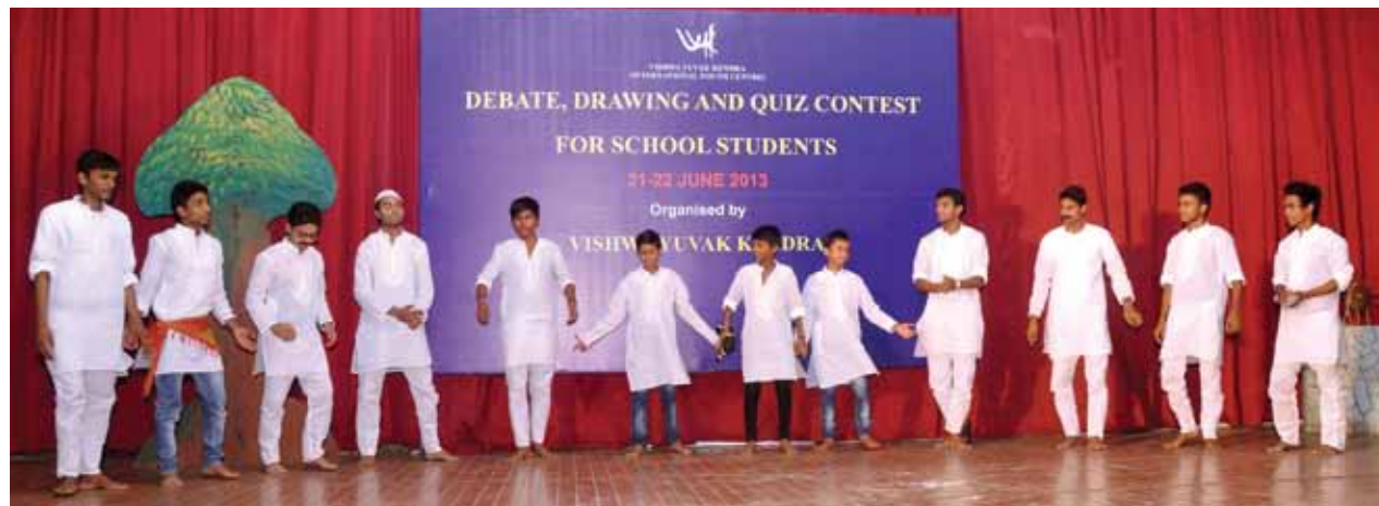
The play, Yam Lok se Prithvi Lok tak, was performed on 22nd June 2013