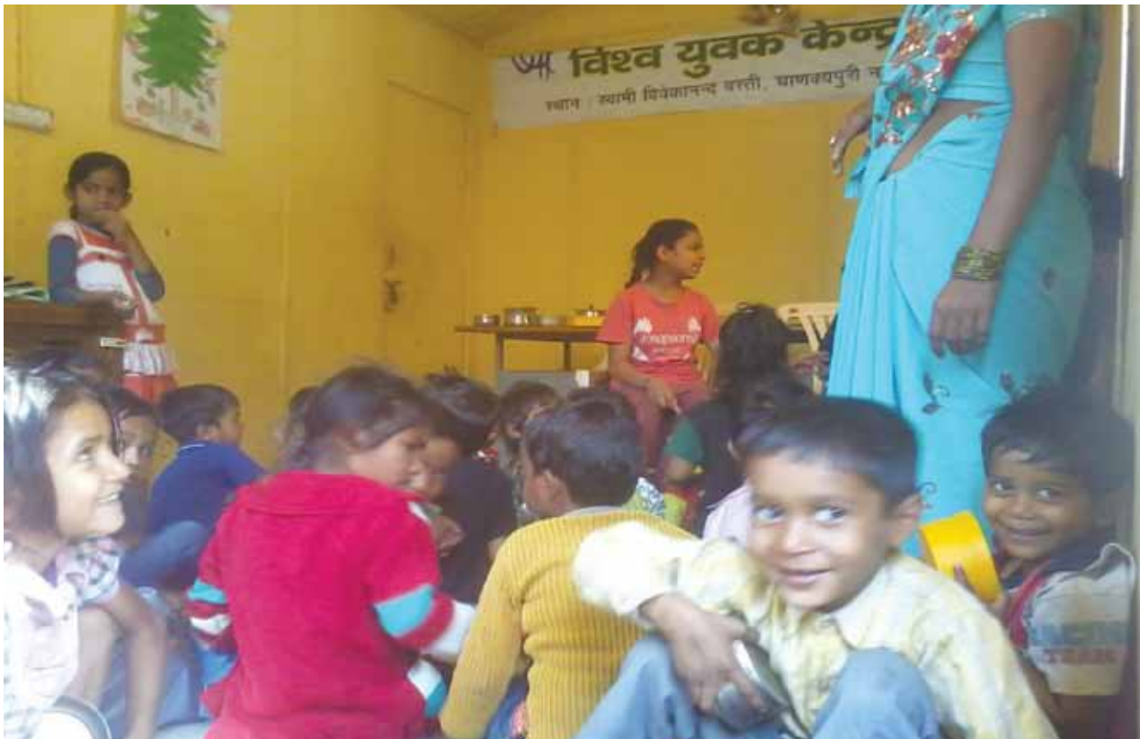
Children are seen enjoying their time at Anganwadi, opend at Vivekananda camp, with the efforts of VYK, in March-2014.