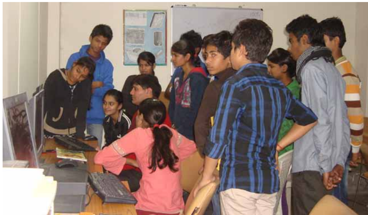
Students are seen in computer class, initiated by VYK at its campus in collaboration with NASSCOM Foundation.