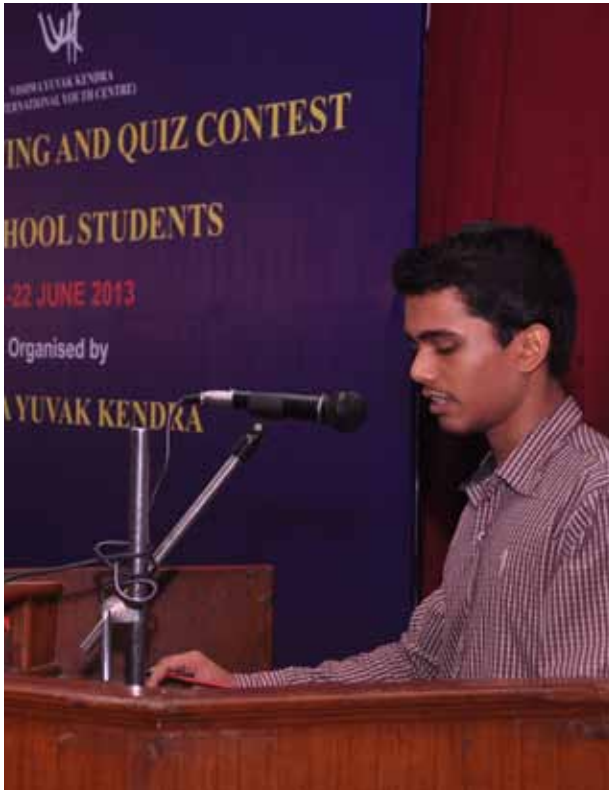
Youth participating at debate contest "Vikasit Takniki ka Hamare Paryavarn per Prabhav-Ya-Dush-Prabhav", organized by VYK on 22 June-2013.