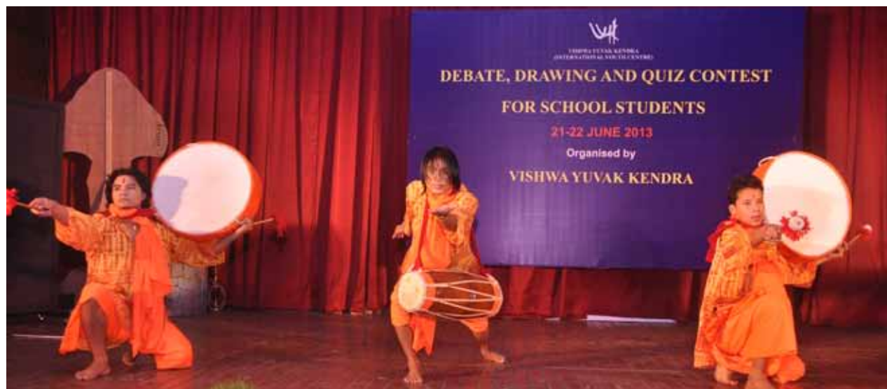
Dhol Chalan dance performed by Brahmputra Bihu Husori Group-New Delhi, on22 June, 2013.

Ninety two students and 13 teachers participated in the programme. The participating schools expressed willingness for participation in future activities of VYK’s programme.