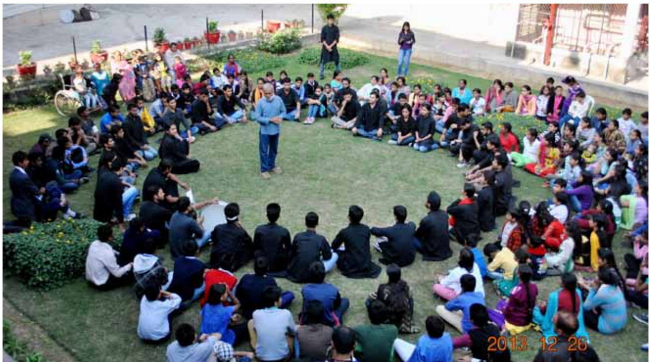
Asmita theatre group performed the play Dastak, on the occasion of, International day on Violence Against Women, on 25 November 2013.