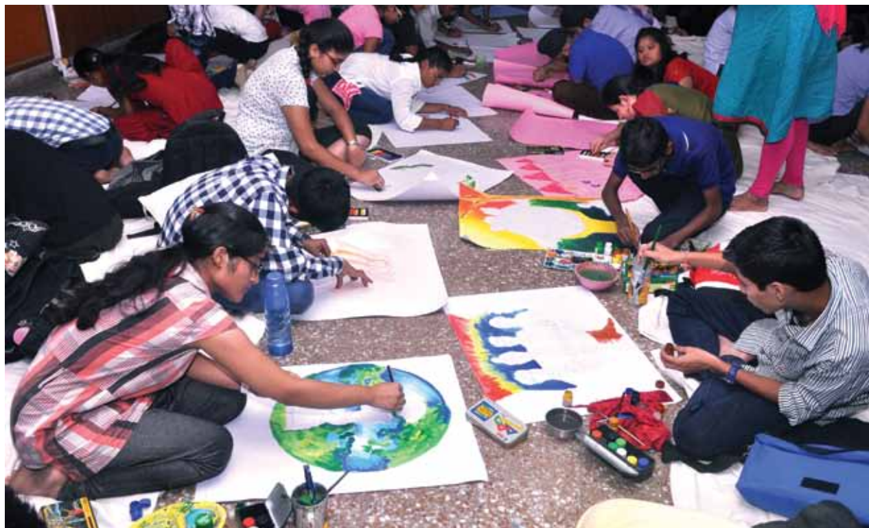
Youth participating in drawing Contest at VYK, held on 21 June, 2013.