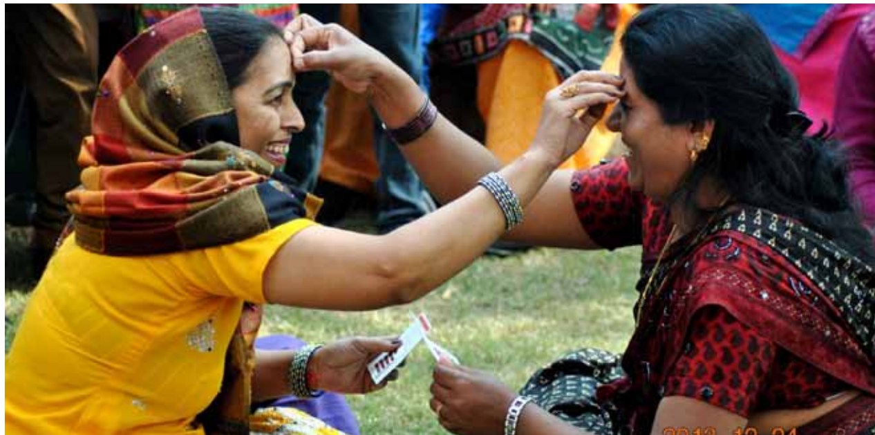
Women are seen enjoying the Bindi-Pasting -game organized on the occasion of Family Day, organized at VYK,

Family day programme is a regular feature of VYK. This year it was organised in December. All the staff members came with their families and enjoyed the full day event with various programmes, which comprised of programmes for children and women. It was a good opportunity to know each other's family members.