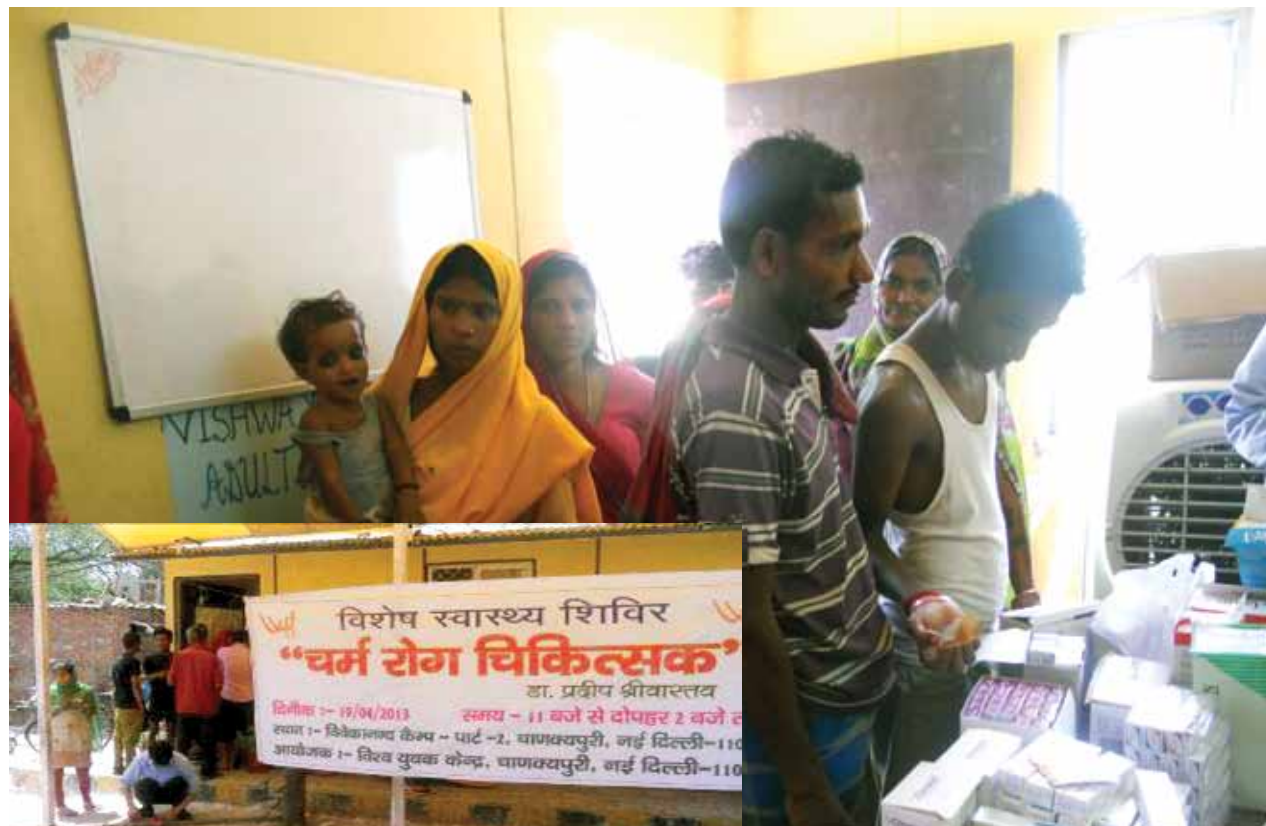
Patients gather at Specialized Health Camp at Vivekanand Community, organised by Vishwa Yuvak Kendra, on 19 April 2013