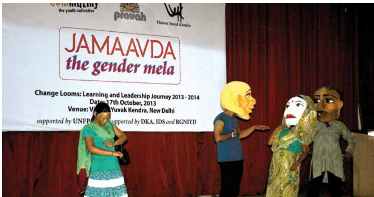
Theatre performance on 17 October 2013, at the event, Jamaavda-The gender Mela, organised by Pravah and Commutiny – The Youth Collective in partnership with VYK.

The gender mela was followed by the four days residential workshop for Changelooms participants from 18 to 21 Oct 2013. Youth interest groups working on Gender Based Violence were brought together to showcase their work, participate in a learning workshop and to share their concerns and hopes about the work that they do and celebrate youth leadership together.