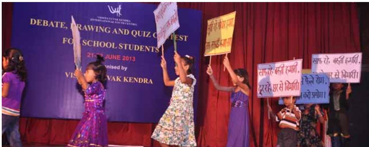
The short play, Swachata Ka Mahatwa, was performed by the children from Vivekanand Community on the occasion of Cultural Programme, held on 22 June 2013.