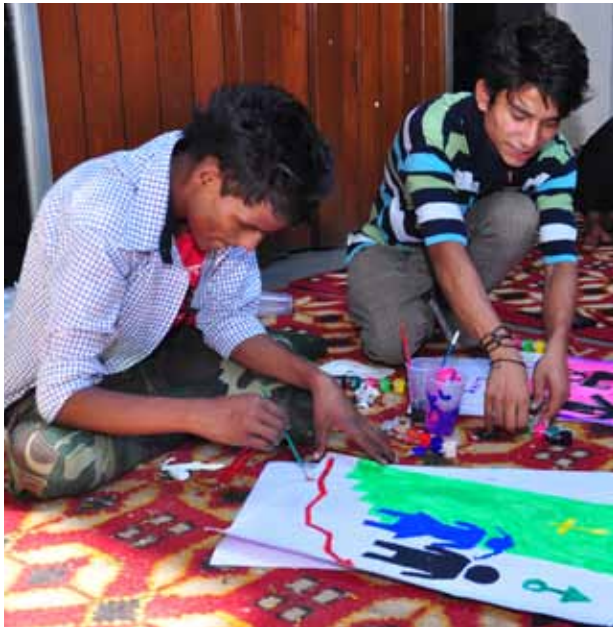
Youth participated in poster competition on female feticide held on 26th September-2013 at VYK, on the occasion of Poster and Debate Contest.