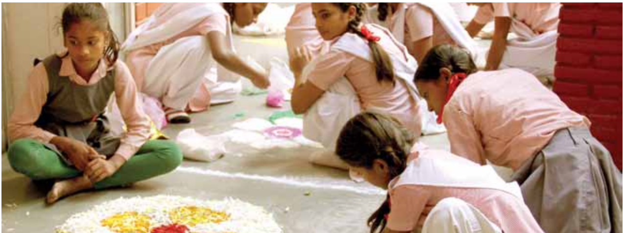
Schools girls participating in the Rangoli contest, held on 31 October, 2013, at VYK, on the occasion of Diwali Festival.