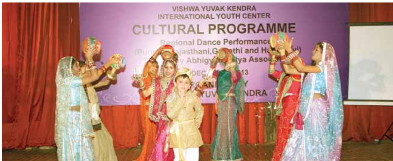
Girls from Lions Vidya Mandir, performed the candle dance on 19 December 2013.