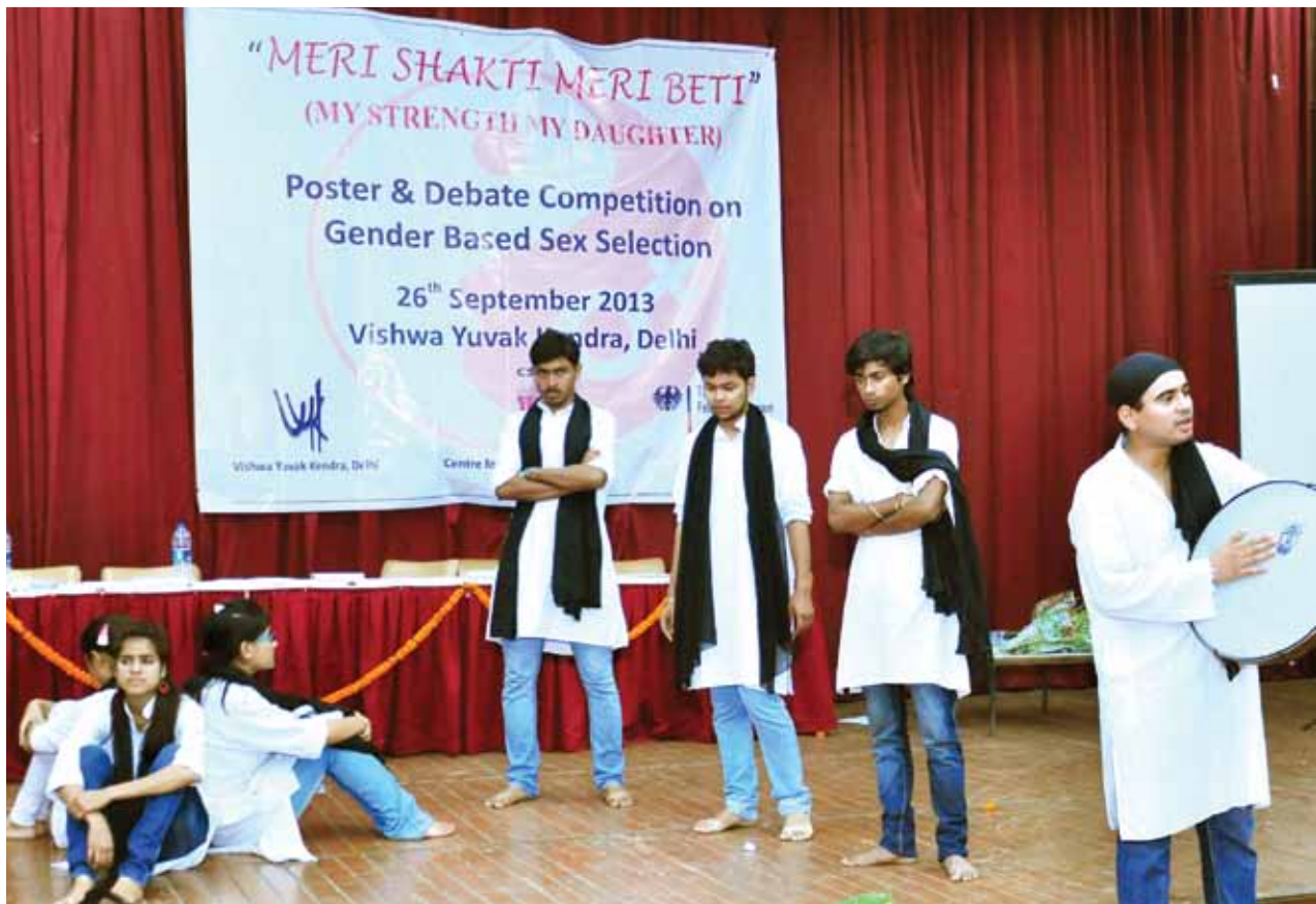
Pukaar – a play was performed by the students of Bhaskarachary College, Dwarka at the Poster and Debate contest, held on 26 Sept-2013.