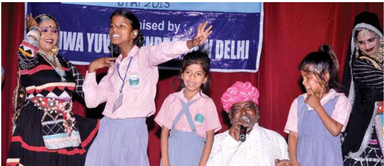
Girls from Aanchal School participating in the dance performed by Rajasthani dance group on 8 May 2013 at VYK