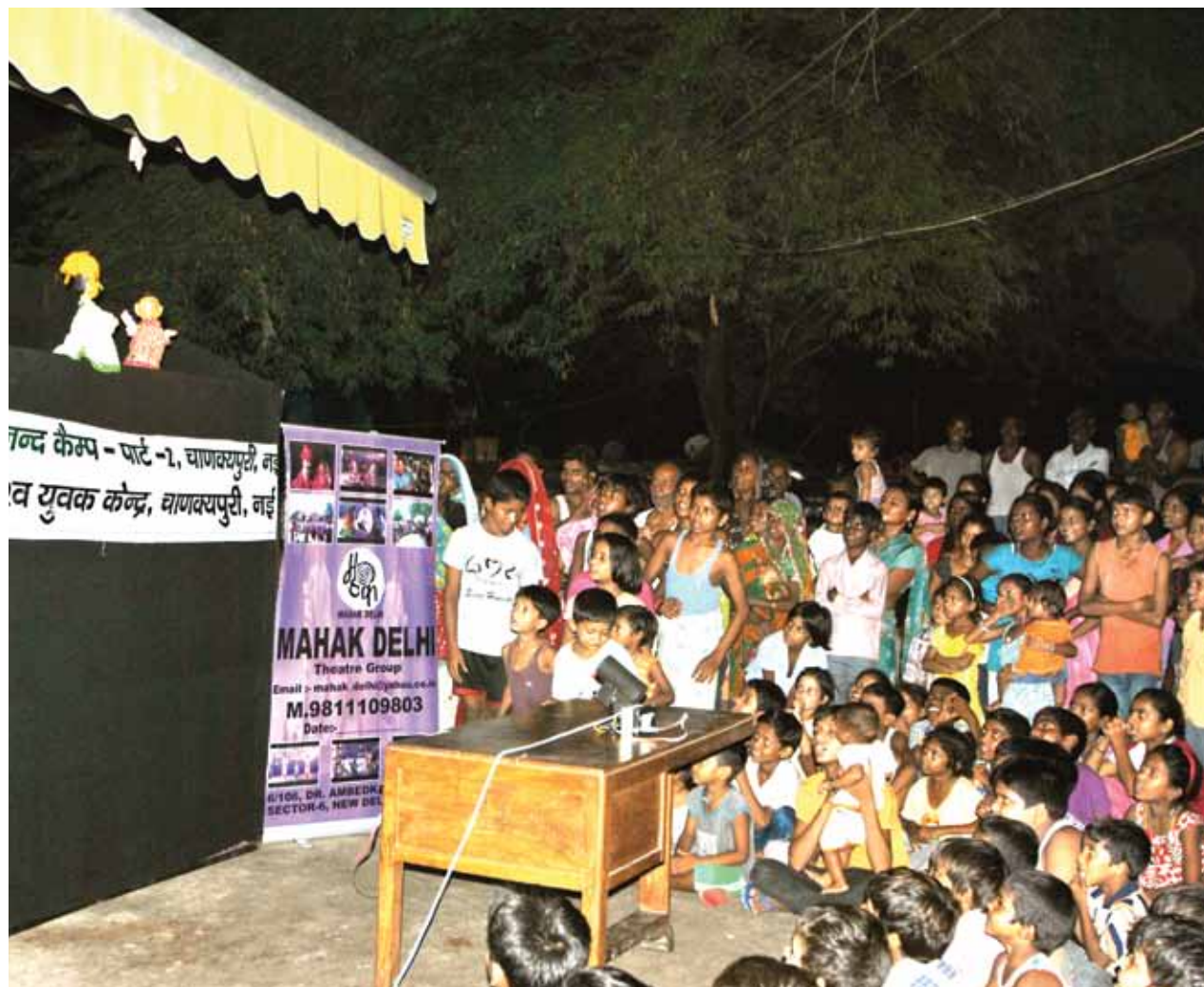
Populace of Vivekanand Community enjoying the puppet show, organised by VYK on 30 Sept-2013.

On 7 August, and 30 September 2013, puppet shows were organised at Vivekananda camp and Shankar Camp respectively, which focussed on topics like impact of domestic violence, substance abuse and gambling. It also focused on the issues of women education, health and hygiene. The 45-minute programme was attended by the community members, including women and children.