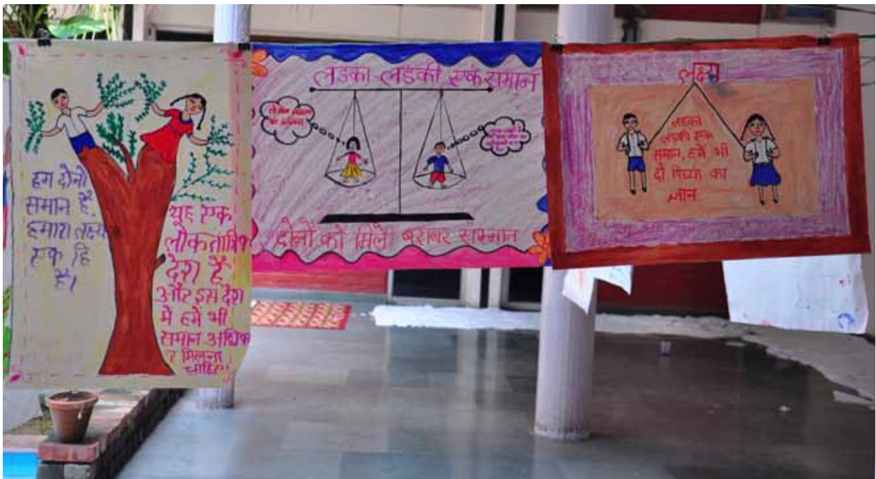
Posters from the competition organized on 26th September-2013