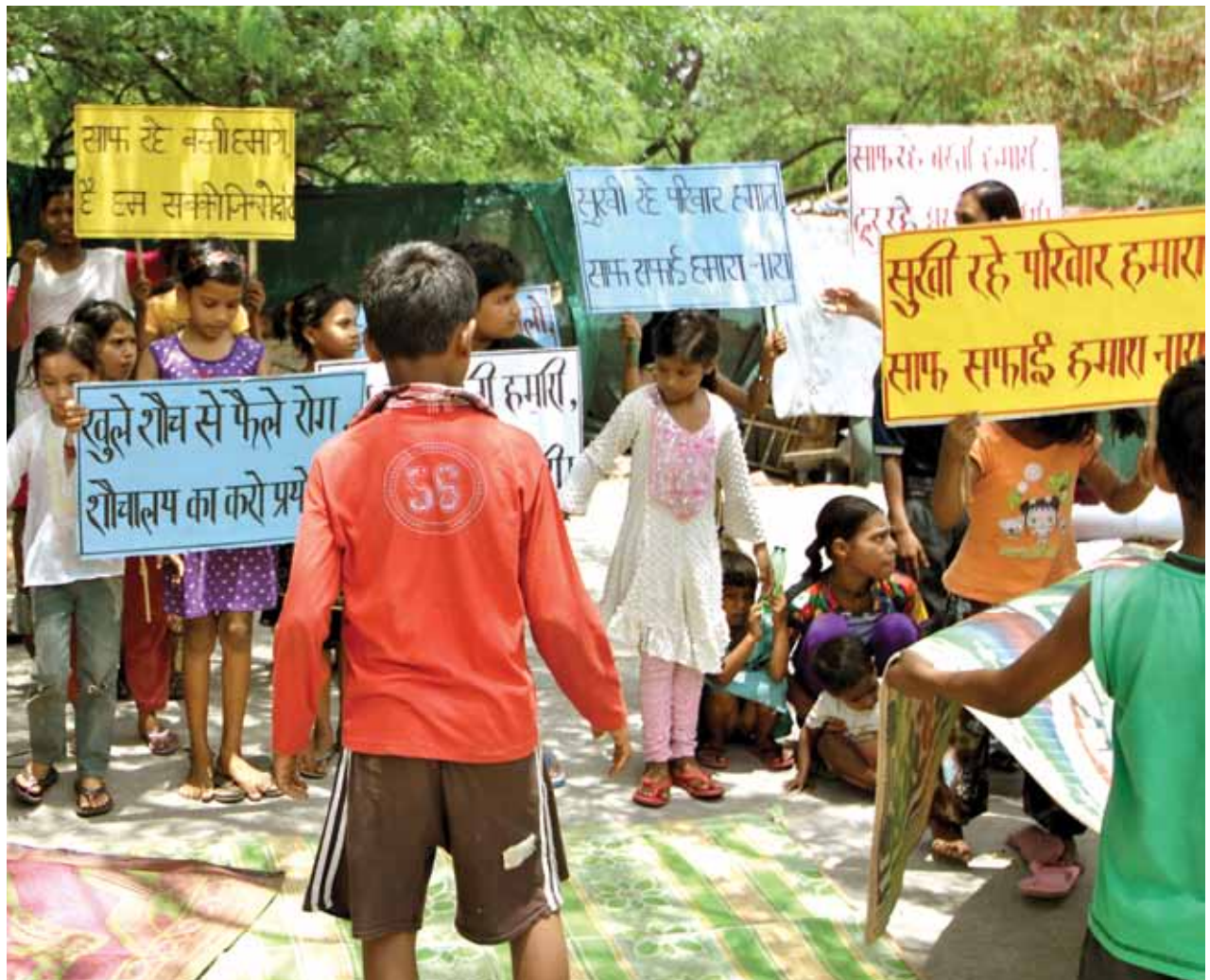
Community children are in action, for performing the play on sanitation, under the guidance of VYK team of ICDP project.

VYK's Integrated Community Development Programme (ICDP) implemented various educational, health, sanitation and awareness programs at Vivekananda Camp and Shankar Camp, which is reaching to maximum number of beneficiaries.