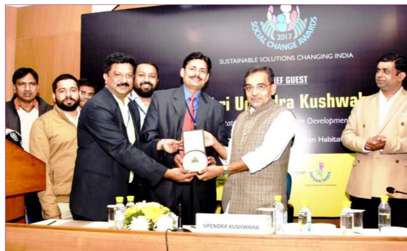
VYK Team receiving award from the Hon'ble Minister Shri Upendra Kushwaha

Vishwa Yuvak Kendra (VYK) won the Social Change Award 2017 in the category of Education and Training in Youth Development. The award, instituted by Nextgen Sustainable Social Solutions Pvt. Ltd. was presented by Shri Upendra Kushwaha, Hon'ble Minister of State, Ministry of Human Resource Development, Government of India, in a function organized at India Habitat Centre on 11 December, 2017.