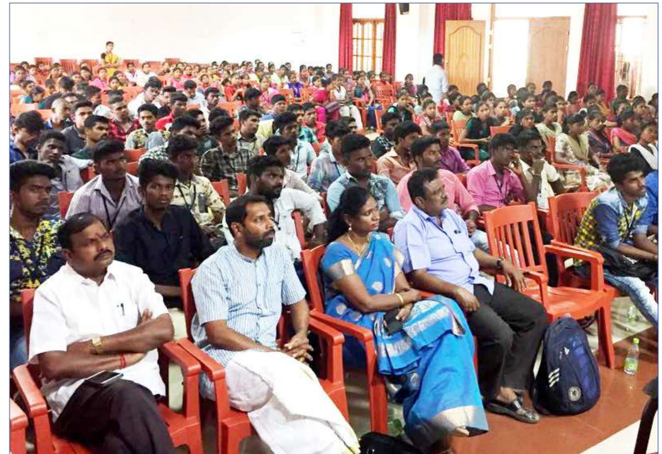
Glimpse of participants during session