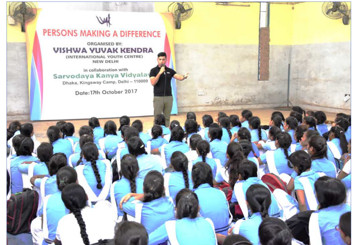
Glimpse of ongoing session

Talk and interaction held with influential personalities create a motivational effect on the youth. Vishwa Yuvak Kendra (VYK) provides such opportunities to youth through series of events to interact with path breaking individuals. In series, the 19 th such event "Persons Making a Difference" was organized on 17 October, 2017 at Sarvodaya Kanya Vidyalaya (SKV), Kingsway Camp, New Delhi. The mission of Simple Education Foundation (SEF) is to create holistic learning solutions and transform the public education system. The vision of SEF is to provide education to all children and preparing them to navigate through a dynamic and well-connected 21 st century world.