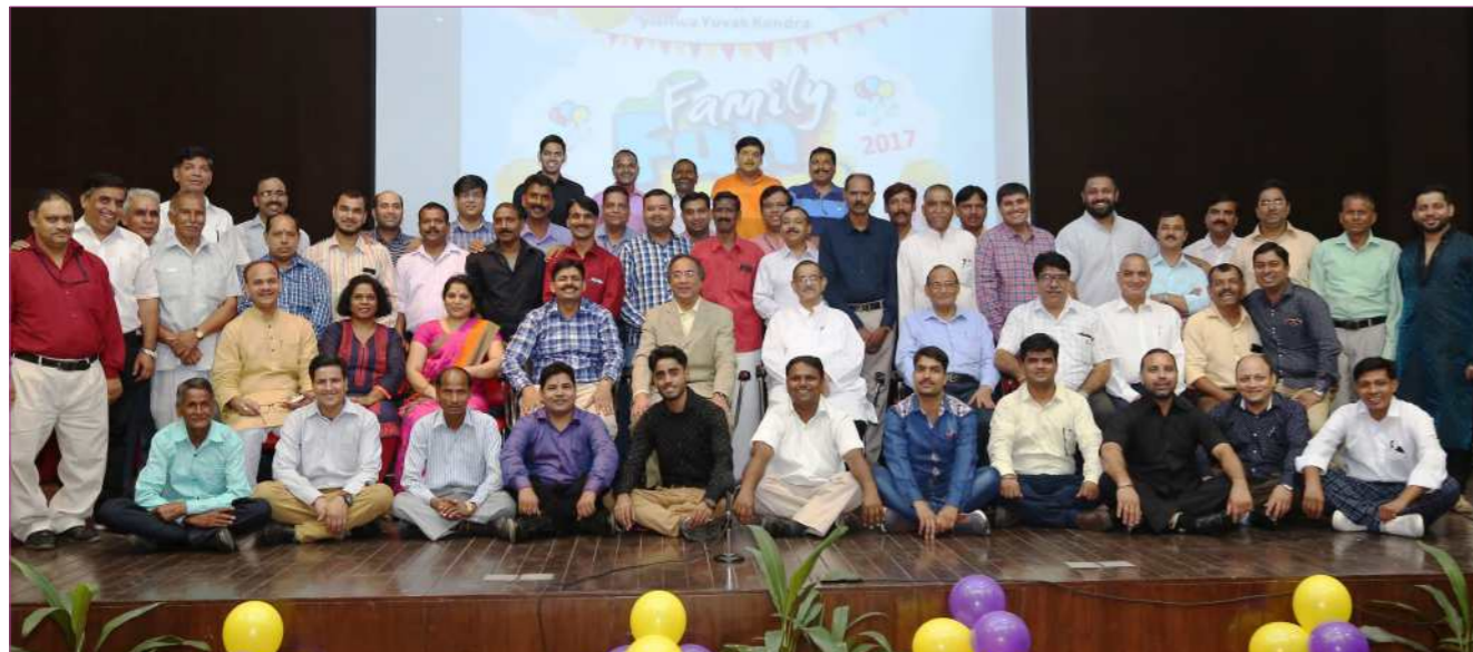
Group photograph of VYK family