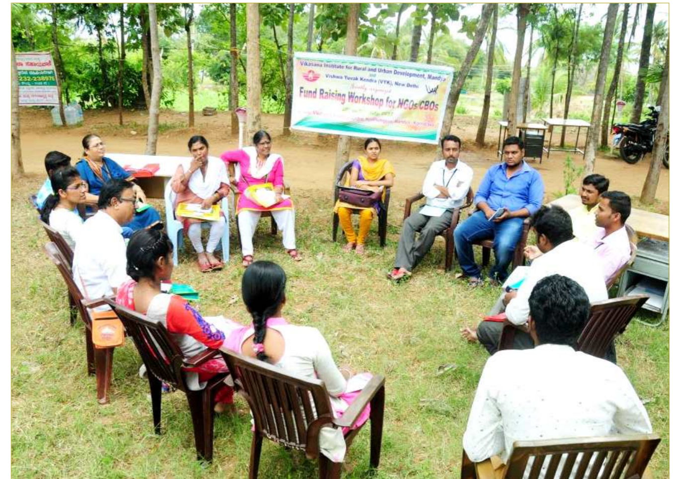
Glimpse of participants during Group Discussion