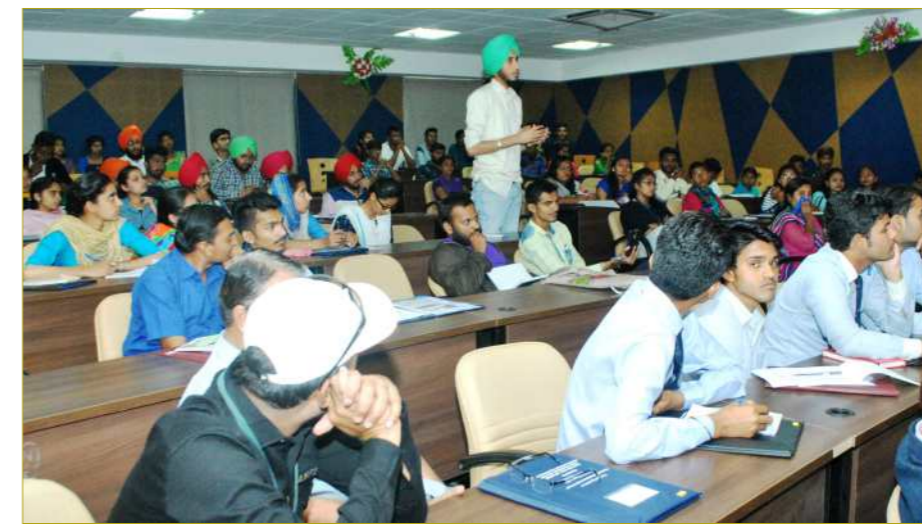
Participant posing query to the speaker