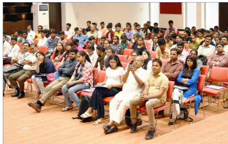
View of participants