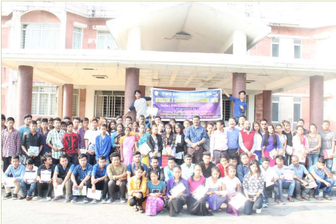
Group photograph of participants