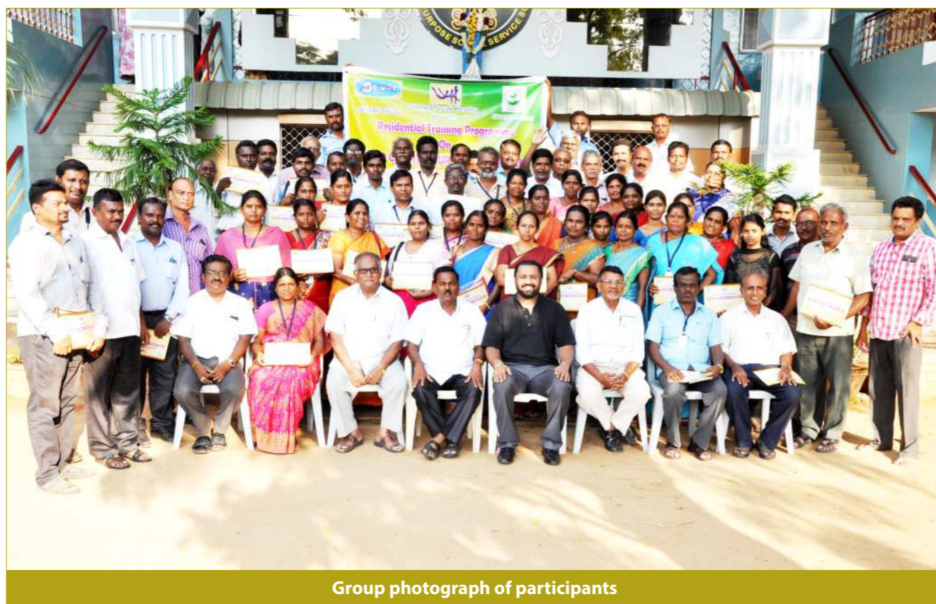
Group photograph of participants