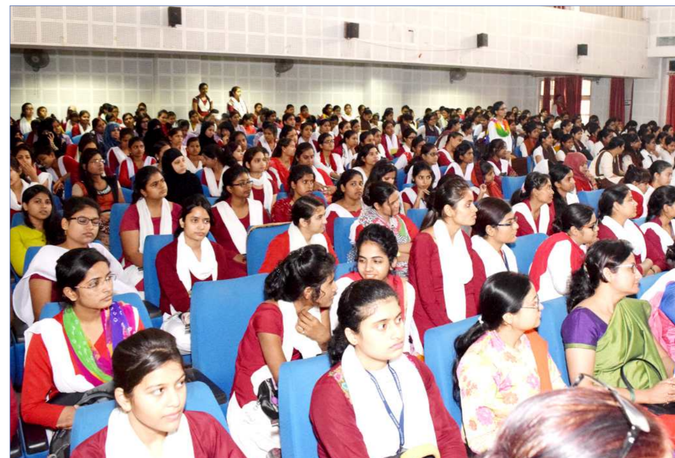
View of students