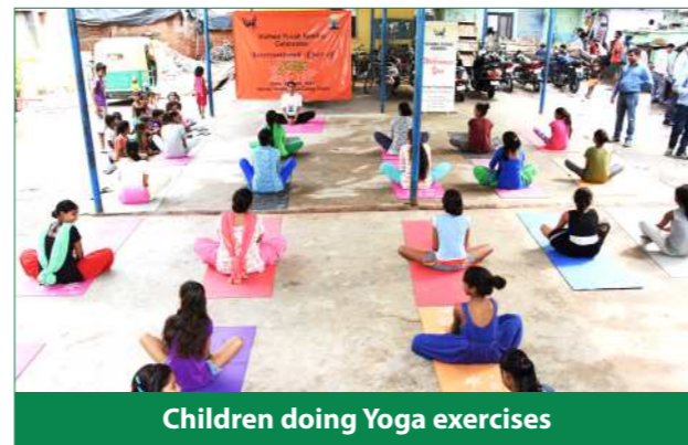
Children doing Yoga exercises

On the occasion of 3rd International Yoga Day, VYK organized a programme to apprise community people about Yoga on 21 June, 2017 at Vivekanand Camp. The event was participated by women and girls of the community. The trainer of Yoga informed the participants that just five minutes of Yoga a day can transform the whole life of the person. Some common exercises of yoga were performed by the participants to demonstrate the community people to follow.