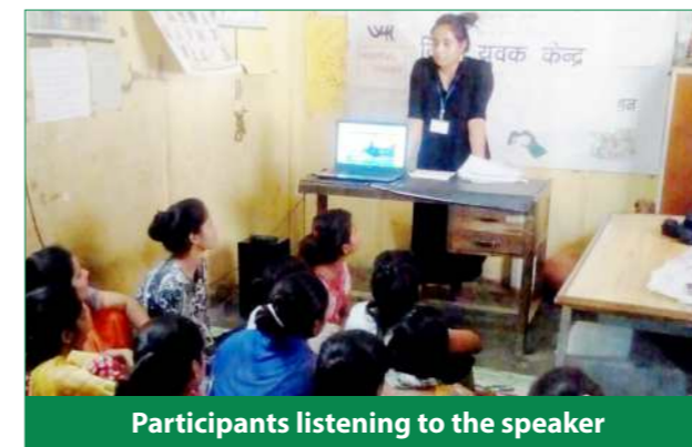
Participants listening to the speaker

VYK organized an awareness generation activity on "Menstrual Hygiene Management" among girls and women at Vivekanand Campon 20 September, 2017. The objective of the event was to create awareness and popularize menstruation as usual physical process of life. A documentary on the subject was also shown to the participants. The components highlighted in the event include process of menstrual hygiene, use of required products and safe disposal, keeping cleanliness and steps of hand washing technique. Prevalent myths and misconceptions related to menstruation were discussed among a total of 35 participants.