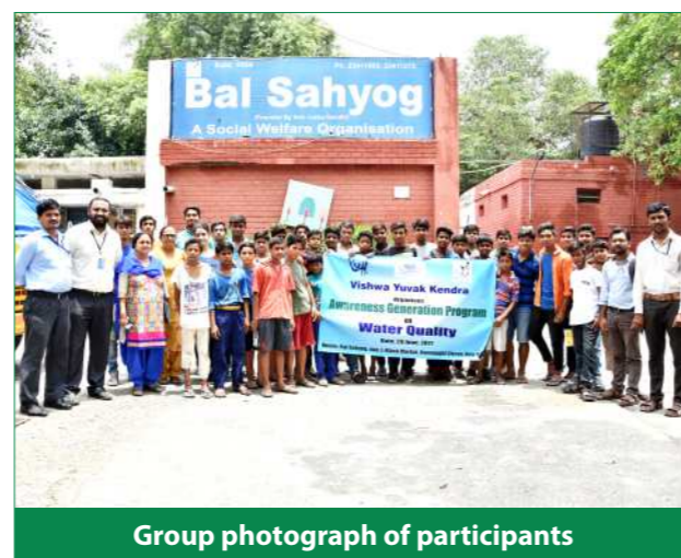
Group photograph of participants

VYK organized three awareness generation activities on "Quality of Water" jointly with the Delhi Chapter of Fresh water Action Network South Asia (FANSA) in different communities of Delhi. The activities organized on quality of water include: the first at Vivekanand Camp, Chanakyapuri on 22 June, 2017 which was participated by 28 people. The second one at Shankar Camp, Moti Bagh on 23 June, 2017, joined by 54 people and the third was organized jointly with 'Bal Sahyog', NGO at Connaught Place, New Delhi. This event was attended by 57 participants.