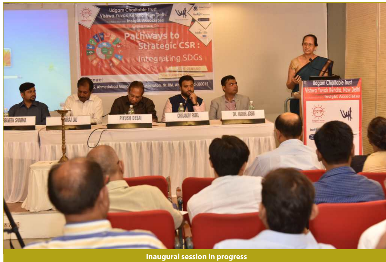
Inaugural session in progress