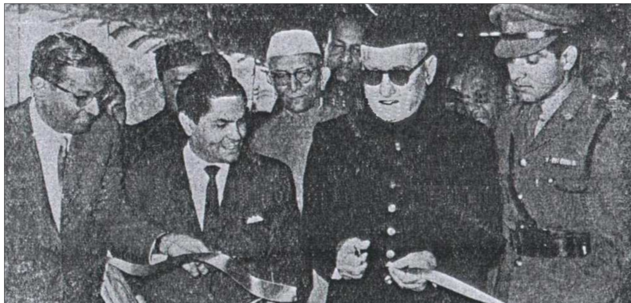
Dr. Zakir Husain, the then President of India, inaugurating the building of Vishwa Yuvak Kendra