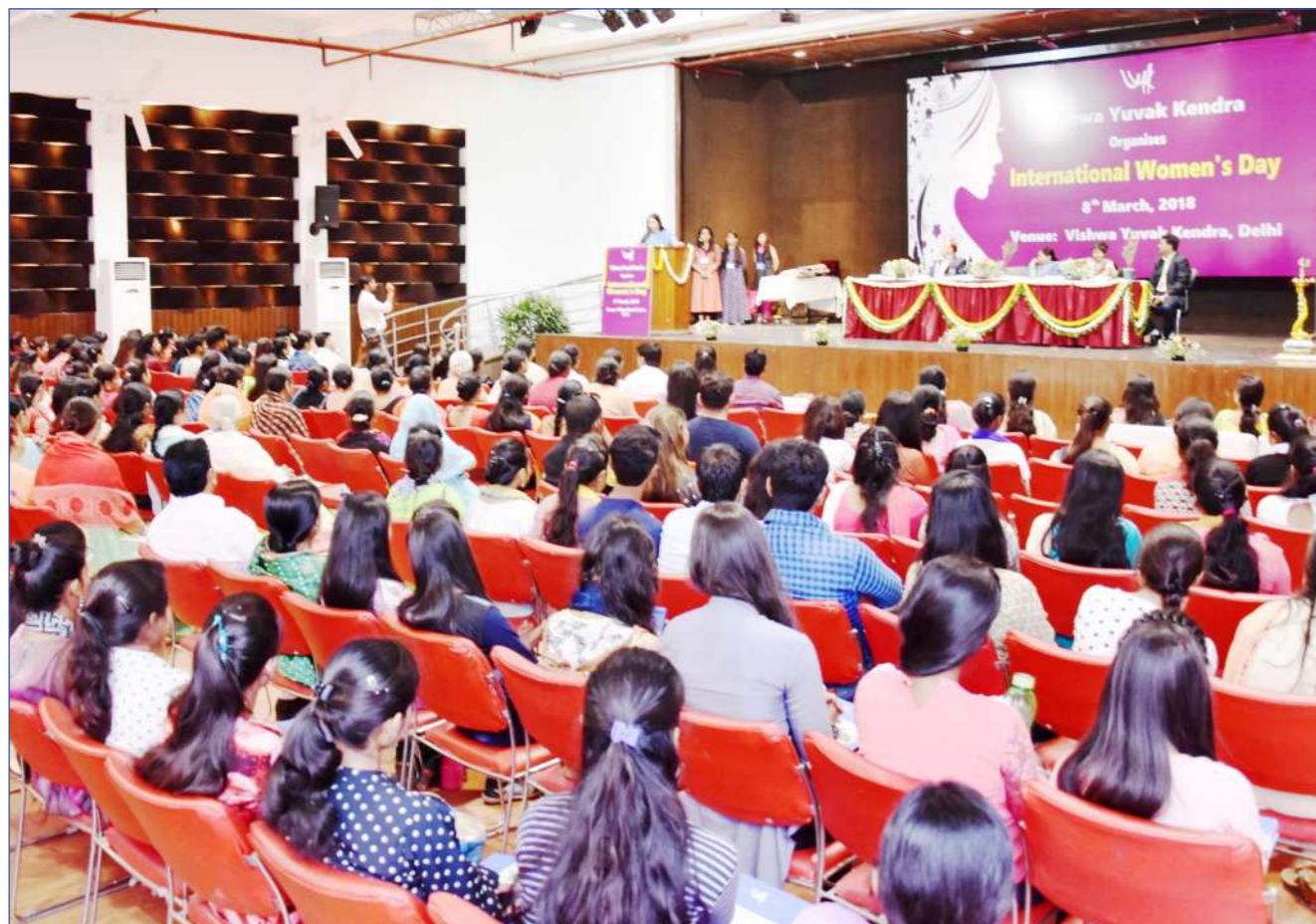
Hon'ble MP Mrs. Meenakshi Lekhi addressing the participants