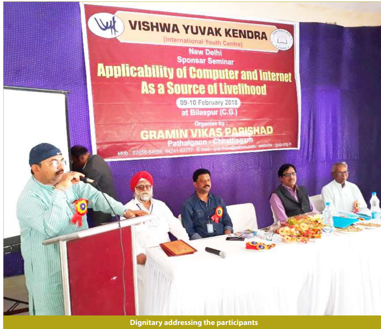
Dignitary addressing the participants