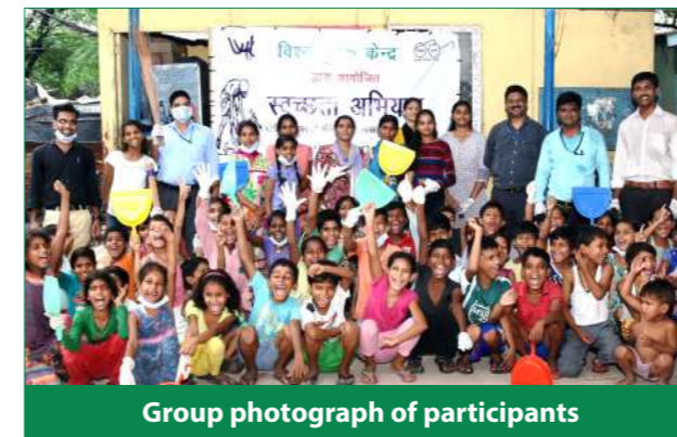
Group photograph of participants

An awareness generation programme was organized by VYK to promote "Swachh Bharath Abhiyan" among people of Vivekanand Community on 17 July, 2017. Key objective of the event was to imbibe Behaviour Change Communication (BCC) among people and sensitize them about benefits of the cleanliness to maintain a good health. Some neighboring areas were cleaned by the community youngsters to communicate the message of "Swachh Bharath Abhiyan"- Clean India Movement among people of the community. More than 50