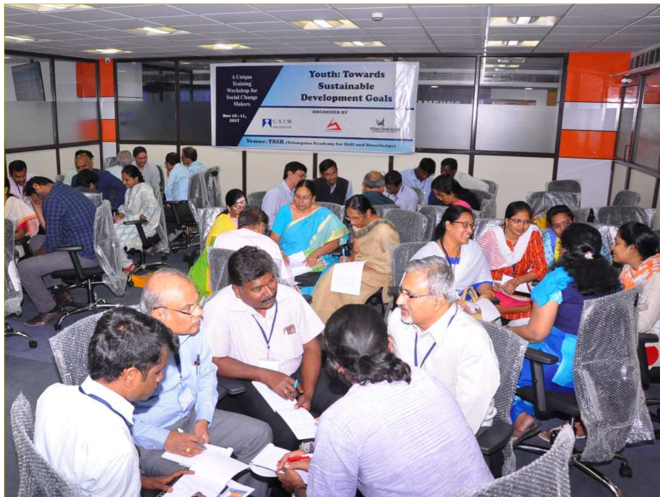
View of participants during group discussion