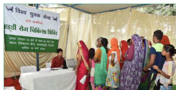
Health camp in progress