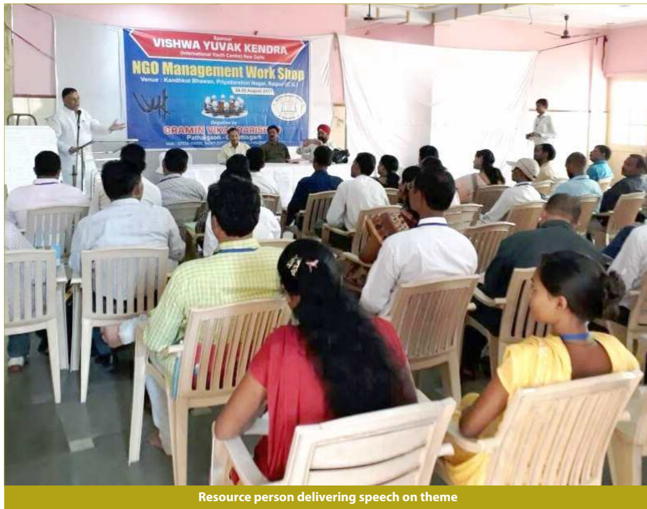
Resource person delivering speech on theme