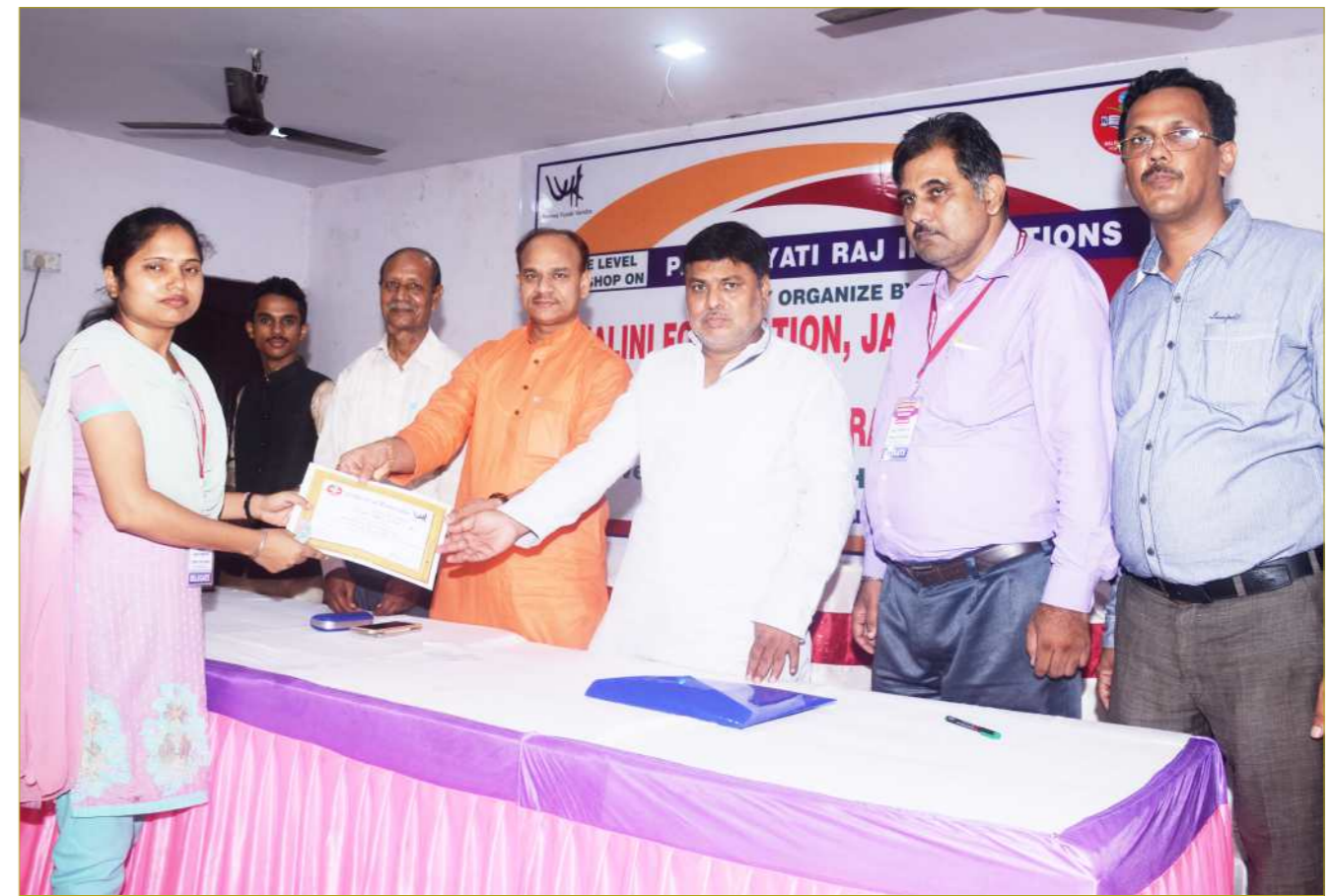
Participant receiving the certificate