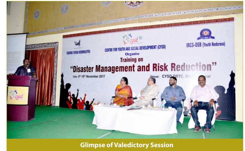
Glimpse of Valedictory Session

Vishwa Yuvak Kendra organized a three-day training programme on the subject "Disaster Management and Risk Reduction" in collaboration with Centre for Youth and Social Development (CYSD) from 08 to 10 November, 2017 at Bhubaneswar, Odisha.