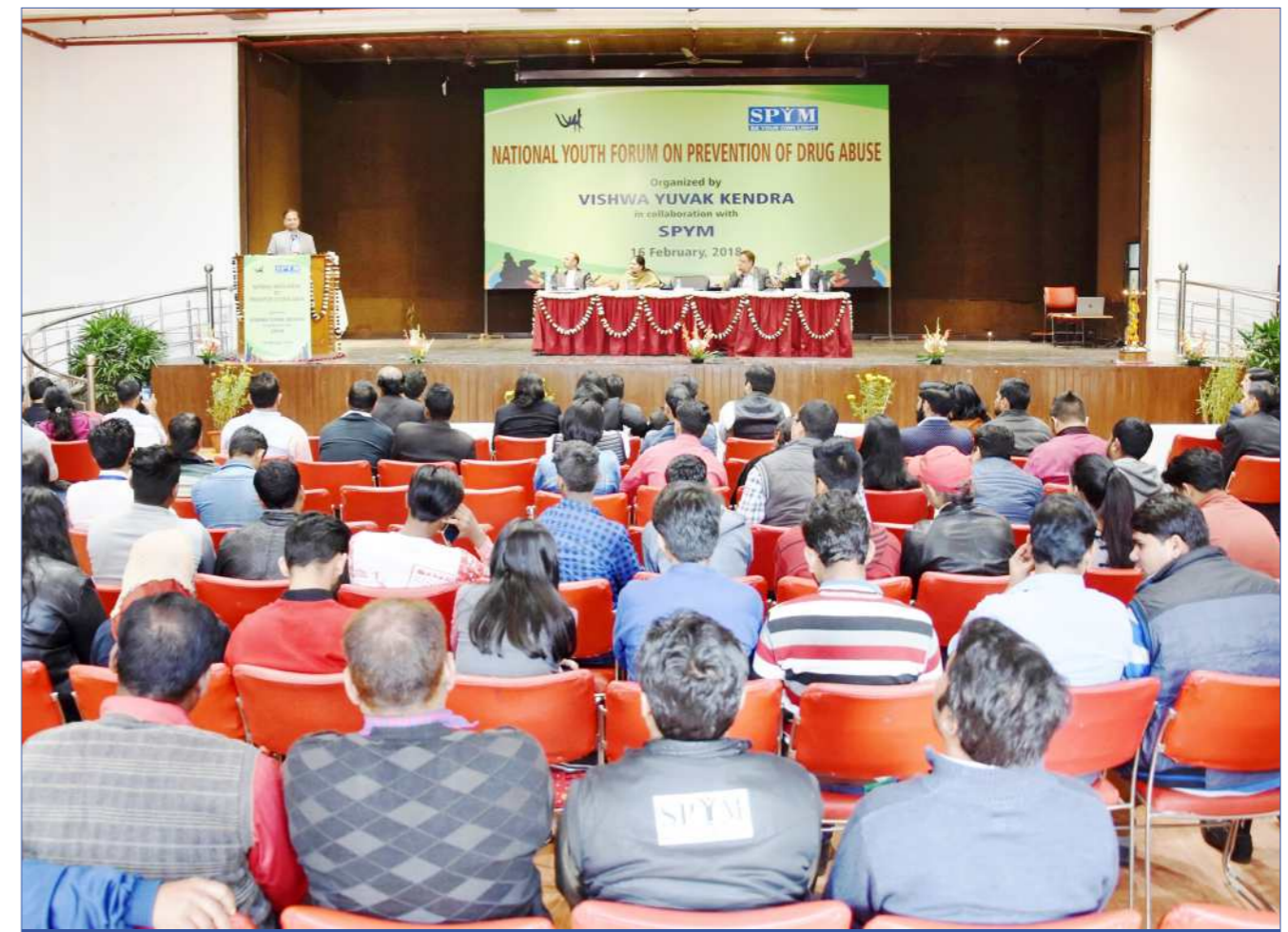
Hon'ble Minister Shri Satyendar Jain delivering inaugural speech

As part of key interventions to strengthen and promote youth, a day long programme titled as "National Youth Forum on Prevention of Drug Abuse" was organized by Vishwa Yuvak Kendra in collaboration with Society for Promotion of Youth and Masses (SPYM) on 16 February, 2018 at its campus. The programme was inaugurated by Shri Satyendar Jain, Minister of Power, PWD, Health and FW, Industries and Gurudwara Elections, Govt. of NCT of Delhi. In his inaugural address, the Minister shared his in-depth thematic views and experience with the participants.