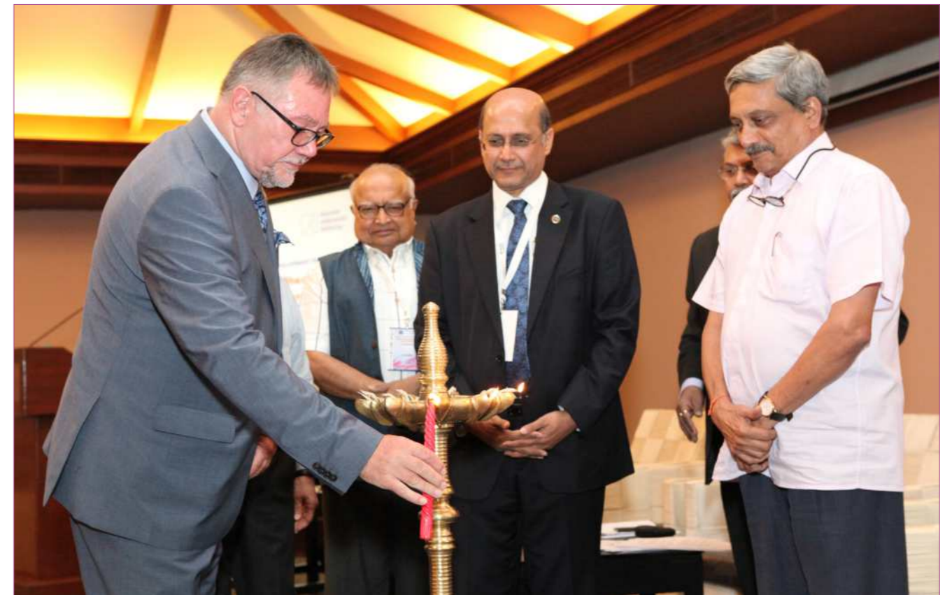
Shri Manohar Parrikar, Hon'ble Chief Minister, Goa along with other distinguished dignitaries during inaugural session

Konrad-Adenauer-Stiftung (KAS) organized the four-day 34 th Joint Staff Development Programme (JSDP) in association with PHD Chamber of Commerce and Industry (PHDCCI) from 08 to 11 September, 2017 at Goa. Some of the team members of Vishwa Yuvak Kendra (VYK) joined the programme. The theme of programme was "NGOs: Staying Ahead and Staying Relevant-Digitization (E-Banking)". Mr. Manohar Parrikar, Hon'ble Chief Minister, Goa inaugurated the programme. While delivering inaugural address, Mr. Parrikar said, "For NGOs to stay ahead, they have to be relevant. NGOs have immense role in bringing about social change and development and this change is being experienced from different parts of the country".