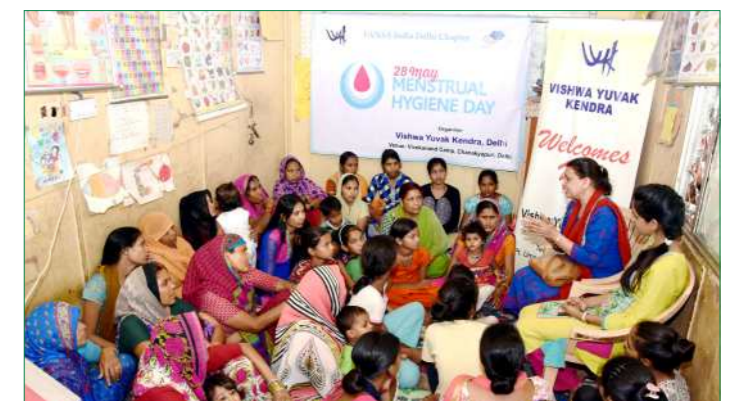
View of participants

VYK and Freshwater Action Network South Asia (FANSA) India, Delhi Chapter jointly organized the three events to celebrate "Global Menstrual Hygiene Day" at different places. Efforts were made to create awareness and promote openness through discussions about menstrual processes among women. The details of events organized, the venues and dates include: Shankar Camp, Moti Bagh, Delhi on 29 May, 2017, Vivekanand Camp, Chanakyapuri on 30 May, 2017 and SOS Children's Village, Bawana, Delhi on 31 May, 2017.