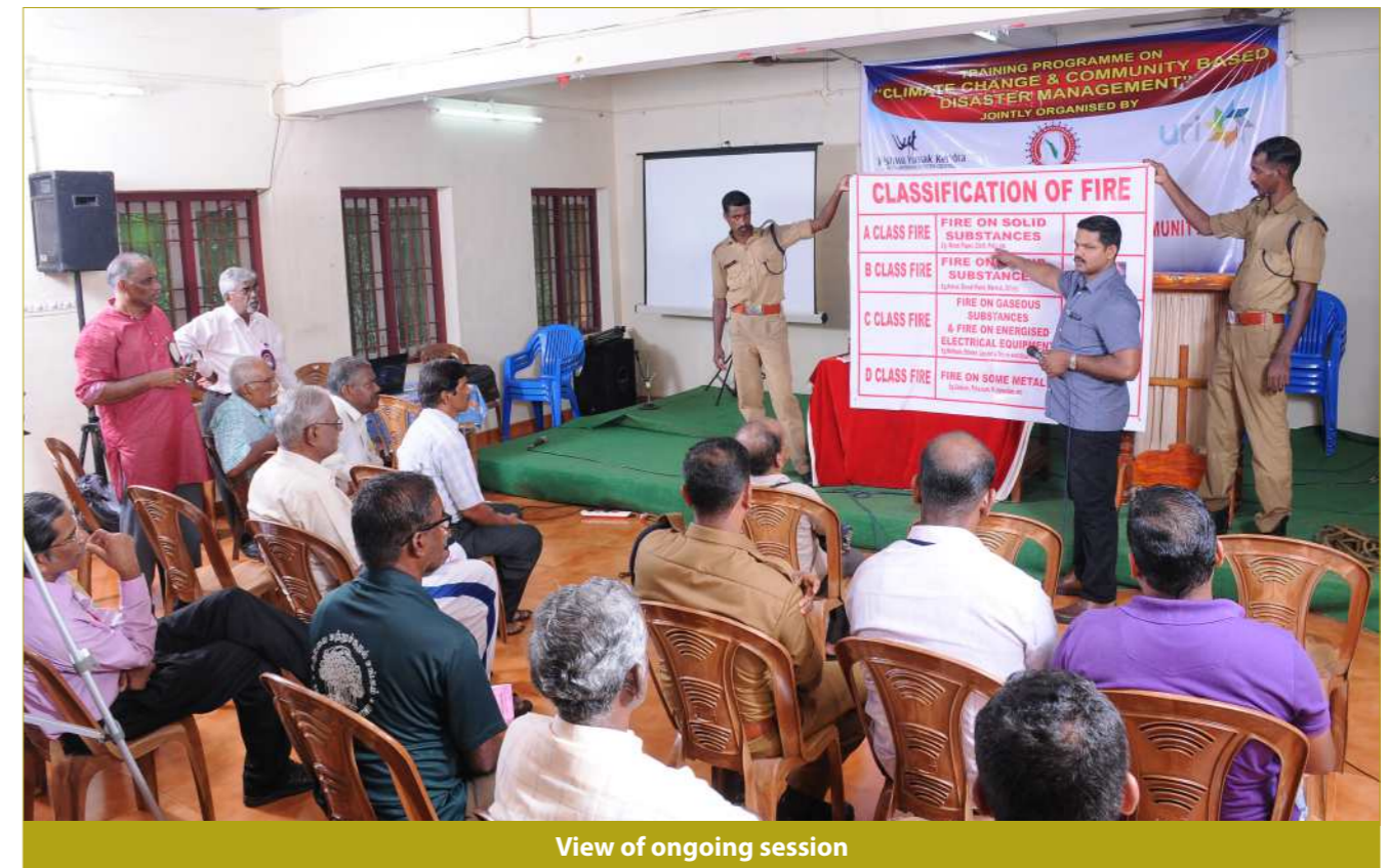
View of ongoing session