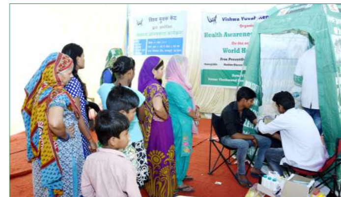
Medical check-up in progress

VYK organized an awareness generation programme to celebrate "World Health Day" on 07 April, 2017 at Vivekanand Camp. The objective of the event was to create awareness and convey a message about 'Depression' among the people. The people were informed about causes and after maths of Depression and shared about its common symptoms with them. Simultaneously, a free health check-up camp was also organized jointly with the NGO 'Swasth Gram'. During the event, Hemoglobin, Random Glucose, Blood Pressure and BMI medical tests of the beneficiaries were carried out. A total of 71 patients were covered during the event.