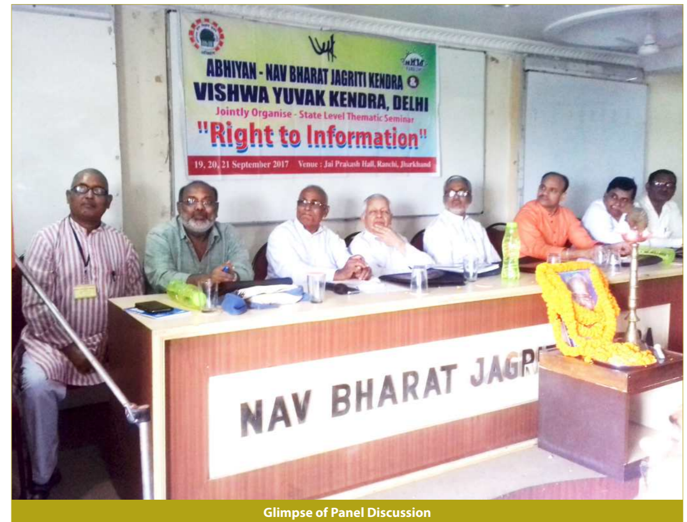
Glimpse of Panel Discussion