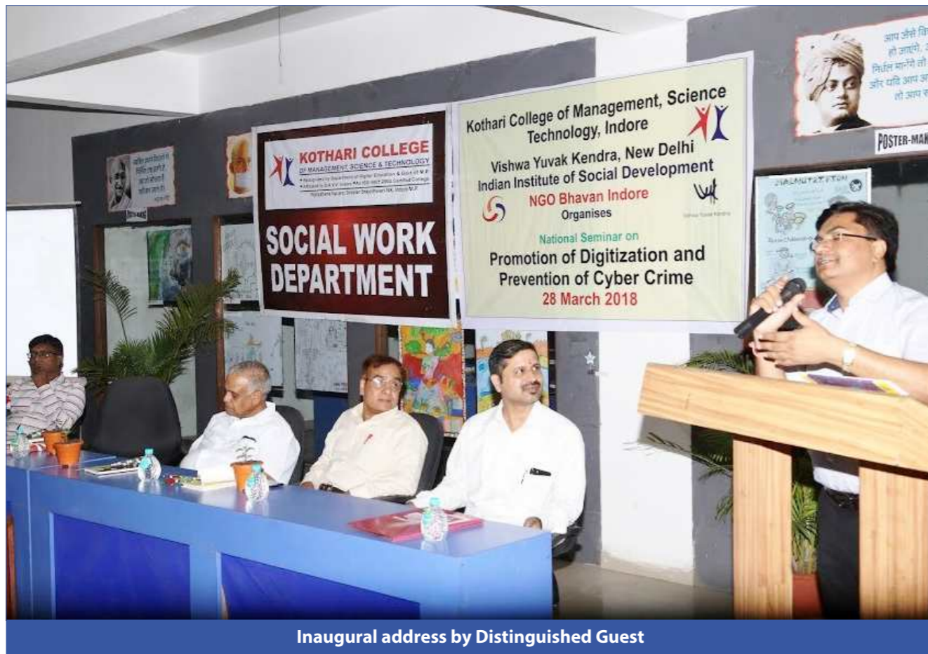
Inaugural address by Distinguished Guest