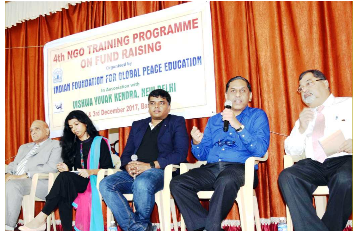
Panelist sharing their views on Corporate Social Responsibility