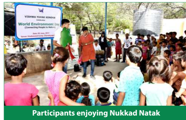
Participants enjoying Nukkad Natak

VYK organized an awareness generation programme on environment and observed the "World Environment Day" on 05 June, 2017 at Vivekananda Camp, Chanakyapuri, Delhi. The community people were educated about different processes and methods of environmental protection through Nukkad Natak. The participants were also shared with information, messages and quotes to save the environment for the people by the people.