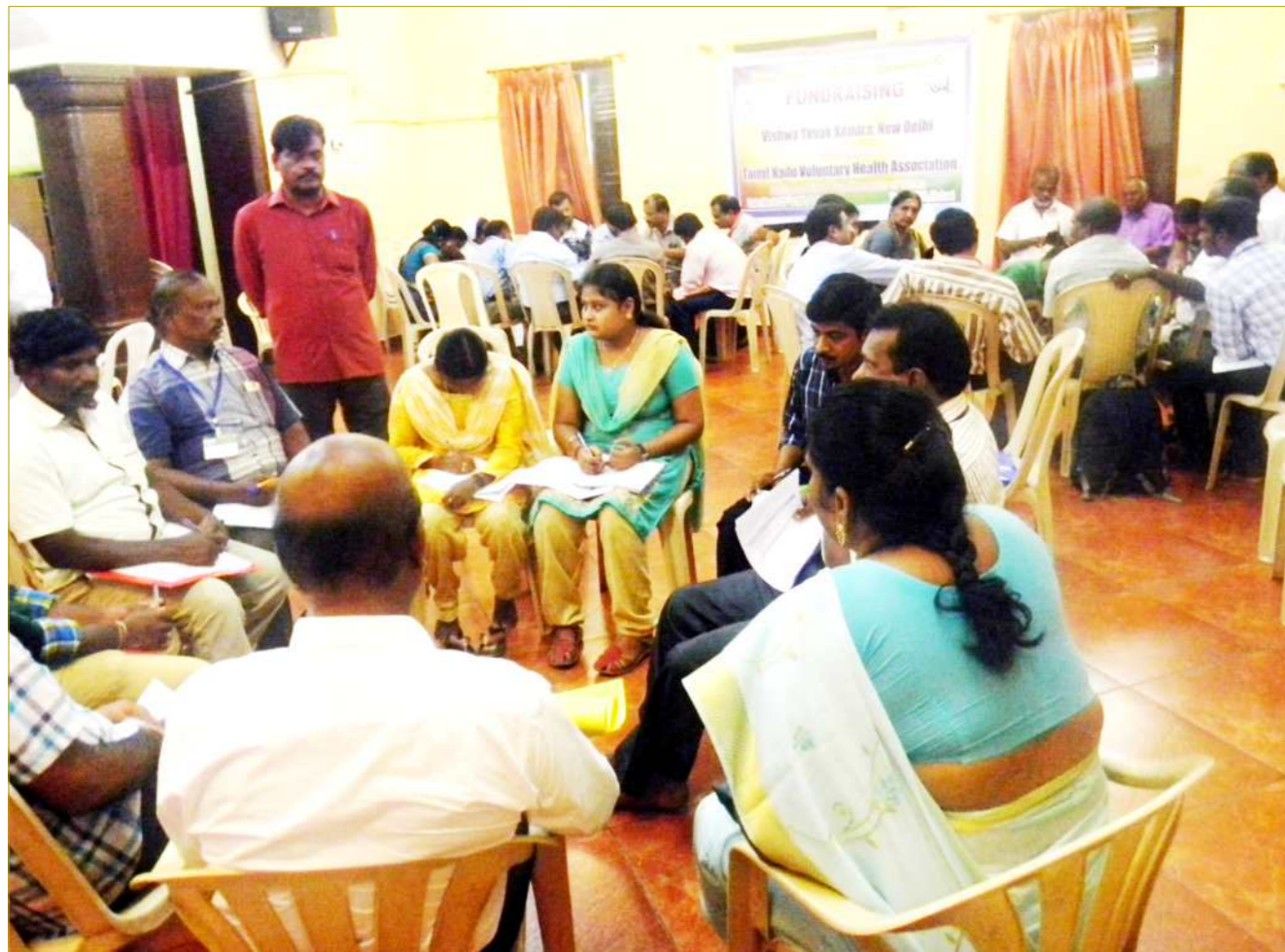
View of participants during group discussion