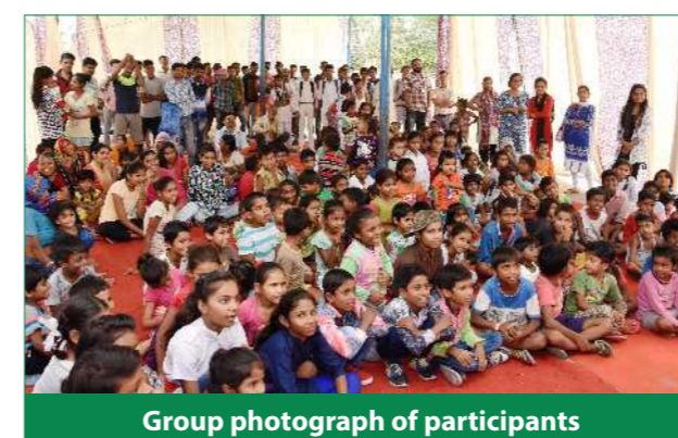
Group photograph of participants

To sensitize community people about adverse effects of pollution, a road show titled as "Disadvantages of Crackers and How to Promote Cracker Free Diwali" was organized by VYK on 11 October, 2017 at Vivekanand Camp, Chanakyapuri, New Delhi. The subsequent event was organized on 18 October, 2017 at Shankar Camp, Moti Bagh, New Delhi. The participants were encouraged to celebrate Diwali with igniting candles, enjoying multiple edibles and organize cultural activities to celebrate eco-friendly Diwali.