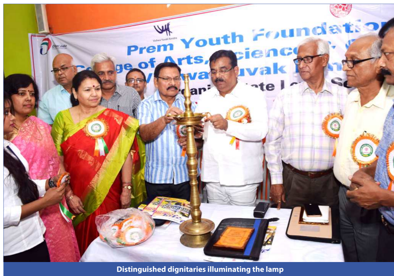
Distinguished dignitaries illuminating the lamp

As part of Institutional Tie-up programme, a daylong seminar on "Promotion of Digitization and Prevention of Cybercrime" was organized by VYK in association with Prem Youth Foundation and College of Commerce, Arts & Science for the students on 27 March, 2018 at, Patna, Bihar. The objective of seminar was to create awareness about cybercrime and update participants with basic steps to prevent cybercrimes. Cybercrime is an issue which impacts the lives of many Indians. Common types of cybercrime include hacking, online scams and fraud, identity theft, attacks on computer systems and illegal or prohibited online content. The effect of cybercrime can be extremely upsetting for victims, and not necessarily just for financial reasons.