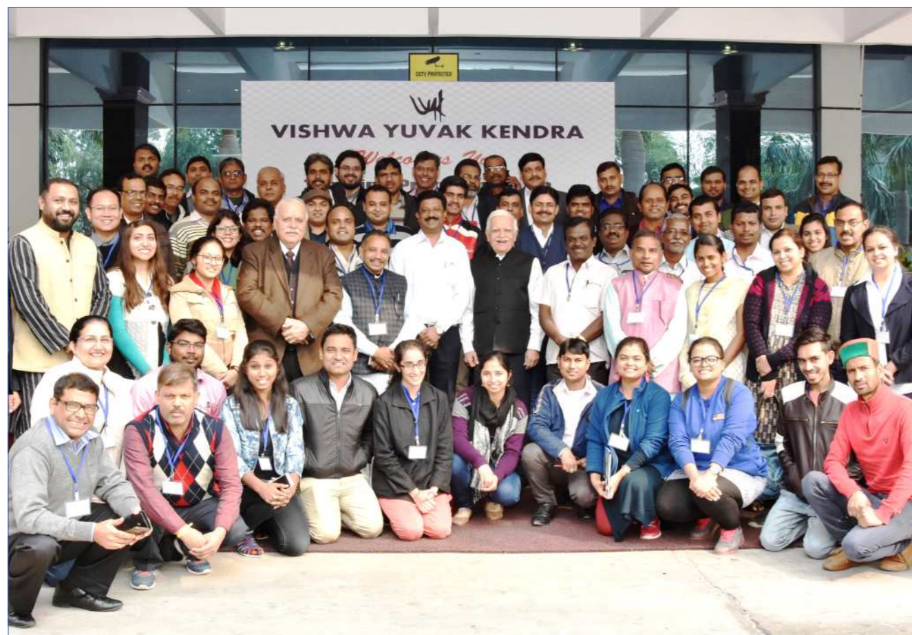
Group photograph of participants