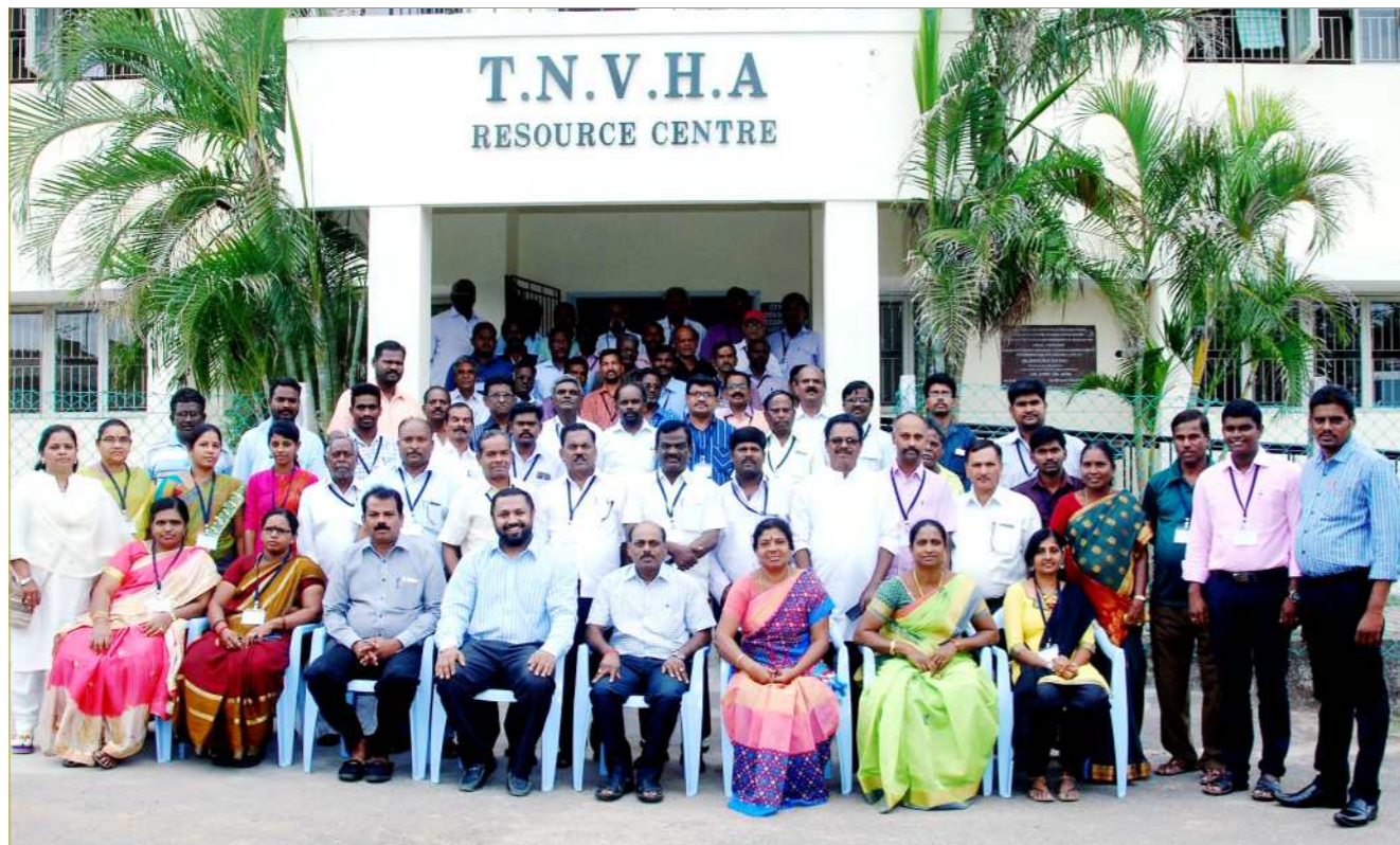
Group photograph of participants