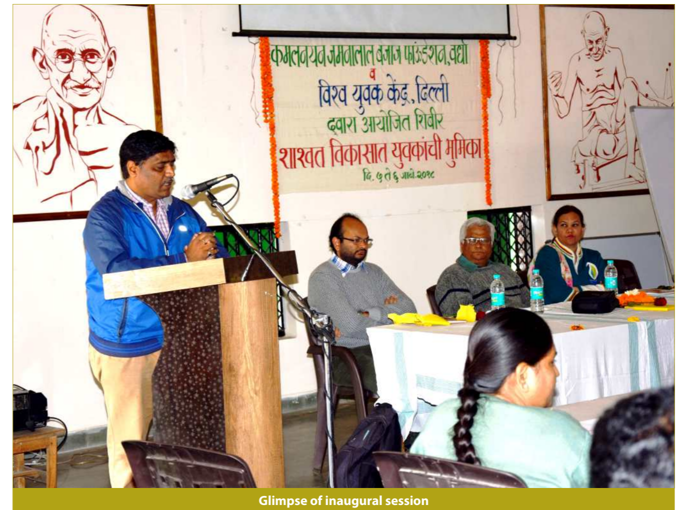
Glimpse of inaugural session