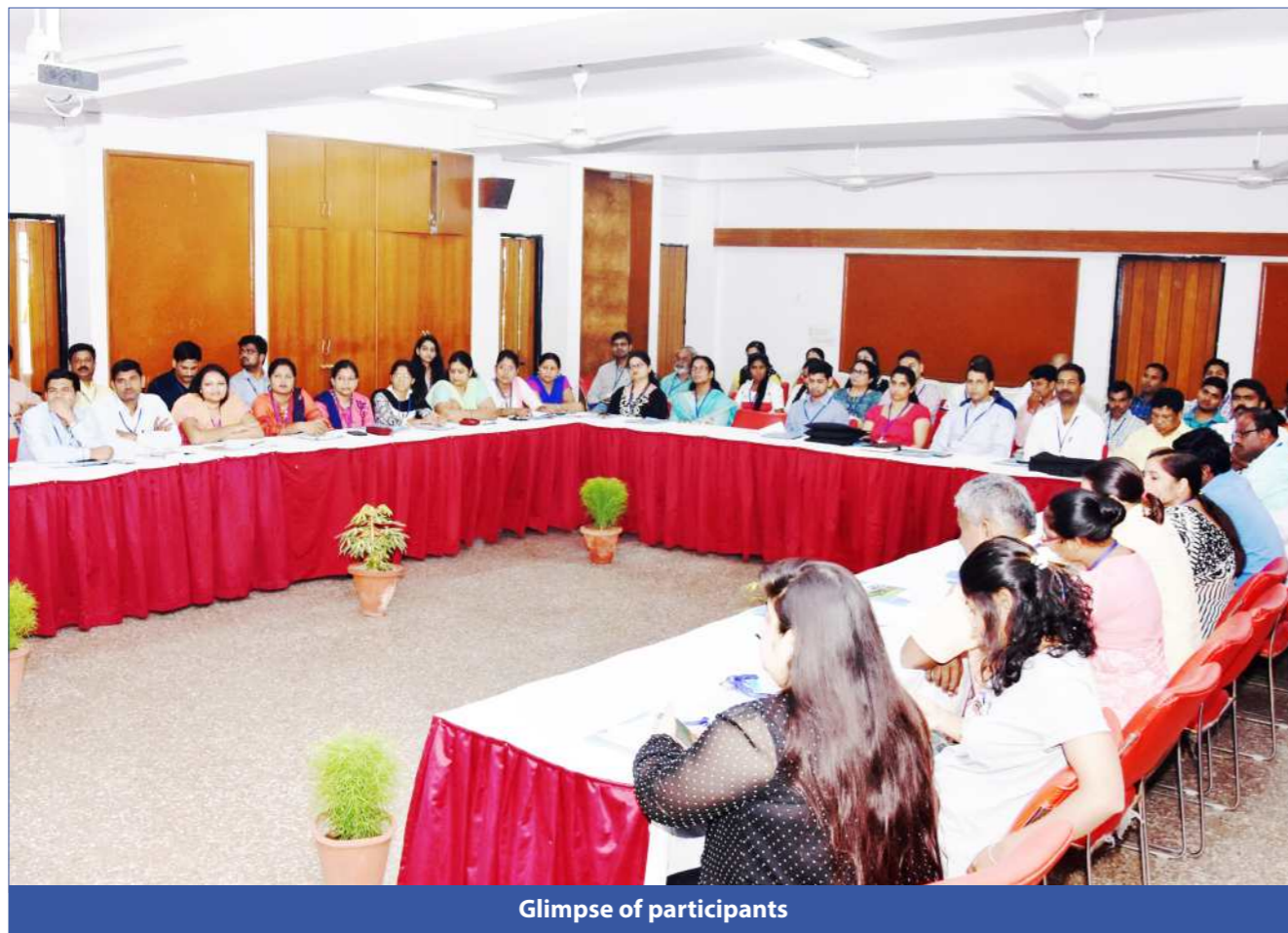
Glimpse of participants