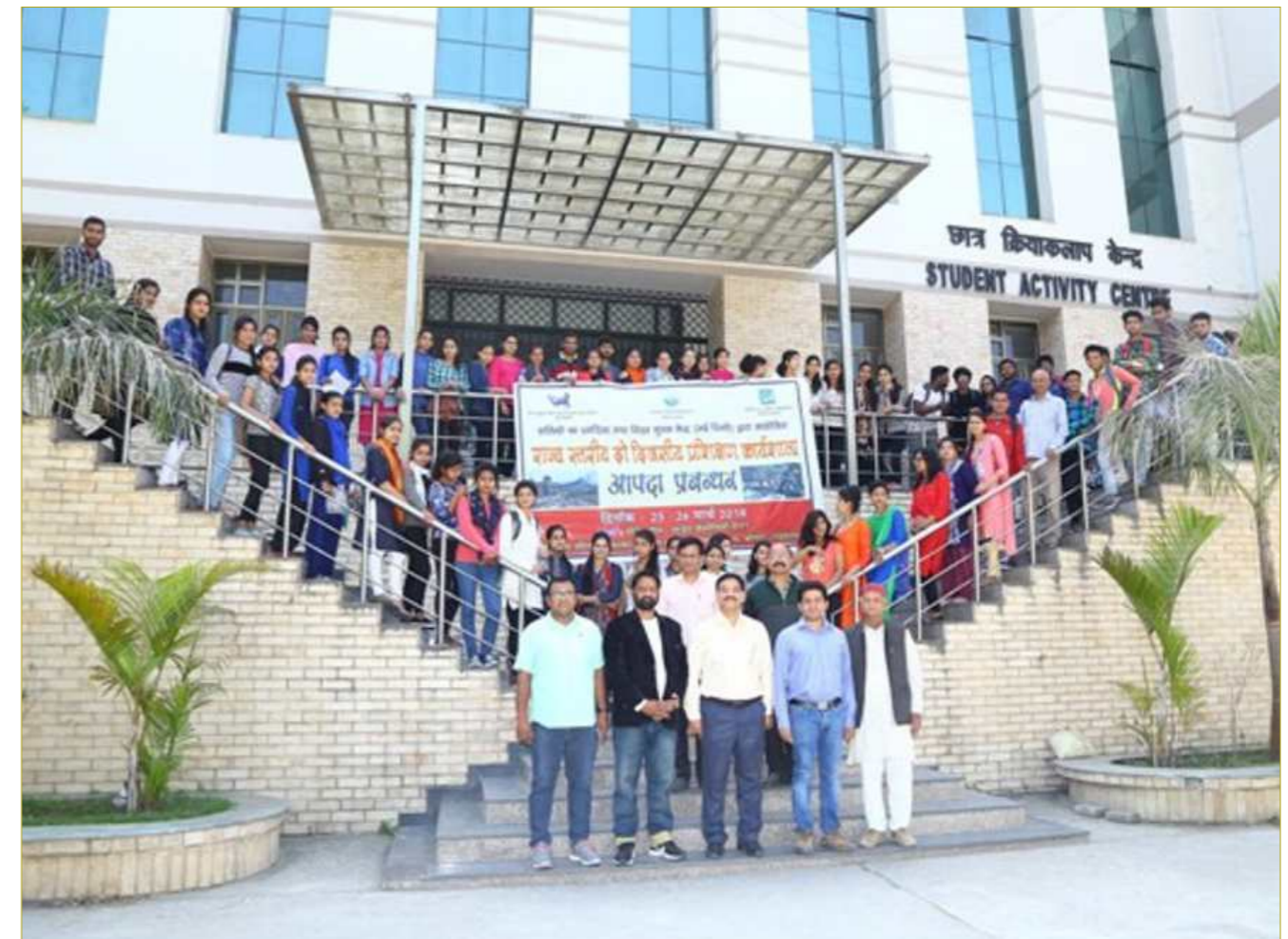
Group photograph of participants