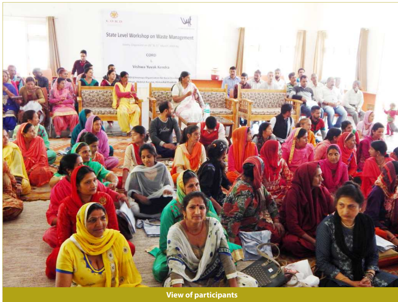
View of participants