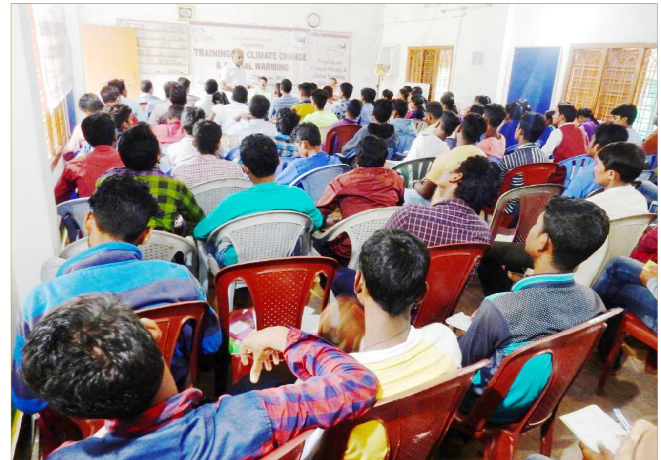
Resource person highlighting on the facts and findings on the Climate Change